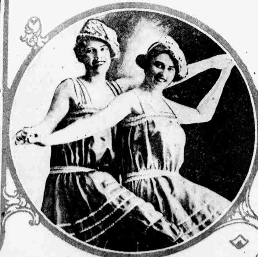
VISITORS AT THE WILLIAM PENN WILL FIND THE "TWO SONGSTERS," A HEADLINER