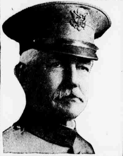
THE SAMMEES' FAMILY DOCTOR A new photograph of Surgeon General William C. Gorgas, chief of the medical forces of the United States.