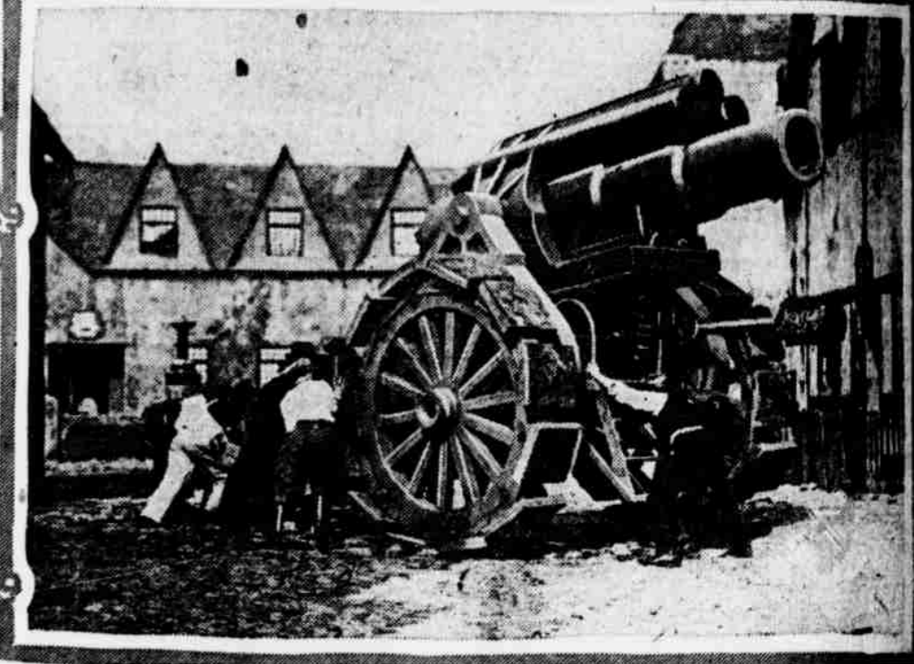
NEWLY ORGANIZED "CAMOUFLAGE CORPS" DRILLS FOR FIRST TIME Nearly one-third of this newest unit for the United States army is comprised of Los Angeles moving-picture actors. They are shown with one of the "fake" guns which will be used to draw the Germans' fire.