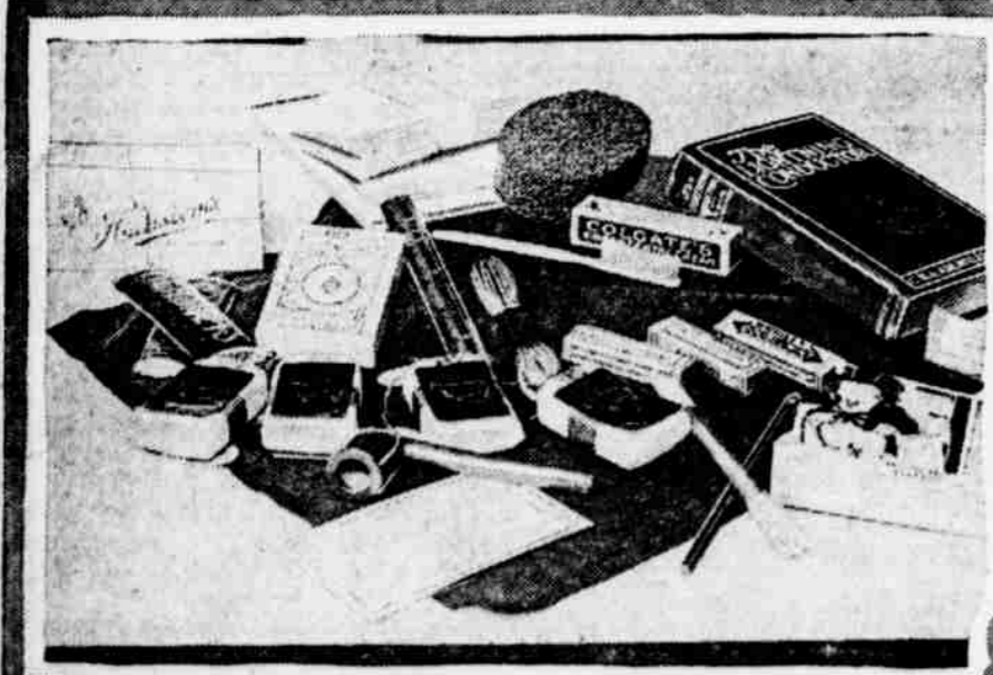
RED CROSS CHRISTMAS KIT FOR A SAMMEE. THOUSANDS OF THESE ARE BEING ASSEMBLED AND PACKED AT THE INDEPENDENCE SQUARE AUXILIARY, AT 608 CHESTNUT STREET