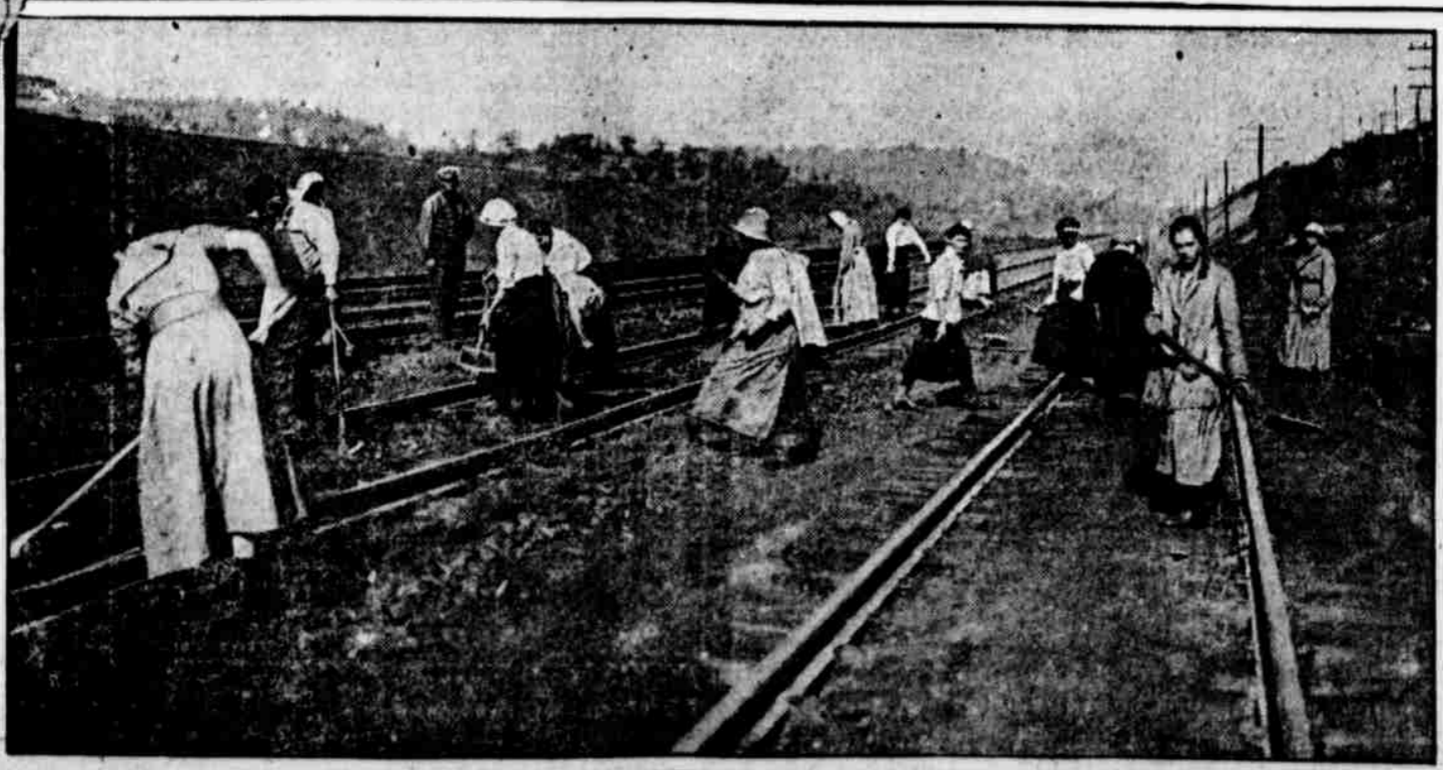
FLOATING "GANG" OF FEMALE LABORERS WORKING ON THE ROADBED OF THE WESTERN PENNSYLVANIA DIVISION OF THE PENNSYLVANIA RAILROAD A FEW MILES EAST OF PITTSBURGH