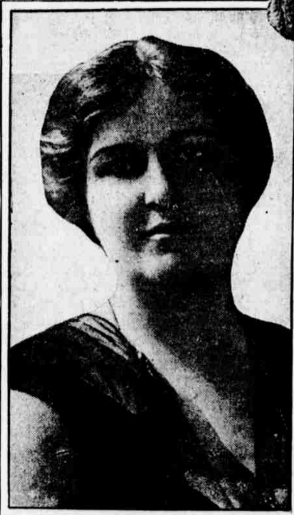
MRS. HELENA HILL WEED, WHO WILL LECTURE ON SUFFRAGE PICKETING AT WASHINGTON BEFORE THE NATIONAL WOMAN'S PARTY CONVENTION HERE TONIGHT