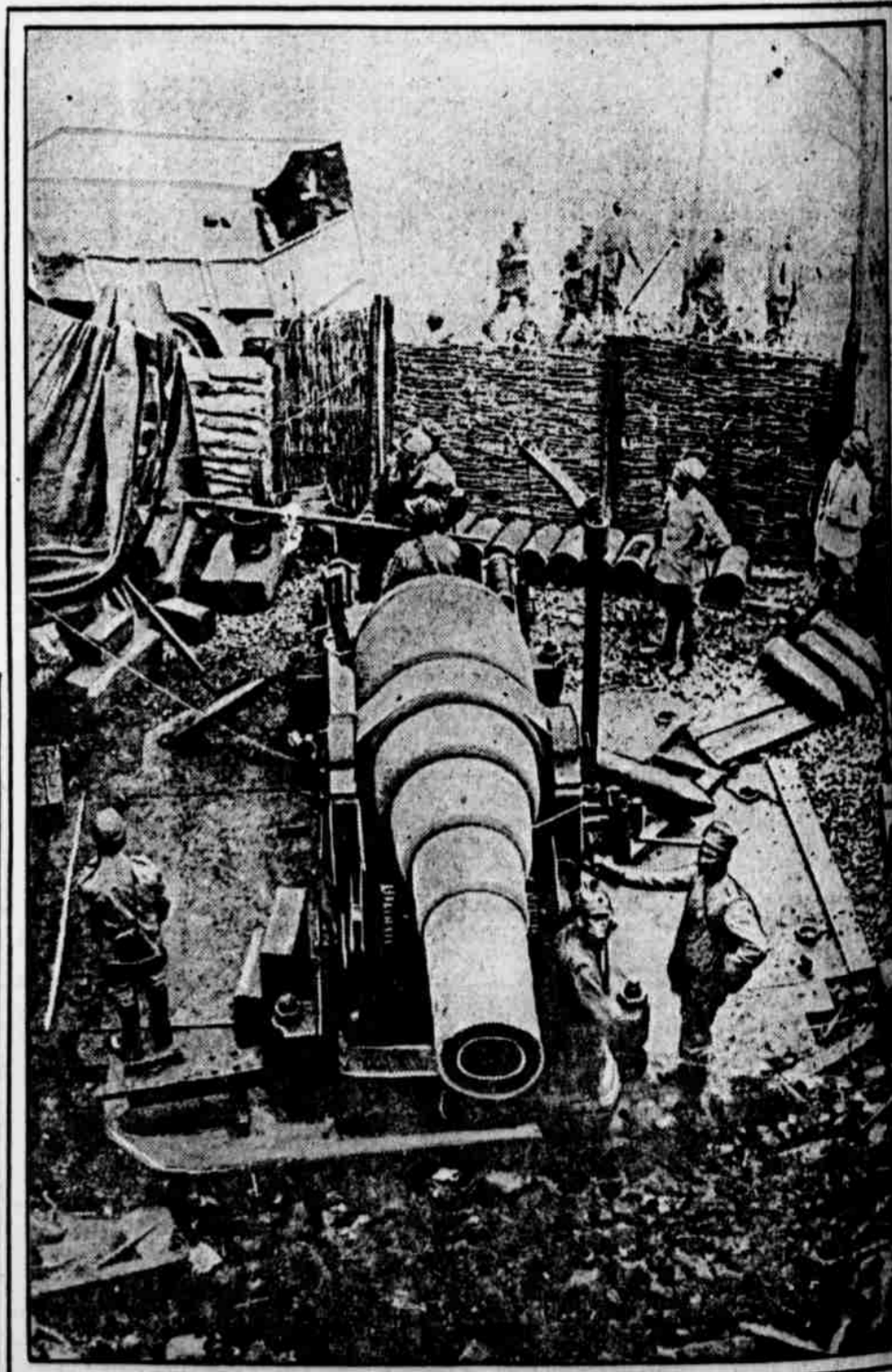
GREAT ITALIAN HOWITZER IN A CONCEALED PIT ON THE LINE OF THE ARDIE, TO WHICH THE LATINS MAY HAVE TO RETREAT