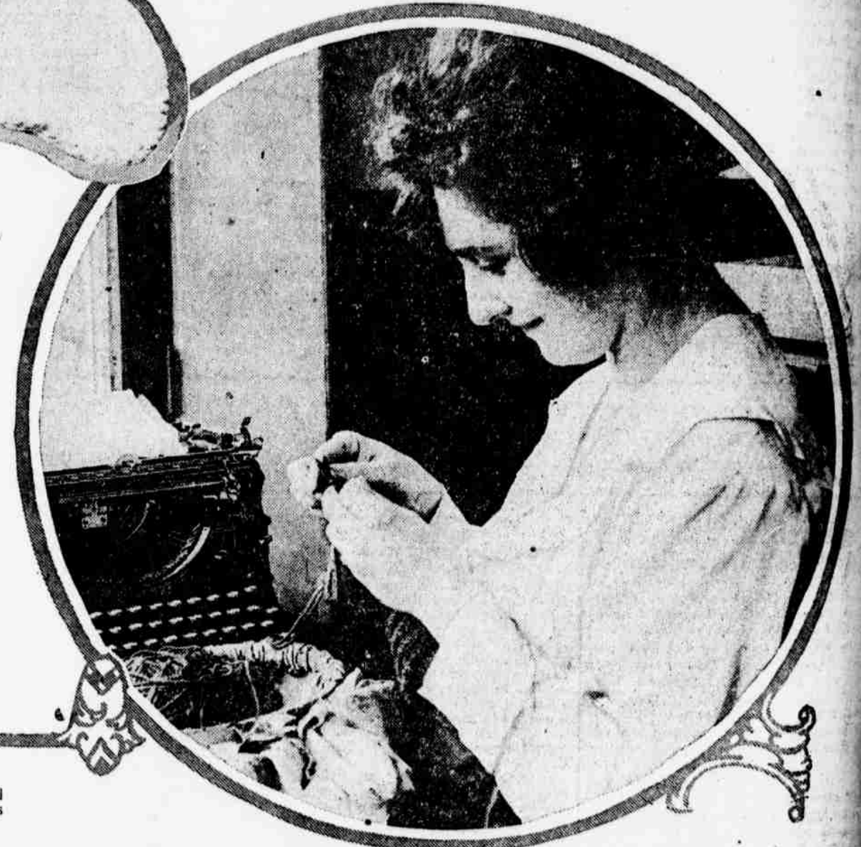
WHENEVER YOU FIND A MINUTE TO SPARE—KNIT! This girl stenographer utilizes her idle moments in a Philadelphia business house to work on some useful article for a Sammie. Her employers approve of her patriotism.