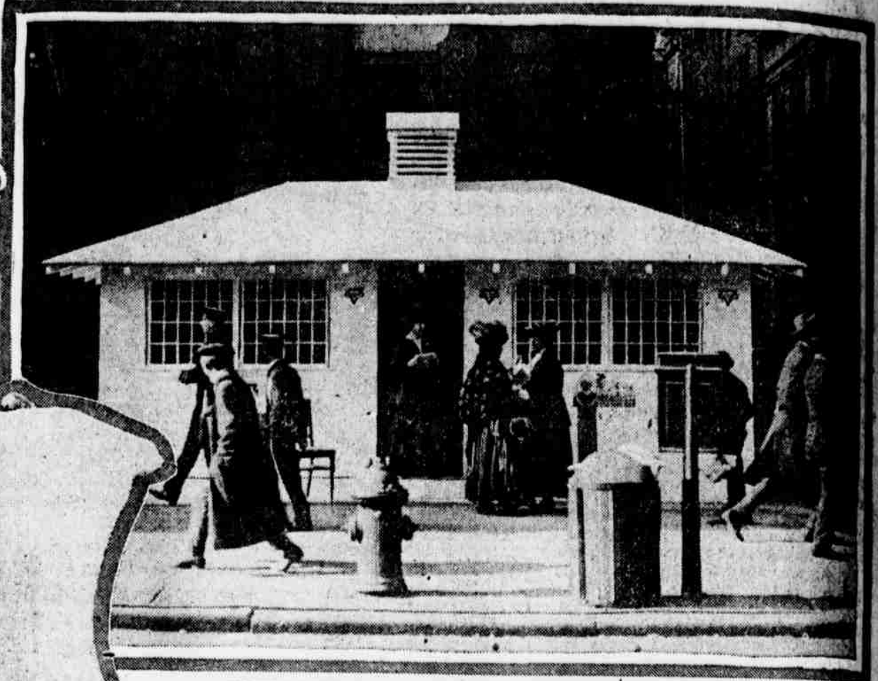
FIRST OF THE Y. M. C. A. HUTS COMPLETED AT UNION LEAGUE The little red triangle booths are the rendezvous of energetic collectors for the $35,000,000 war fund, who have helped carry Philadelphia's contribution beyond the million mark.