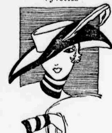
A study in black and tan-+just the part of the brim that's turned up and actually shows at first glance is faced in black velvet.

THE value of the stenographer or the It is a rougher, a franker, a more honh the value of any service. Unfortu- Barring the ground for just complaint, nately, all human beings are not able to every fellow allows his neighbor a little feel a detached attitude toward those neutral zone, where he may fame and of their domestic establishments into their man in the office is best pleased with the fuss for the satisfaction of having all to let him be grouchy without making hands fly to the rescue.