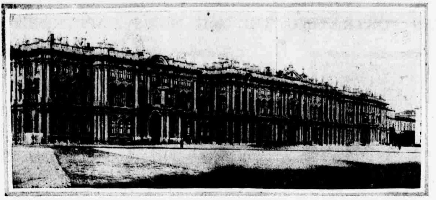
Rasputin was not only a frequent visitor to the many imperial palaces, but he had a suite of rooms reserved for his own use in the Winter palace. This great building immediately after the revolution became the headquarters of the revolutionary forces and later was turned over to the American Commission to Russia.

The resignation of these two statesmen was preceded by one of the most scandalous incidents in Russian modern history, the trial of Mr. Manussewitsch-Maniuloff. This had been put off from day to day for a considerable length of time until at last it became impossible to secure further delay. The culprit had taken good care, as I have already indicated, to put in safety documents of a most incriminating nature, implicating many persons whom the authorities could not afford to see mixed up in the dirty business connected with the numerous sins of Mr. Sturmer's private secretary. When the latter was questioned by the examining magistrate in regard to that last transaction which had brought him into court he declared that he ad acted in accordance with the instructions which he had received from his chief and that it was not he himself but the Prime Minister who had received the money which the bank that had lodged a com-