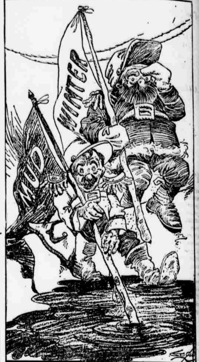
OLD GENERALS WHO ARE MAKING THINGS HUM AT THE FRONT