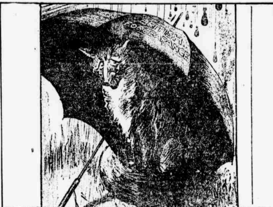
Williams, in London Opinion. IMMUNE FROM REPRISALS. The Kaiser: "Well, it's been a wonderful protection—so far."