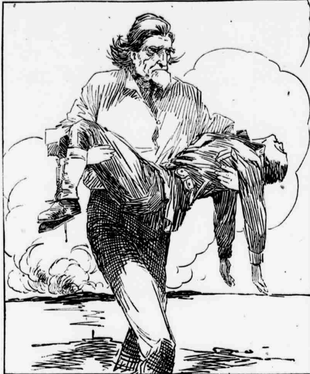
BRINGING THE TRUTH HOME TO US