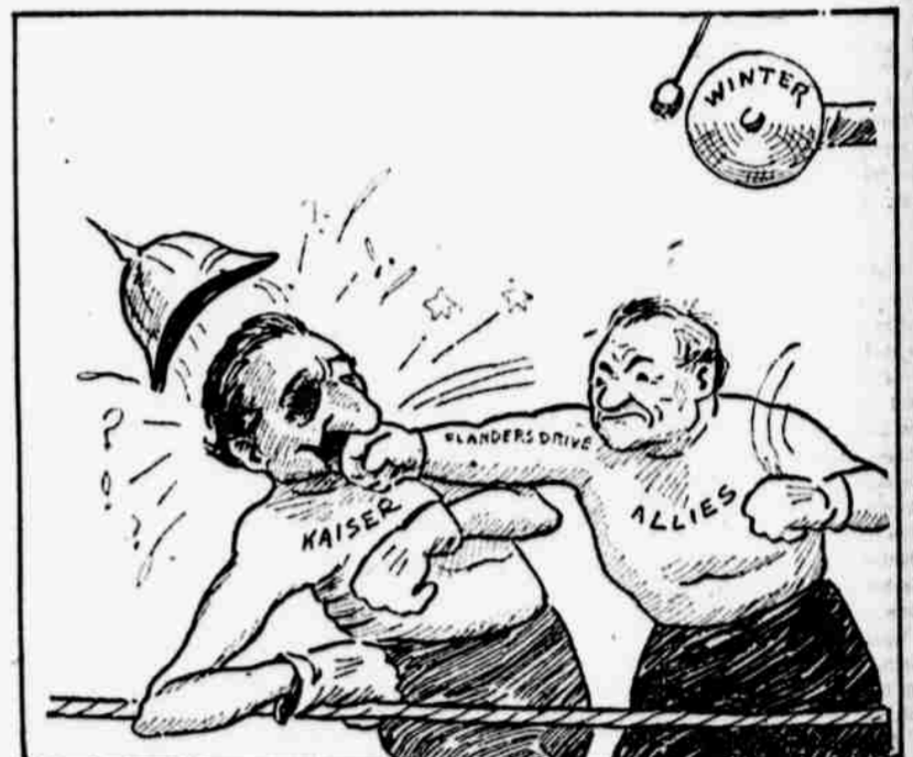
Hammou, in Wichita (Kan.) Eagle. ONLY THE BELL CAN SAVE HIM