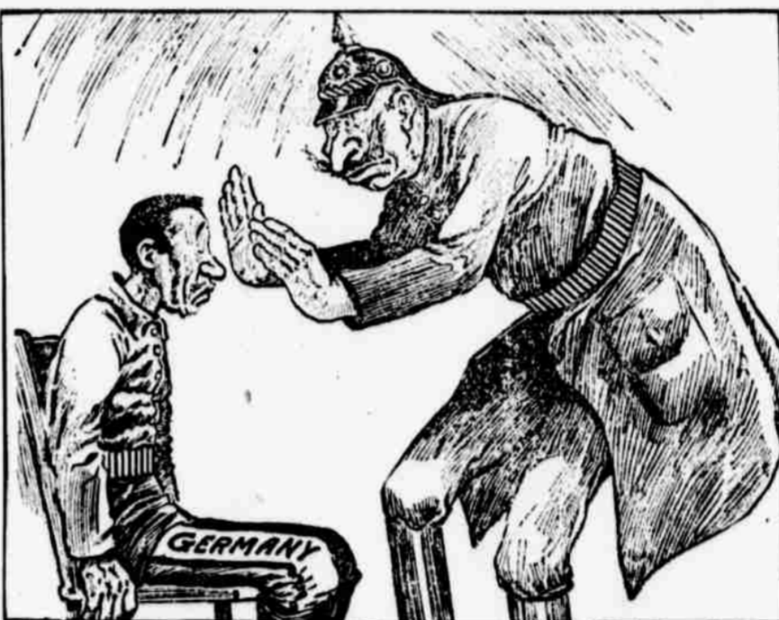
Greene, in New York Evening Telegram. ANOTHER RASPUTIN