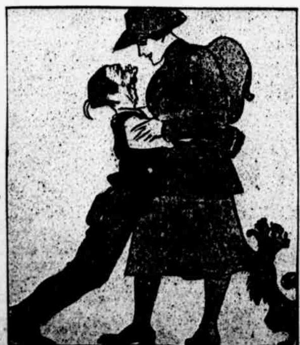
From London Opinion. HOME ON LEAVE