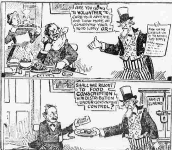
North, in Tacoma (Wash.) Ledger SHALL WE VOLUNTEER OR HAVE FOOD CONSCRIPTION?