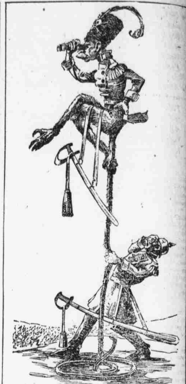
HIS ROYAL HIGHNESS