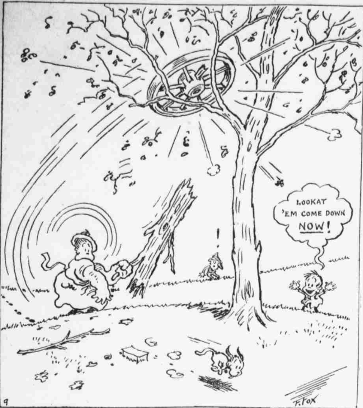
By FONTAINE FOX.

THROWING STICKS AND PIECES OF WOOD DIDN'T BRING DOWN THE NUTS FAST ENOUGH TO SUIT THE POWERFUL KATRINKA