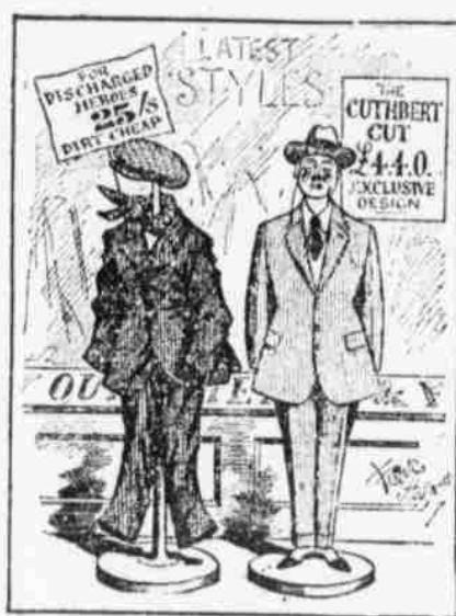
From Reynolds's Newspaper, London FASHIONS FOR MEN—READY MADE AND TO MEASURE

Before Meat He was awfully wild. In fact, he was most wildly wild. "I tell you once and for all," he roared at his erring offspring. "If you marry Grace I'll cut you off without a penny, and you won't have so much as a piece of beef to boil in the pot!" "Well," said the young man, as he went in search of the parson. "Grace becom' meat!"