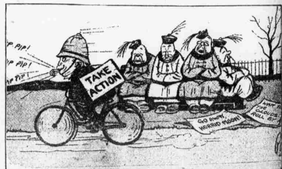
From London (England) Evening News THAT'S RIGHT, DAVID; WAKE 'EM UP!