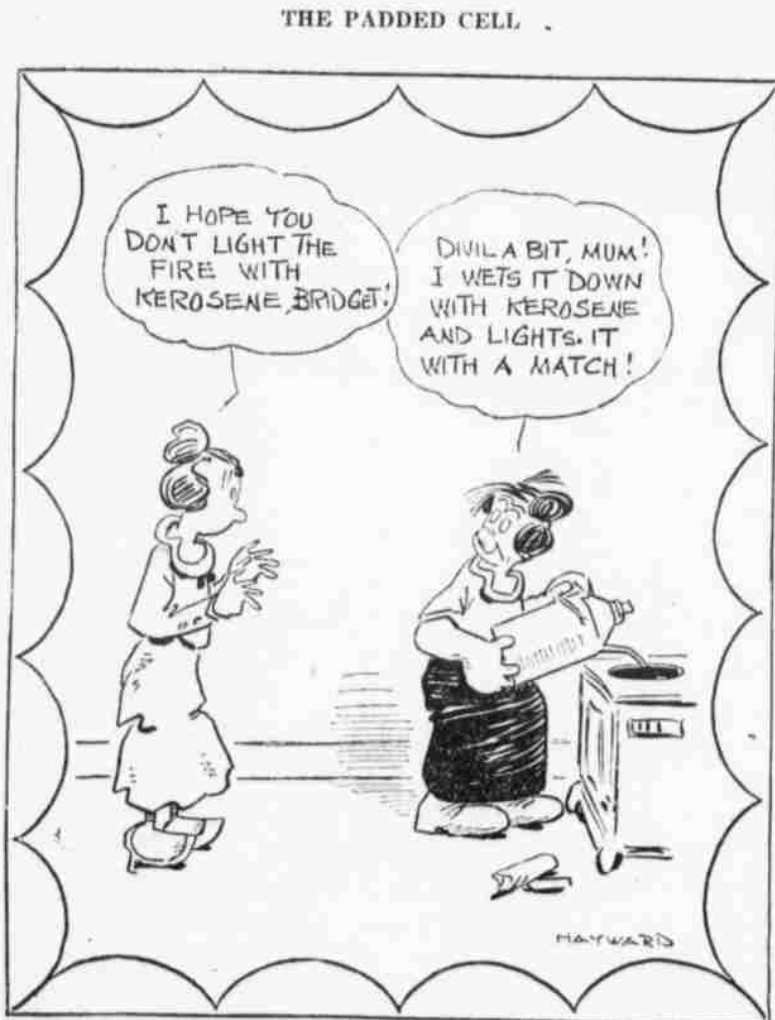
THE PADDED CELL

—Fit-Bits. Slow-pay—I shall bring you back those dark trousers to be resented, Mr. Snip; you know I sit a good deal. Mr. Snip (taller)—All right; and if you'll bring the bill I sent you six months ago I will be pleased to receipt that also. You know I've stood a good deal.