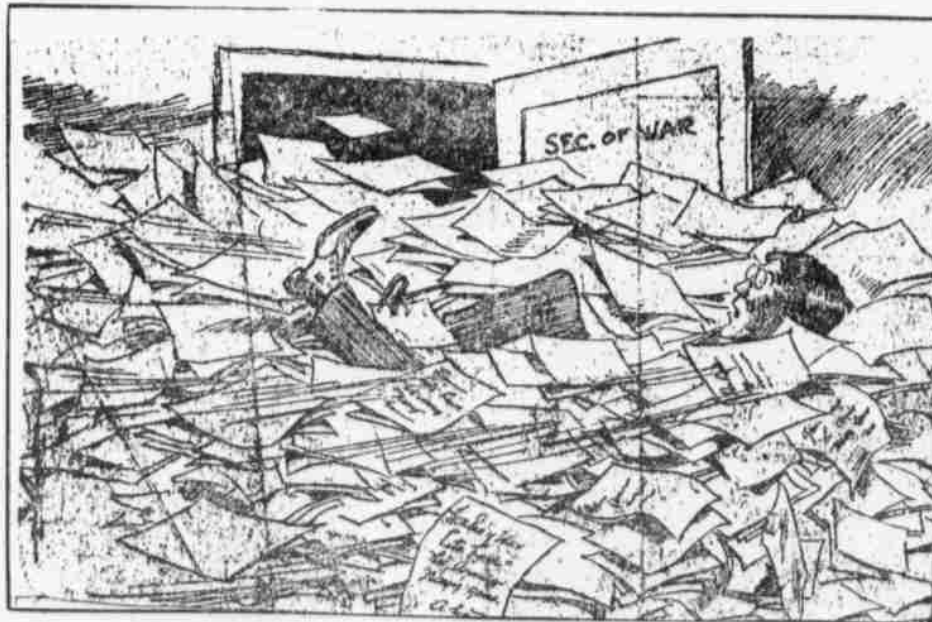
BARRAGE FIRE FOR AN ARMY-NAVY GAME