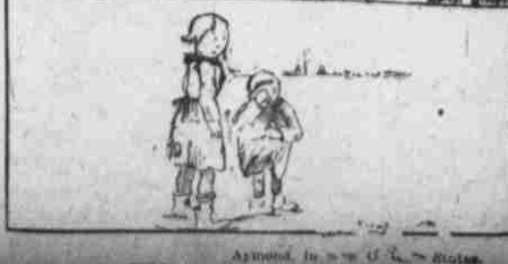
EQUAL TO A SLACKER

THAT ISN'T IT? IT'S A SMALL SACRIFICE TO HAVE A PINEAPPLE DAY AND HELP WIN THE WAR!