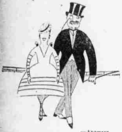
Twice in the Wrong

Answers. He—Well, I admit I made a mistake. She—You made two. He—What was the second? She—Owing up to the first.