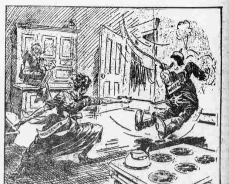
MOTHER STARTS INTENSIVE TRAINING