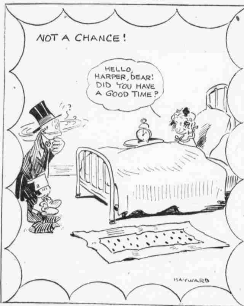
THE PADDED CELL

London Opinion. Obliging Seaside Cabman—Shall I put that bag on the front, mum? Old Lady—No, thank you. Your poor horse doesn't look very strong, and he's a lot to drag, so I'll just take the bag on my knees.