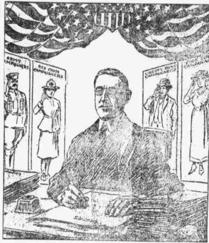
TO THE GENERAL OF ALL THE CAMPAIGNS