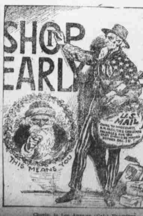
SIGN OF THE TIMES