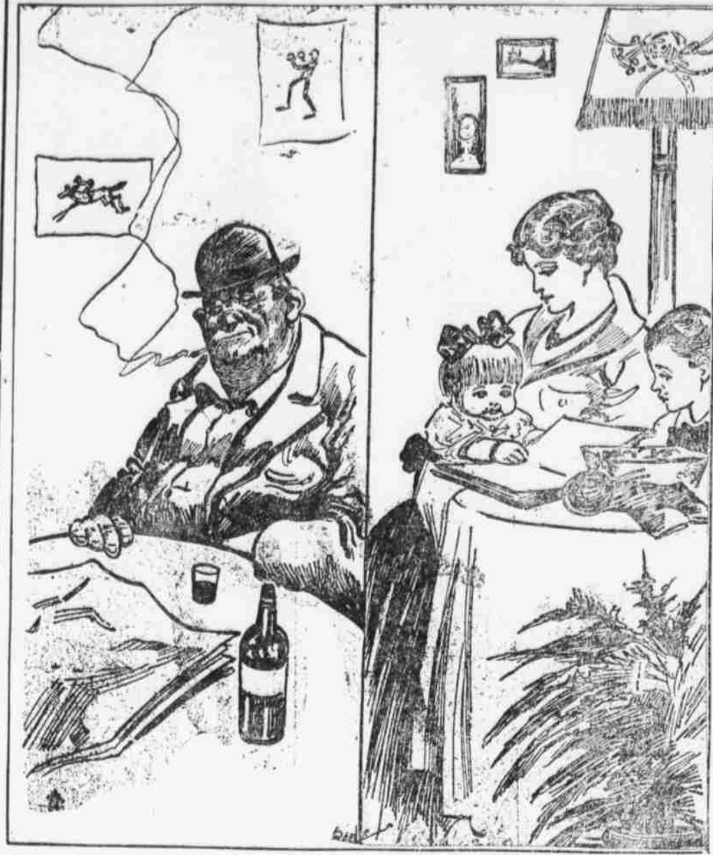
IF THIS CAN VOTE—WHY CAN'T SHE?