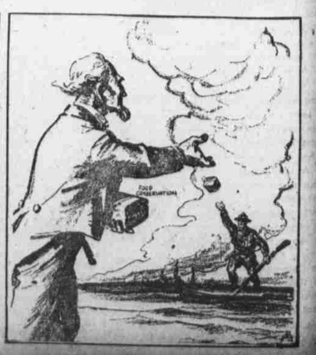
DIVIDE WITH THE BOYS "OVER THE TOP"