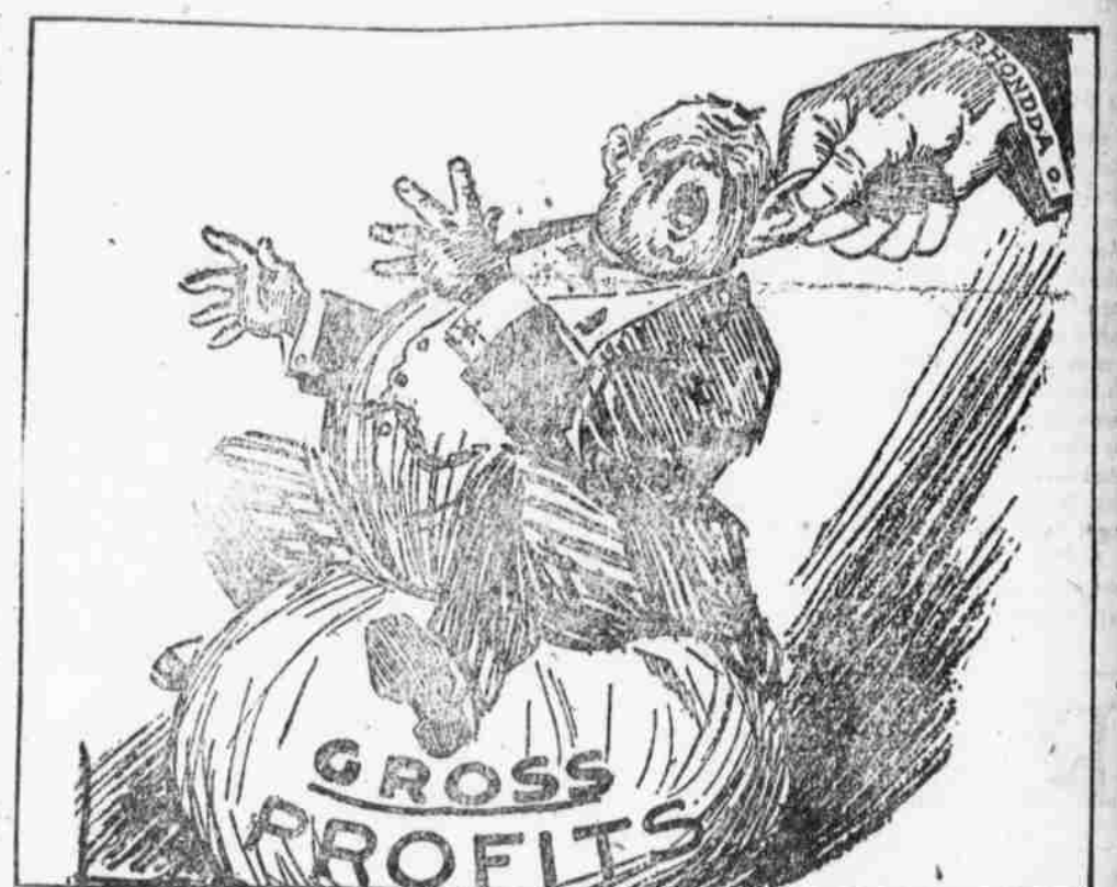
HOW ENGLAND DEALS WITH THE "PROFIT-EAR"