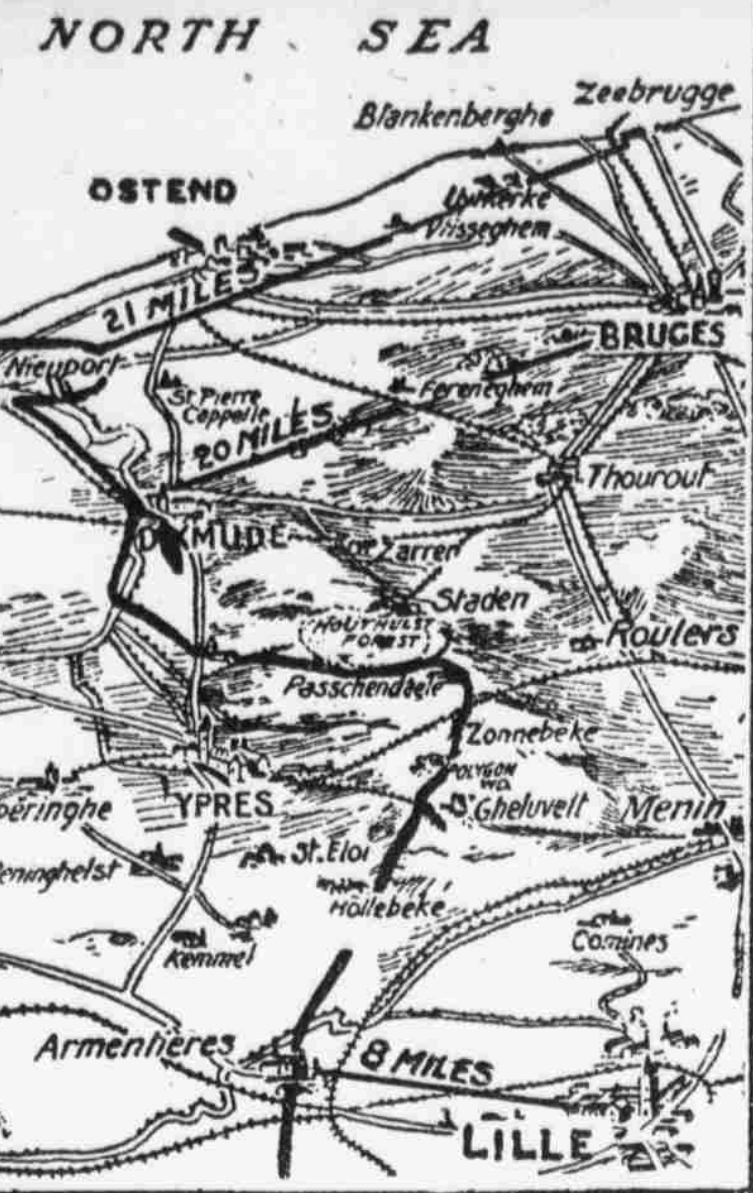
Roulers, key to the railway lines leading to the U-boat bases of Ostend and Zeebrugge, is reported to be under British bombardment. The map shows the location of this strategic point and the surrounding places in line of the latest British advance.