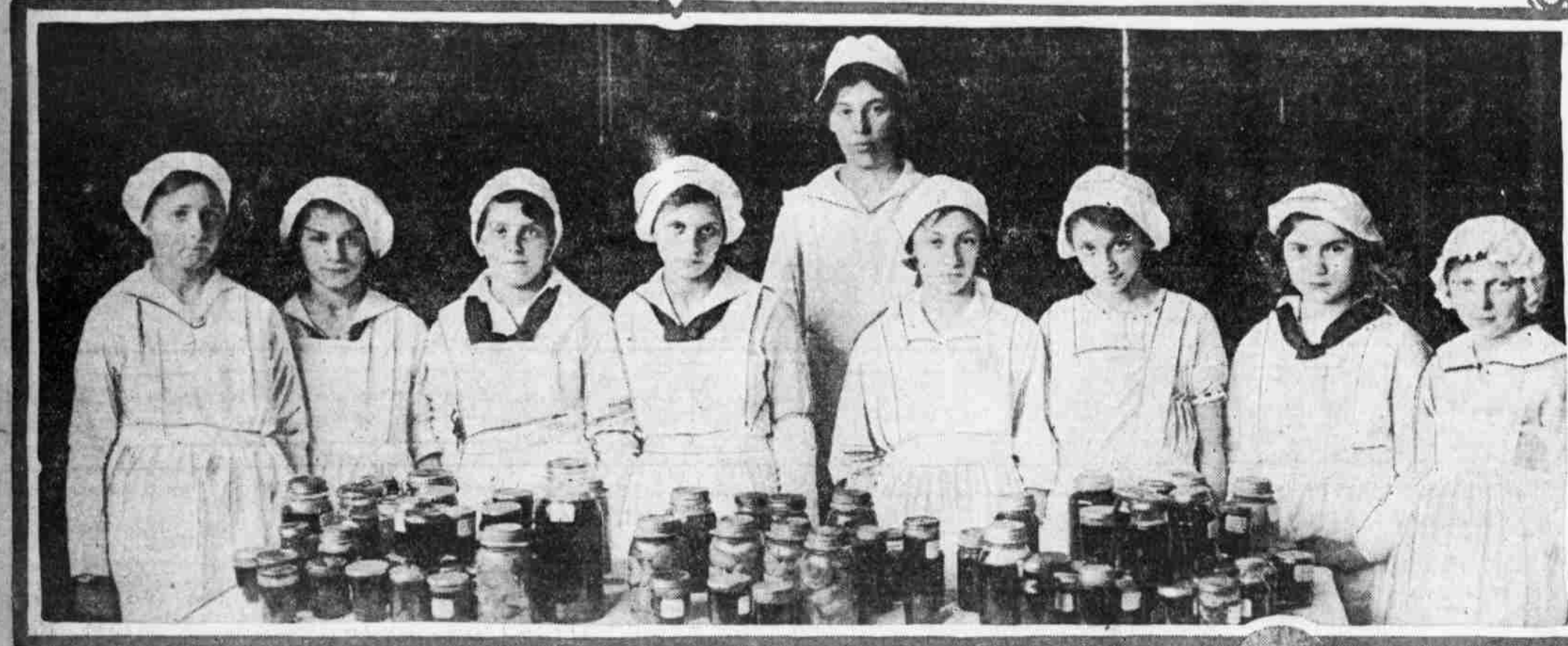
JUVENILE COOKING CLASS MAKES JELLIES FOR THE RED CROSS