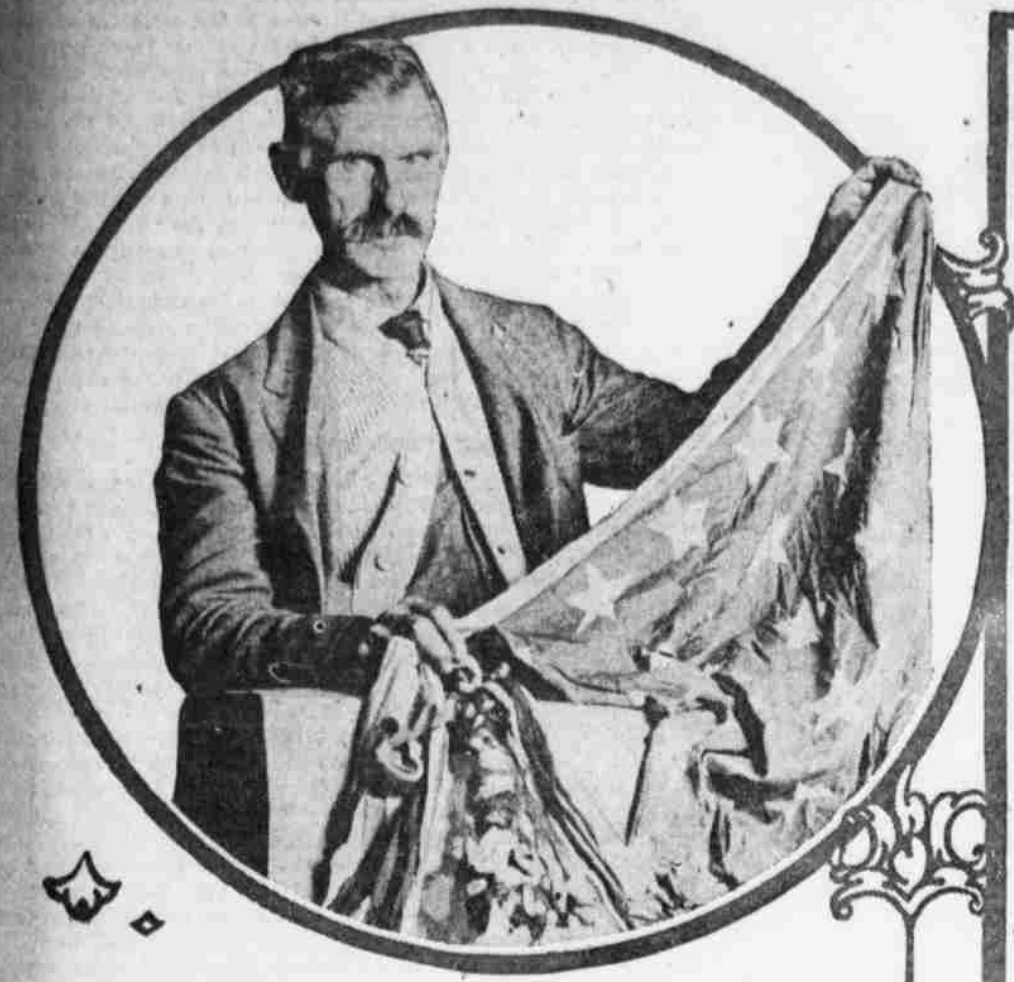
LIGHTNING AGAIN SPARES OLD GLORY

PHILADELPHIA NEWS PREDOMINATES IN A PICTORIAL REVIEW OF THE DAY'S HAPPENINGS