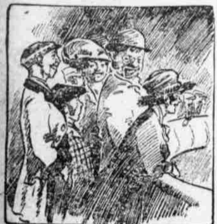
When to Laugh

—Pearson's Weekly. Big Man (turning around)—Can't you see anything? Little Man (pathetically)—Can't see a streak of the stage. Big Man (sarcastically)—Why, then, I'll tell you what to do. You keep your eye on me and laugh when I do.