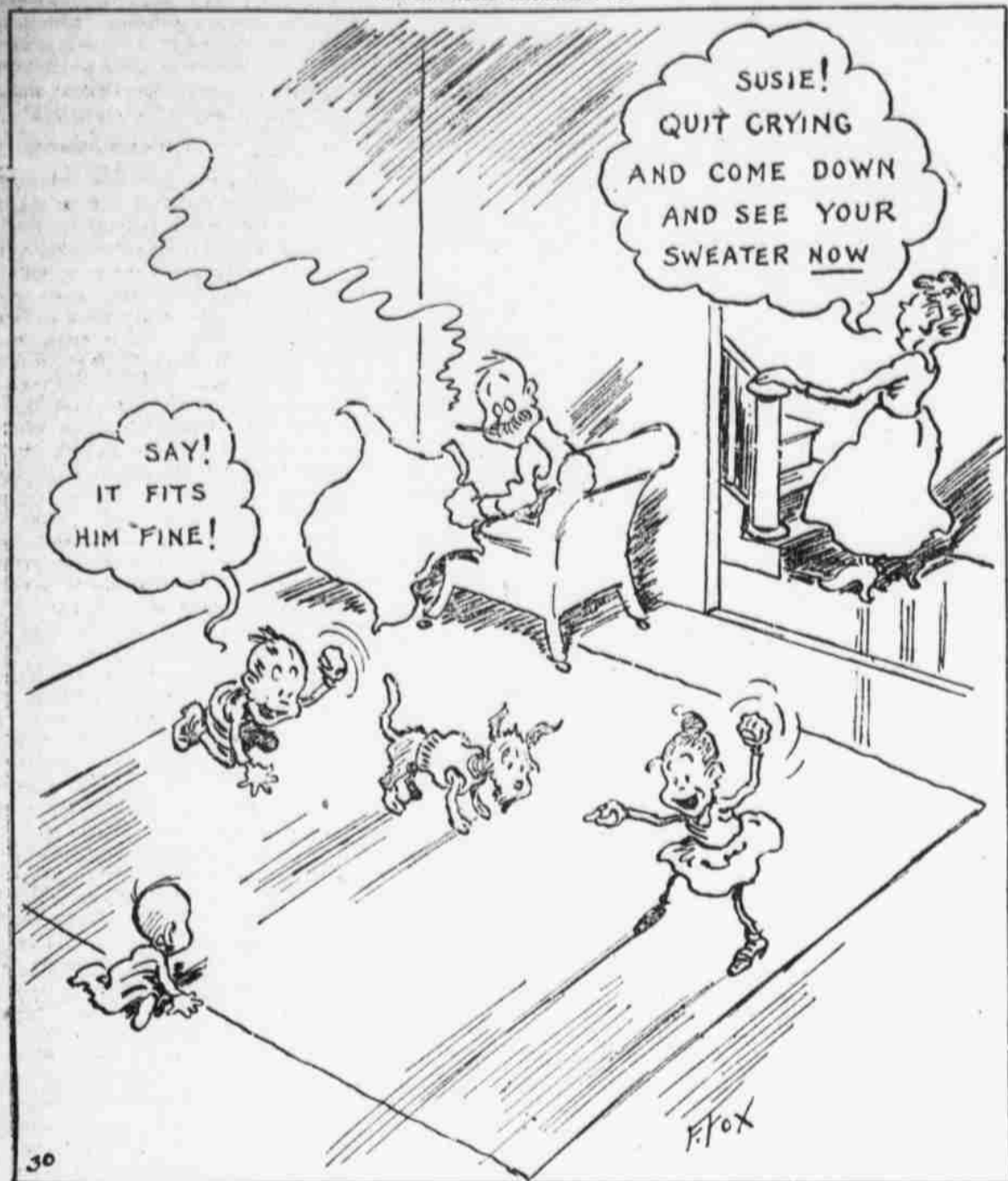
By FONTAINE FOX

THE SWEATER WHICH SISTER SUSIE KNIT FOR THE RED CROSS SHRANK ALMOST TO NOTHING WHEN SHE WASHED IT