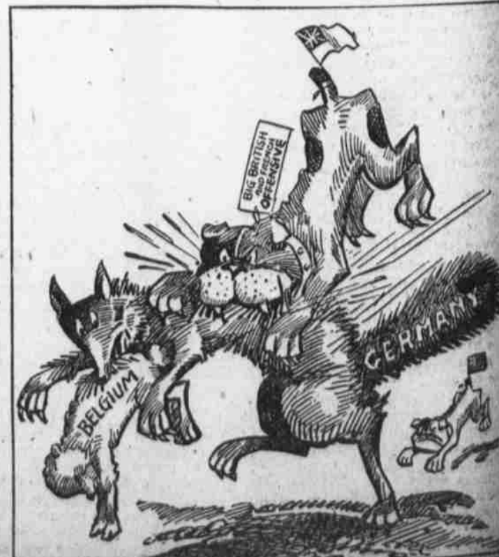
THE FOX CAN'T GET AWAY WITH IT