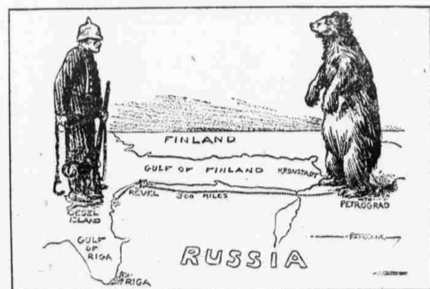
THE HUN HASN'T GOT THE BEAR YET—WILL HE GET HIM?