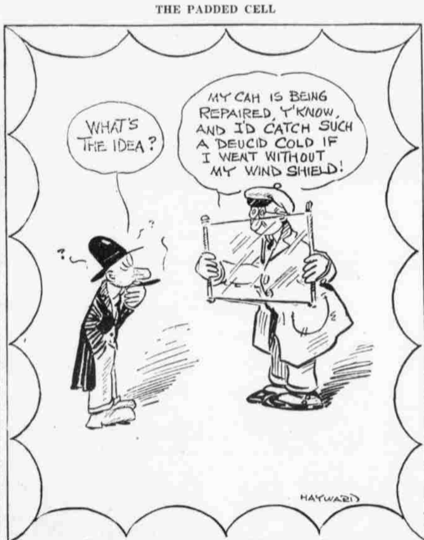
A Good Chance

—Pearson's Weekly. Big Man (turning around)—Can't you see anything? Little Man (pathetically)—Can't see a streak of the stage. Big Man (sarcastically)—Why, then, I'll tell you what to do. You keep your eye on me and laugh when I do.