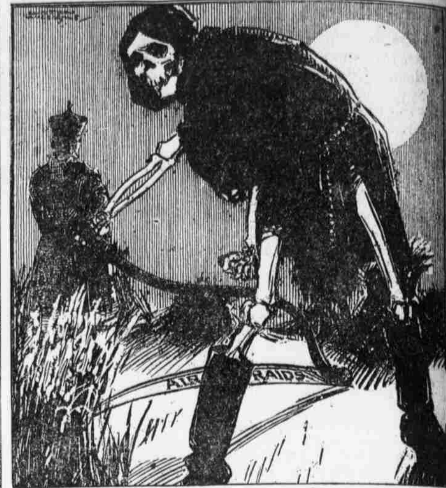
WE SHALL STOP THIS ONE DAY—IF THE WAR LASTS LONG ENOUGH