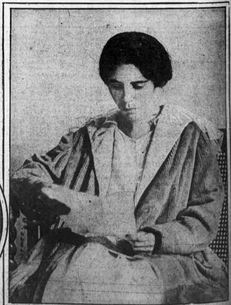
LAST PHOTOGRAPH OF MISS ALICE PAUL, LEADER OF THE SUFFRAGE PICKETS AT THE WHITE HOUSE, BEFORE SHE BEGAN HER SEVEN MONTHS' JAIL SENTENCE FOR DEFYING THE POLICE