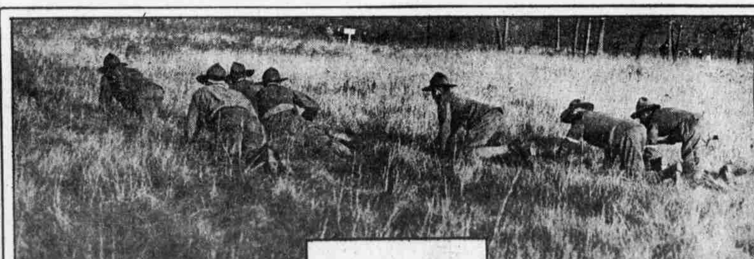
AN ATTACK DURING THE SUNDAY SHAM BATTLE BETWEEN THE ARDMORE AND BRYN MAWR HOME DEFENSE LEAGUES