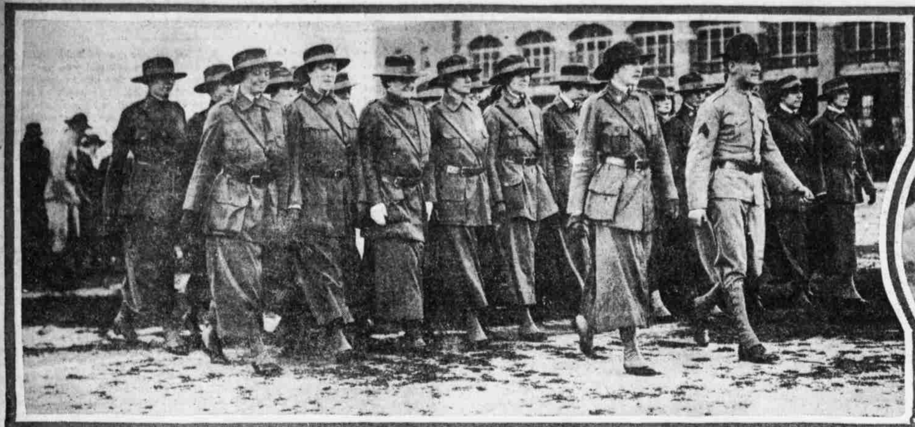
MILITARY SERVICE IN THIS WAR IS BY NO MEANS RESTRICTED TO MEMBERS OF THE STERNER SEX A detachment of the women's motor messenger corps undergoing instruction, a regular part of their duties, at the Philadelphia Navy Yard. A regular officer has been detailed to conduct these drills.