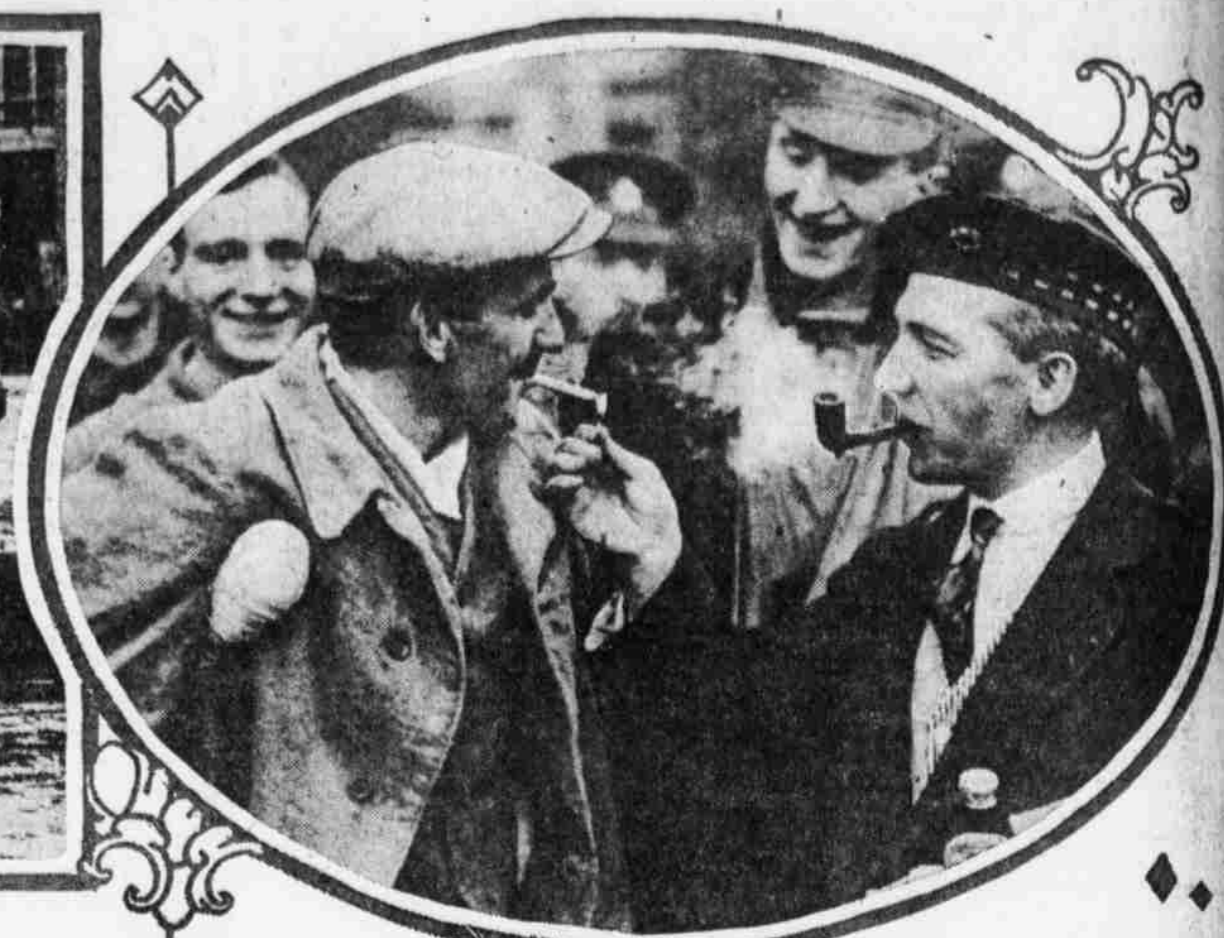
HARRY LAUDER RENDERS "FIRST AID" TO A WOUNDED BRITISH SOLDIER The Scottish comedian, who appears in Philadelphia next week in aid of the Tobacco Fund, is assisting a light force of British "Tommy's" in St. John's Hospital, Glasgow.