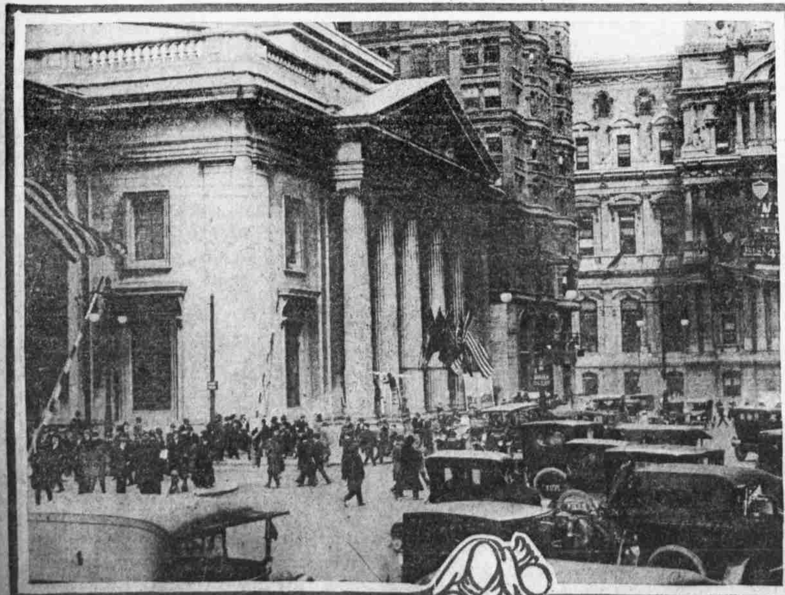
"SAFETY" GATES IN THE HEART OF PHILADELPHIA WARN LIBERTY LOAN SLACKERS The device erected yesterday and guarded by a corps of young society women is shown at the extreme left of the photograph. The gates, constructed and painted in imitation of the gates at railroad crossings, indicate to pedestrians that it is dangerous to pass without subscribing to the loan.