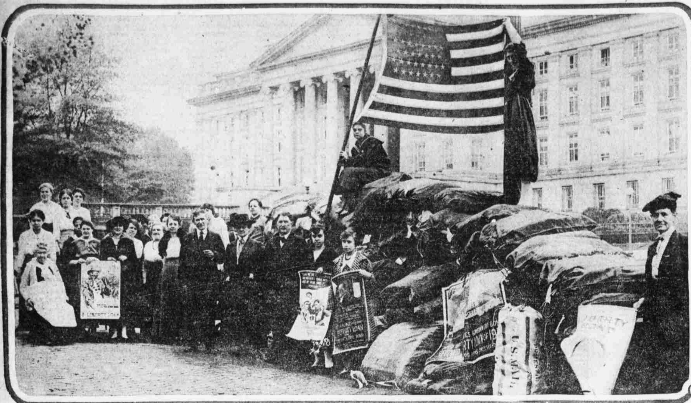
HERE'S A DAY'S LIBERTY LOAN MAIL AT THE TREASURY DEPARTMENT IN WASHINGTON Tens of thousands of letters received daily contain everything from subscriptions and inquiries about the loan to expressions of regret from persons unable to subscribe.