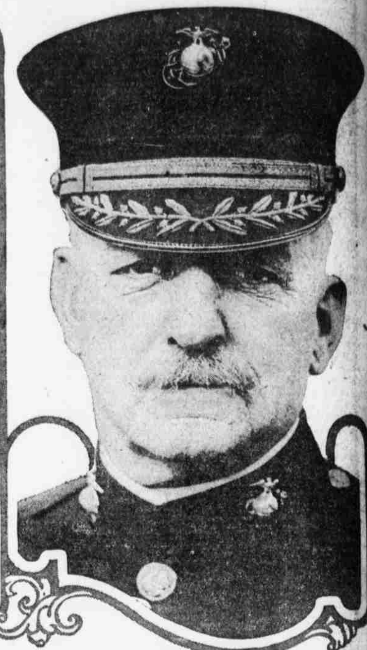
GENERAL L. T. W. WALLER, OF THE MARINE CORPS, WHO MADE THE PLANS FOR PHILADELPHIA'S CELEBRATION TODAY