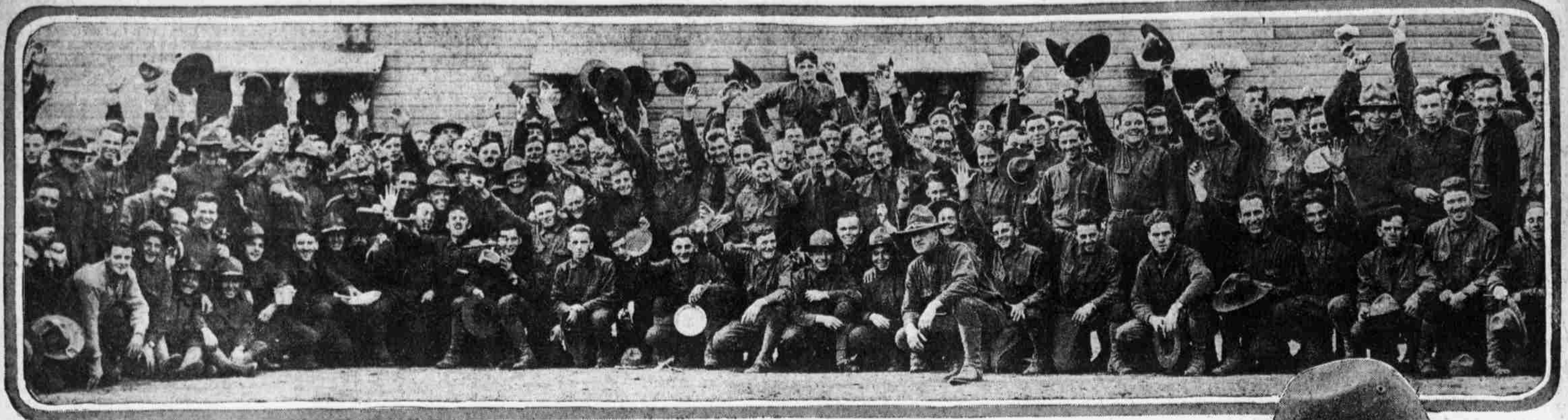
MEMBERS OF THE THIRTIETH TRAINING BATTALION, COMPOSED OF MEN FROM OVERBROOK, LOGAN AND OLNEY, LINE UP FOR THE EVENING LEDGER CAMERA MAN