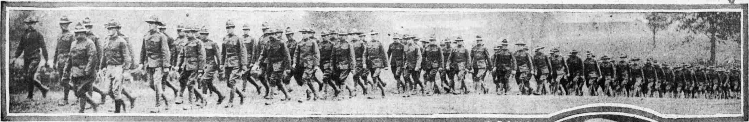
"WHAT IS LIFE WITHOUT A HIKE" IS THE SONG OF THE 314TH INFANTRY BOYS WHEN SETTING OUT ON THEIR DAILY TRAMP