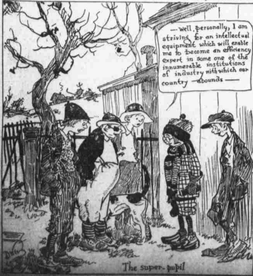
The super. pup!