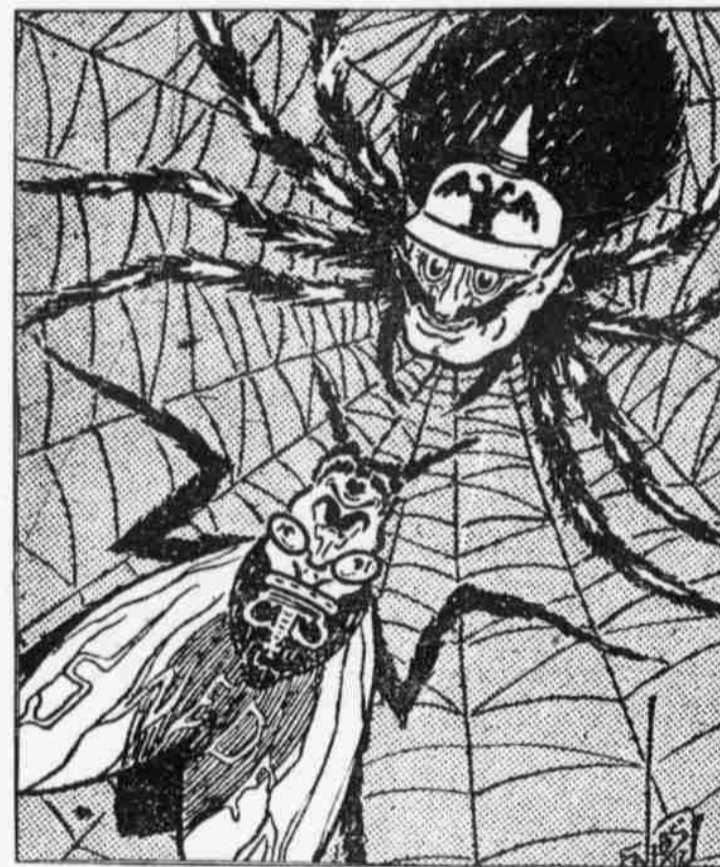
The Sketch, London THE GERMAN SPIDER AND THE SWEDISH FLY