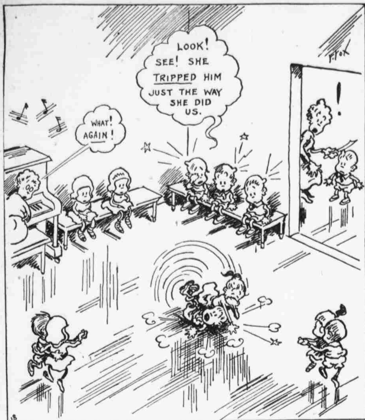
By FONTAINE FOX

TOMBOY TAYLOR HAD A FINE TIME AT DANCING SCHOOL LAST WEEK TRIPPING UP EVERY LITTLE BOY THE TEACHER MADE DANCE WITH HER