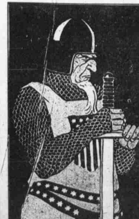
From De Notengrafer, Amsterdam, Holland Peace intermediary? What sort of thing is that?