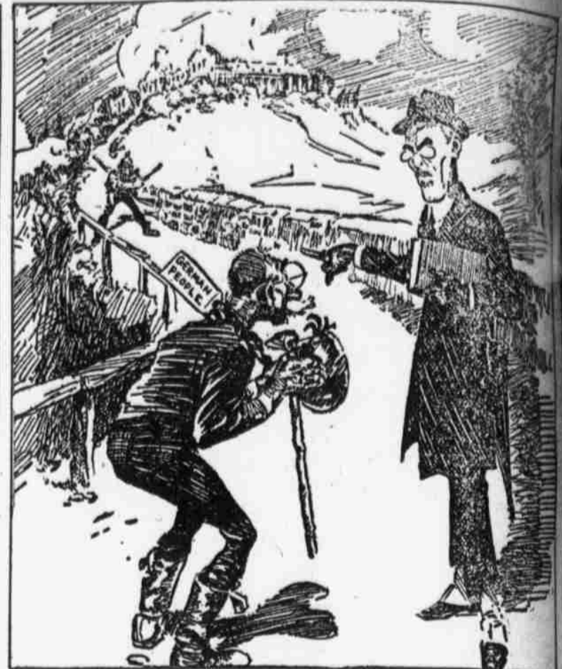
EASIER SAID THAN DONE The President—"If the armed man bars your way to Democracy, just throw him to one side."