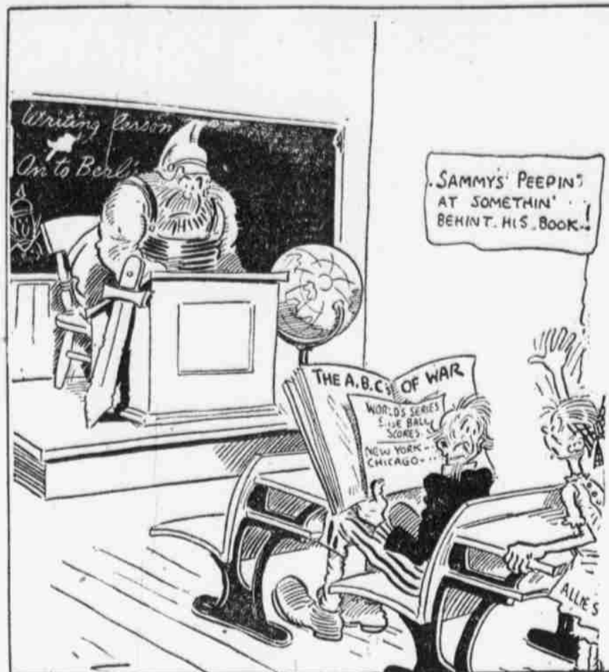
Hungerford, in Pittsburgh Sun IN WAR'S SCHOOLROOM