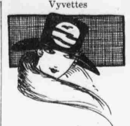
Midnight blue-a big golden harvest moon with clouds across it, and a bat winging its way-and there you have your autumn hat.

exactly eleven years, ever since the sou venirs had begun to accumulate obstructively, our friend had been trying to get up the courage to throw them away. Each consecteaning time she would lay them aside, fully determined to wreach herself free from the reign of dust and dusting. Then qualms of sentiment and fear that the things might "come in handy" would steal in and one by one the souvenirs would take their places at the old stands.