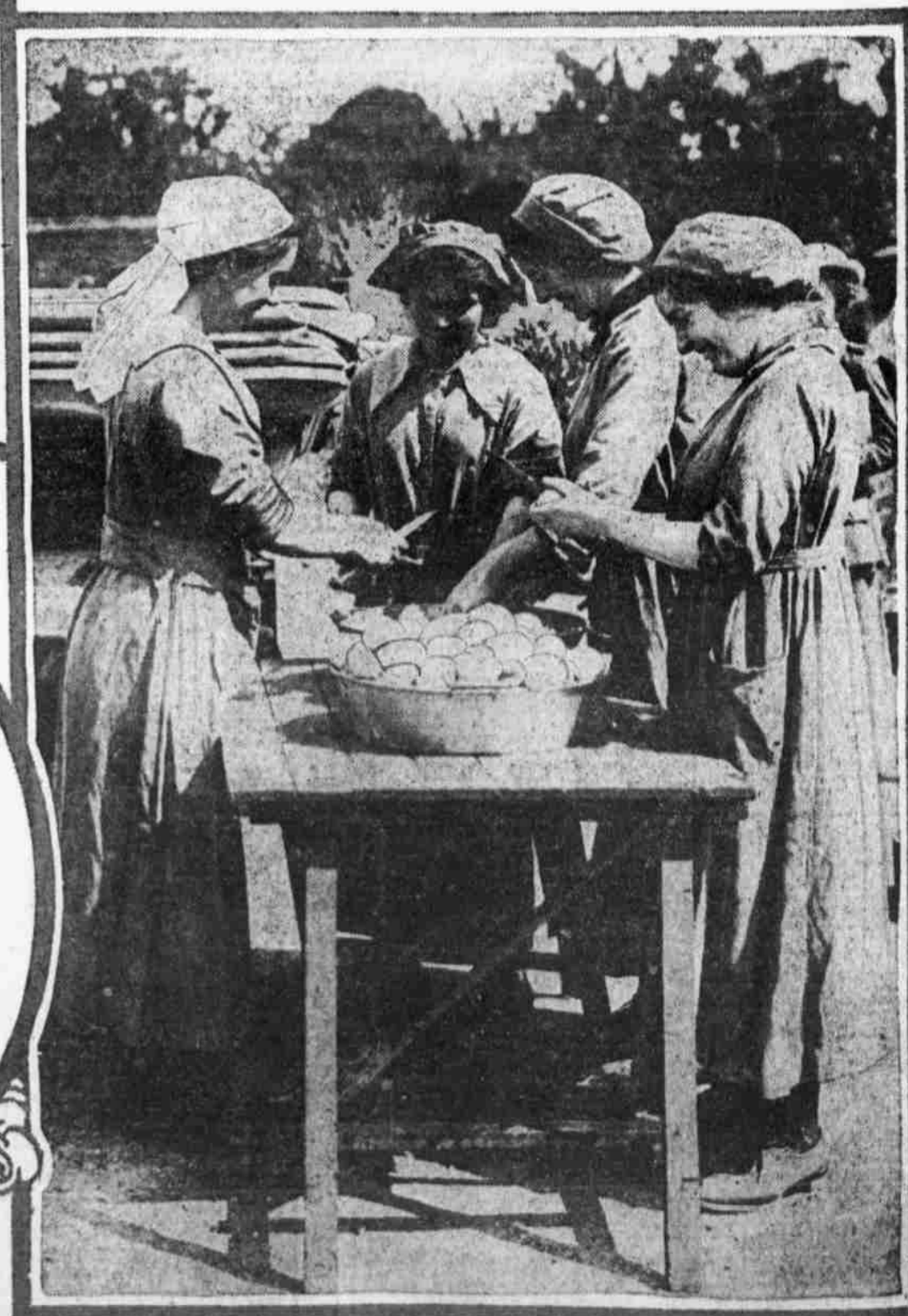
BRITISH WOMEN SERVE AS COOKS AT THE TRAINING CAMP OF THE TOMMIES IN FRANCE