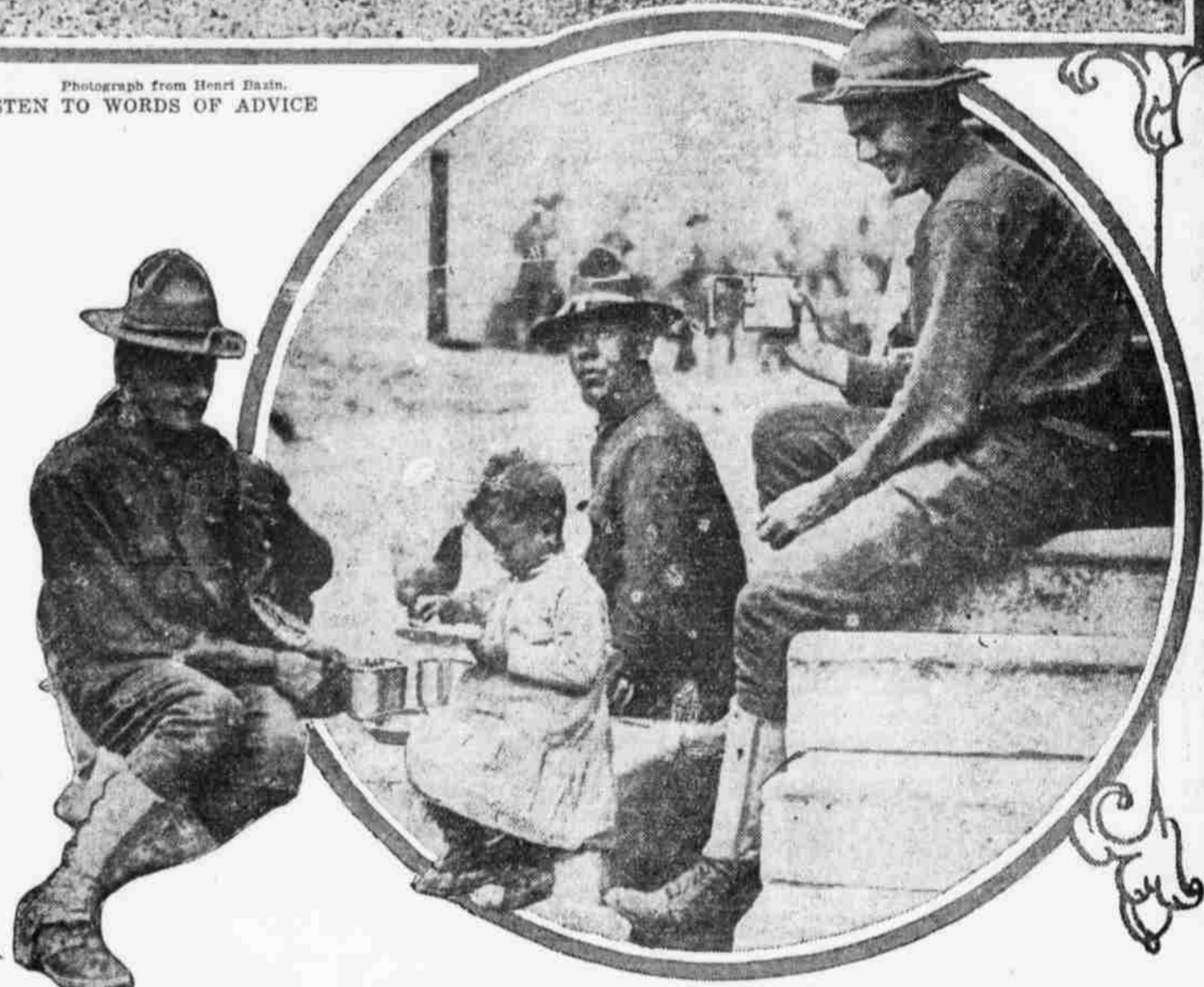
DESPITE THEIR OWN LIBERAL APPETITES, THE SAMMEES FIND SOMETHING TO SPARE FOR A TINY FRENCH URCHIN