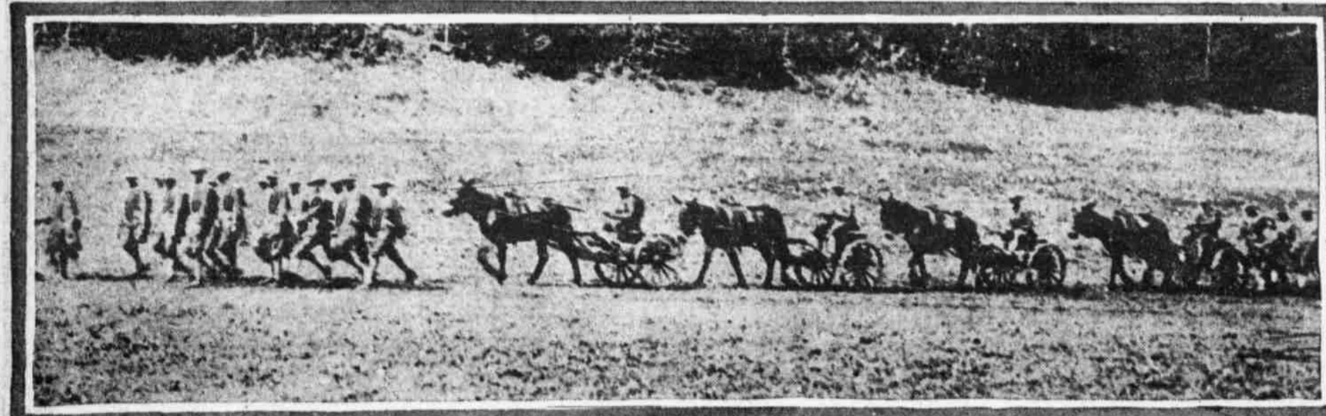
AMERICAN MACHINE-GUN COMPANY ON A PRACTICE MARCH ACROSS THEIR TRAINING FIELD OVERSEAS