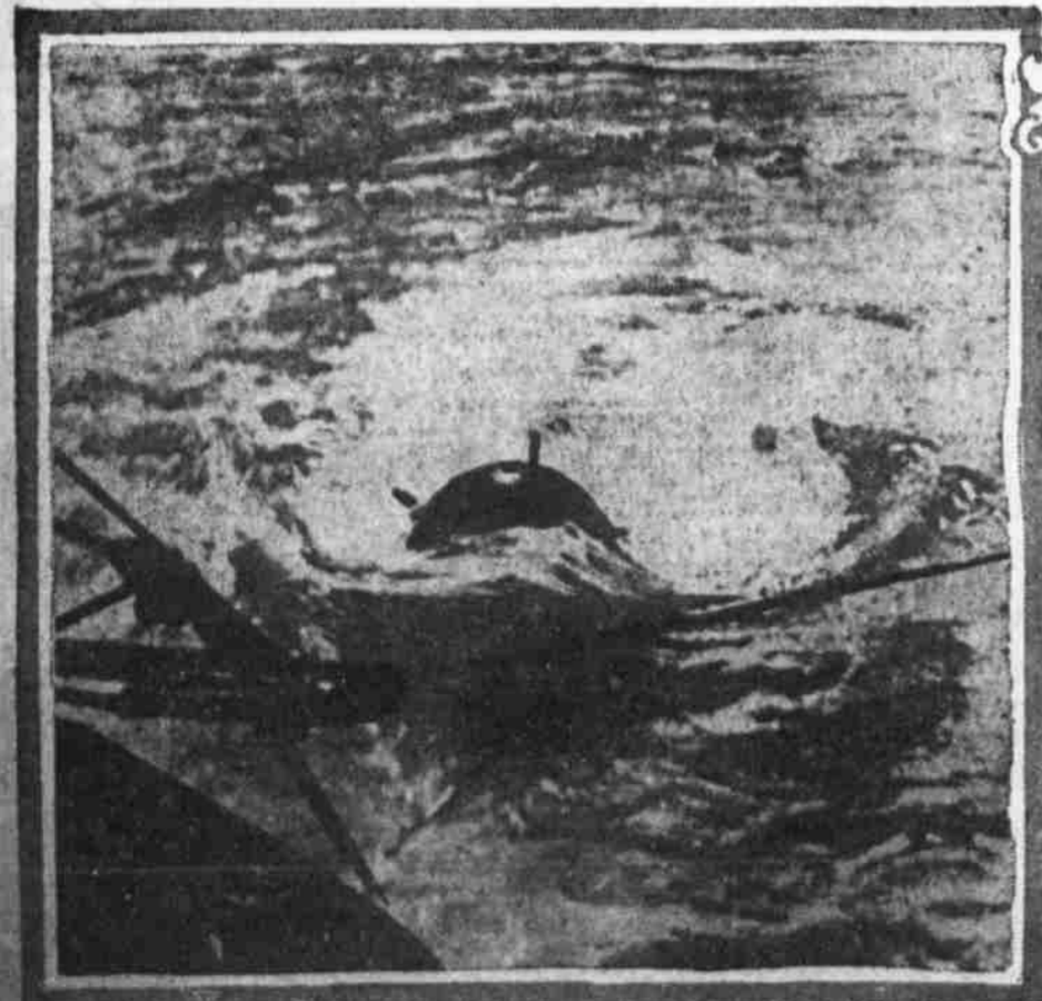
BRITISH MINE SWEEPER NETS SUBMARINE MINE SOWN BY THE GERMANS