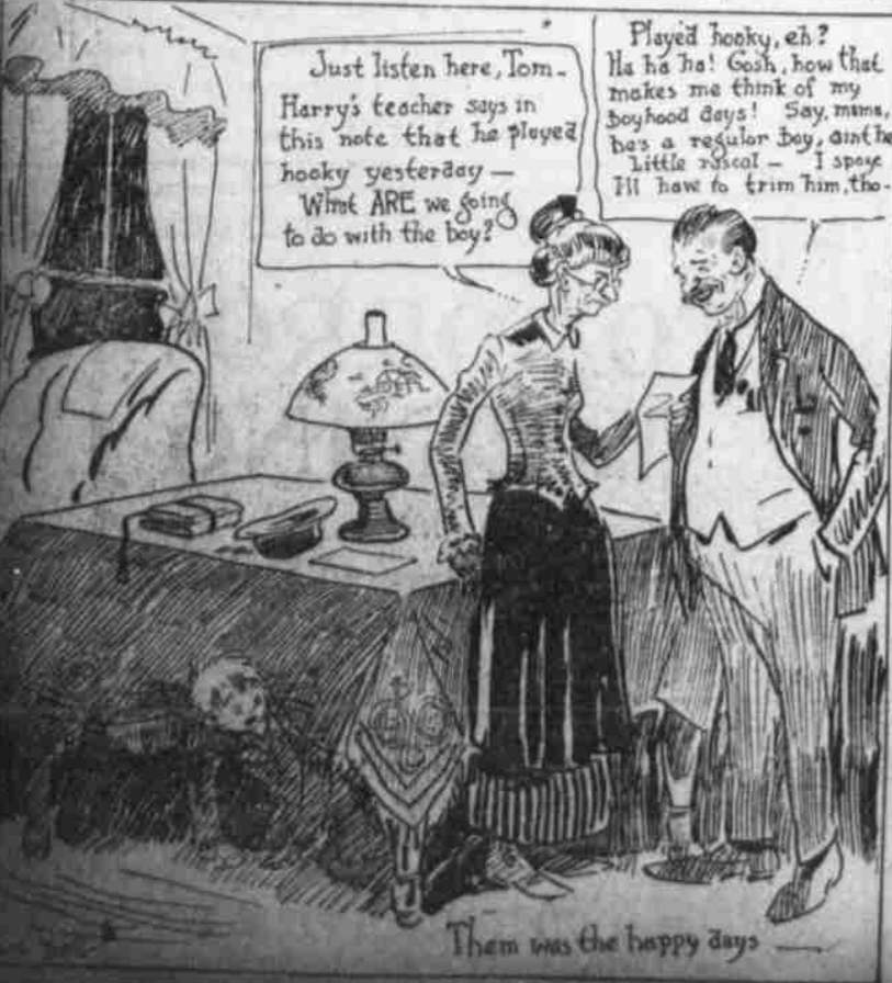
That was the happy days