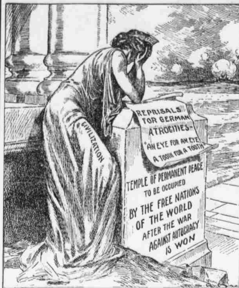
MUST SUCH THINGS BE?

The telephone bell rang with anxious persistency. The doctor answered the call. "Yes!" he said. "Oh, doctor," said a worried voice, "something seems to have happened to my wife. Her mouth seems set, and she can't say a word."