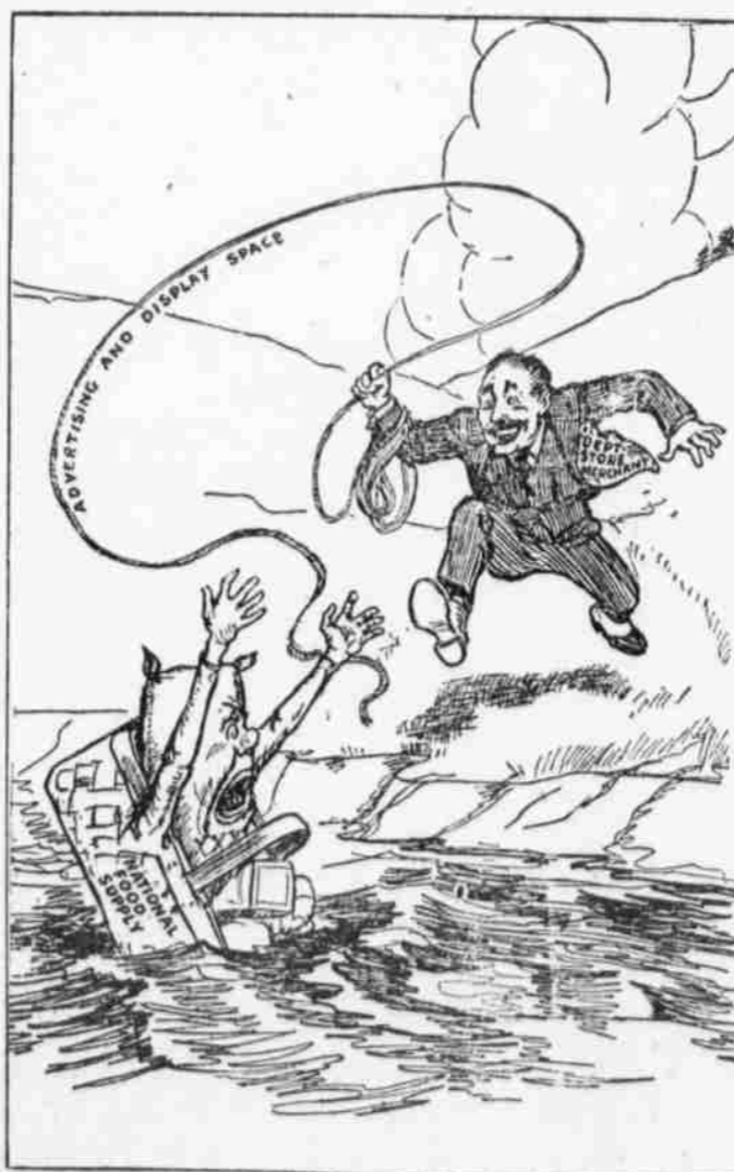
TO THE RESCUE