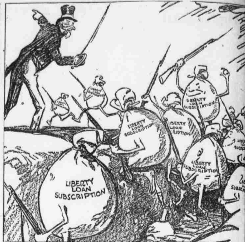
OVER THE TOP