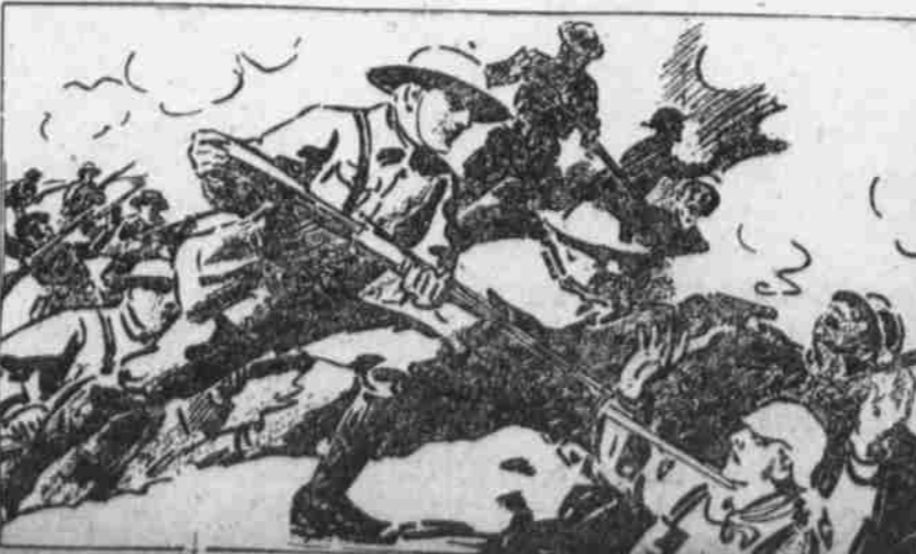
U. S. HARD CASH AND COLD STEEL