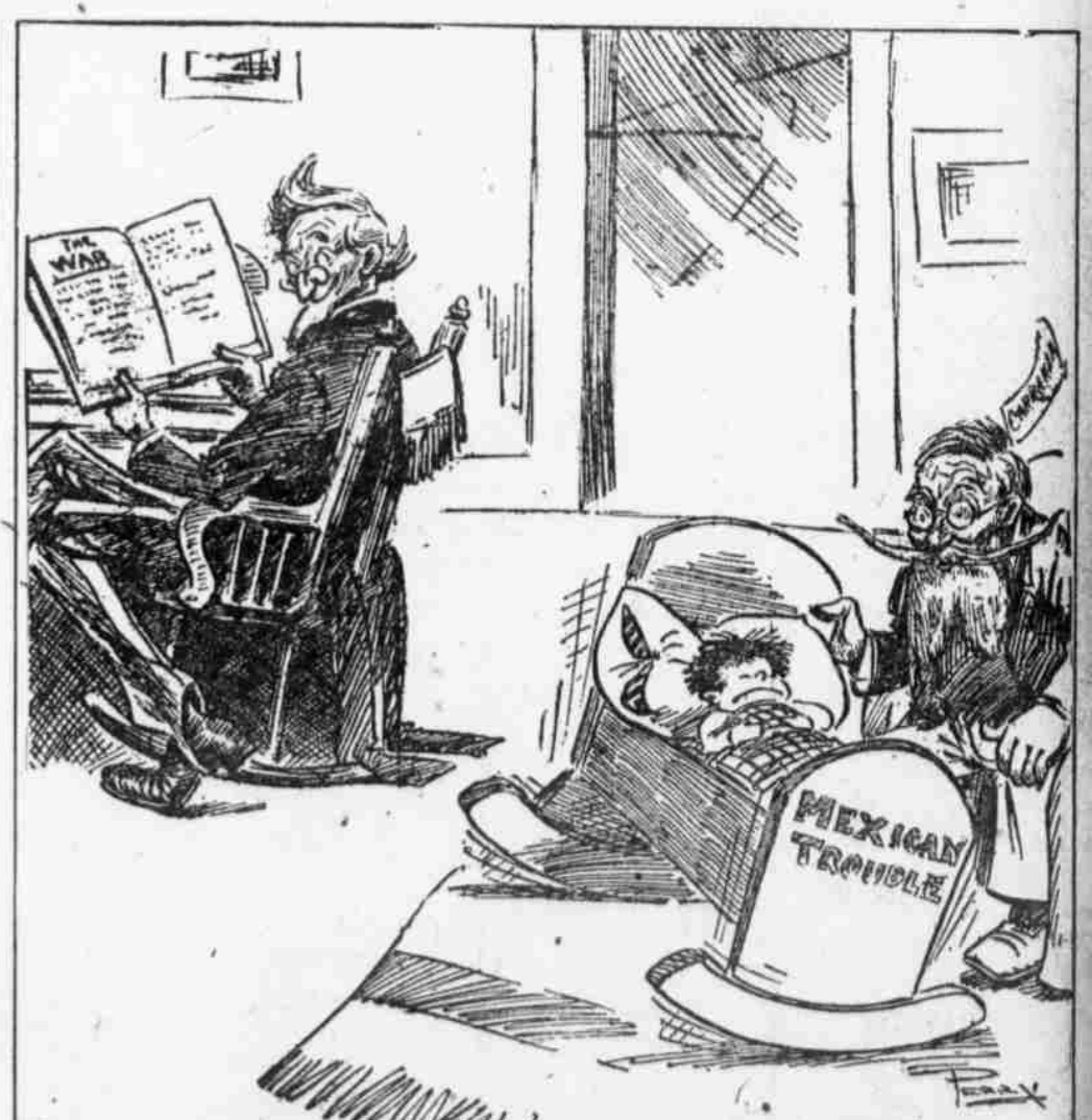
IT SEEMS TOO GOOD TO BE TRUE