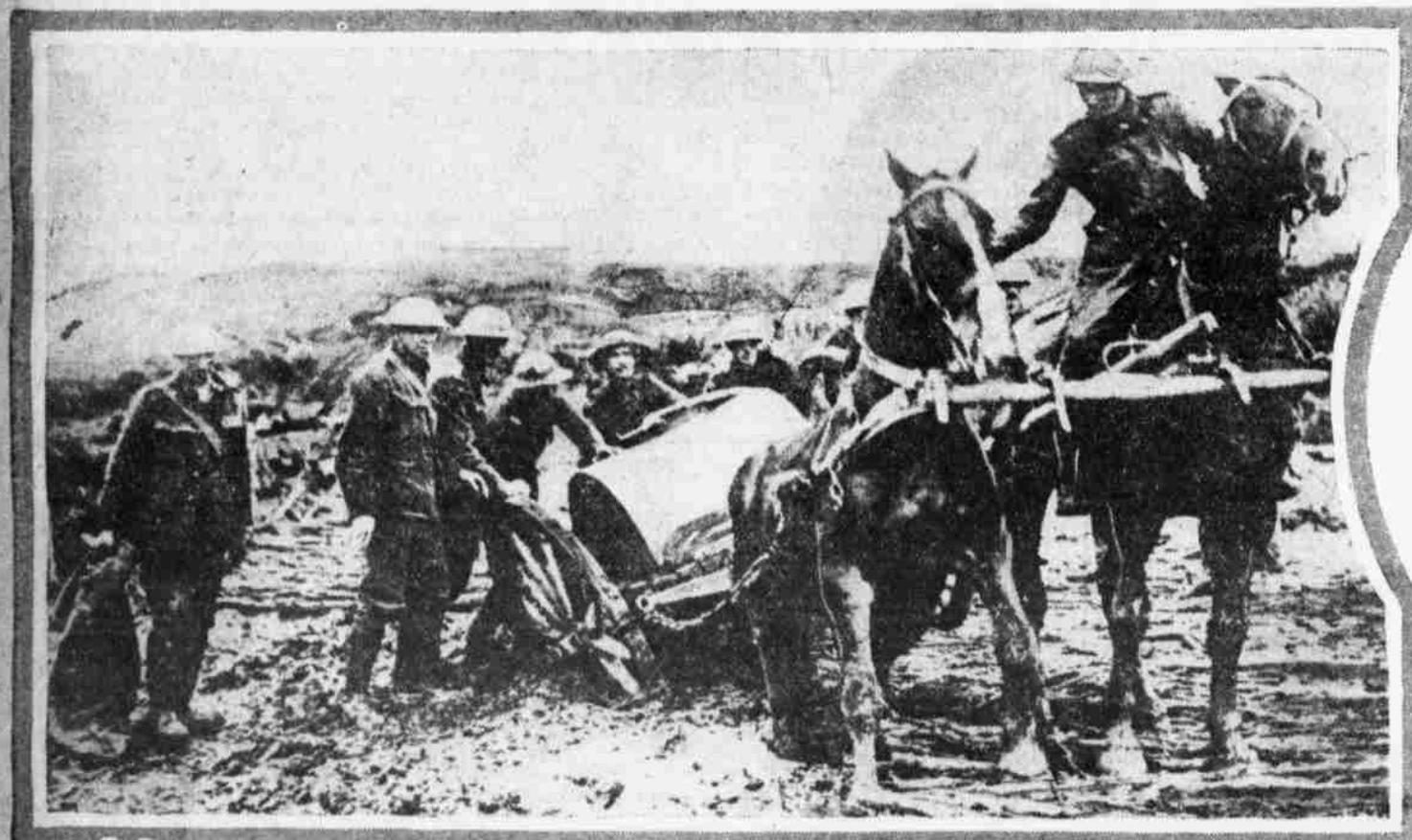
RAIN OR SHINE THE ALLIES' ADVANCE CONTINUES

An unbroken chain of armed craft, technically called "the drift fleet," maintains its vigil day and night, in all kinds of weather, lest an enemy commerce destroyer slip by and go about its ruthless work of destruction.