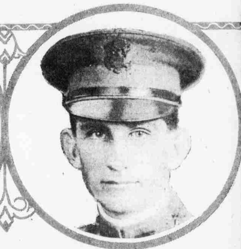
THEY HAVE CREATED A NEW STYLE IN WEDDINGS