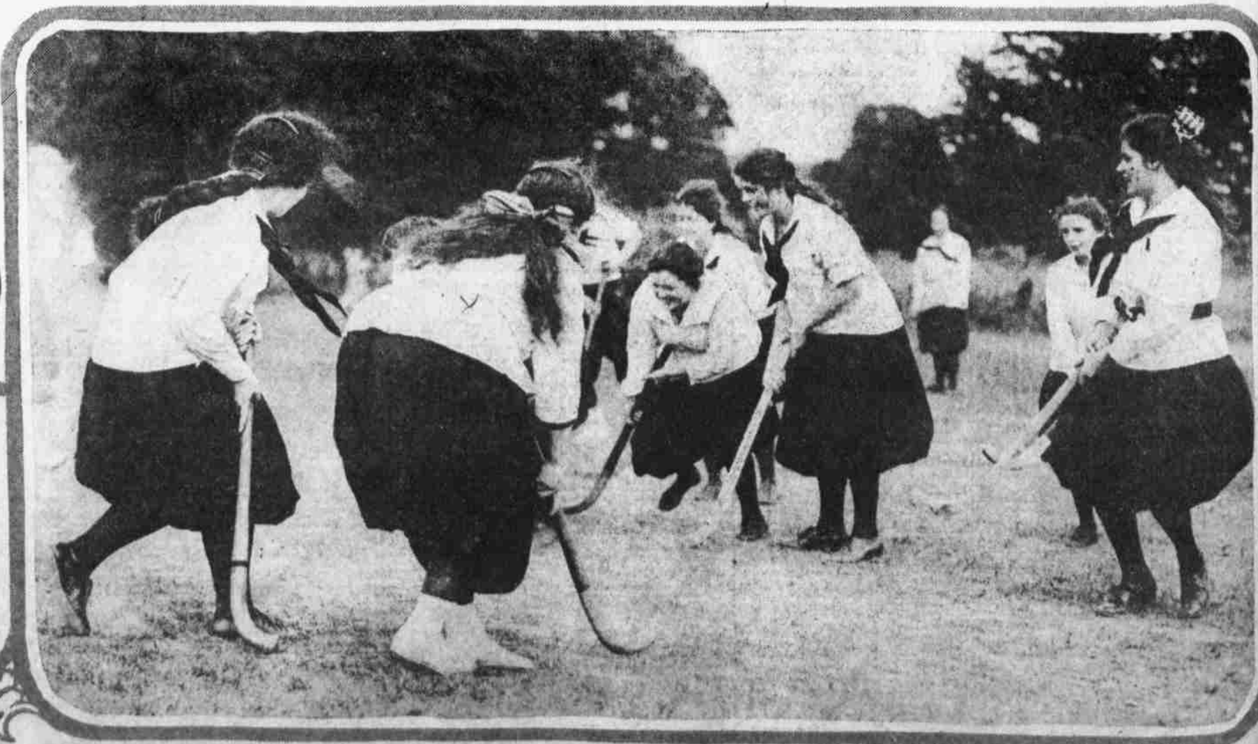
ATHLETICS NOT CONFINED TO THE BOYS AT SWARTHMORE HIGH