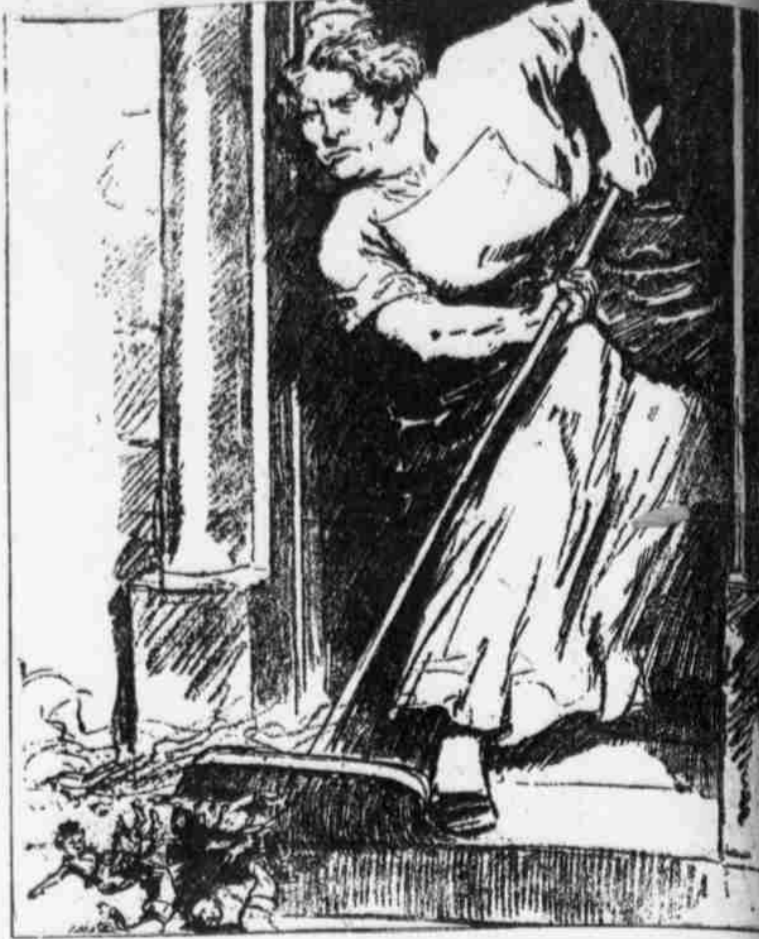
HER HOUSE IN ORDER Mmc. Europa: "These small creatures have disturbed my peace too long."