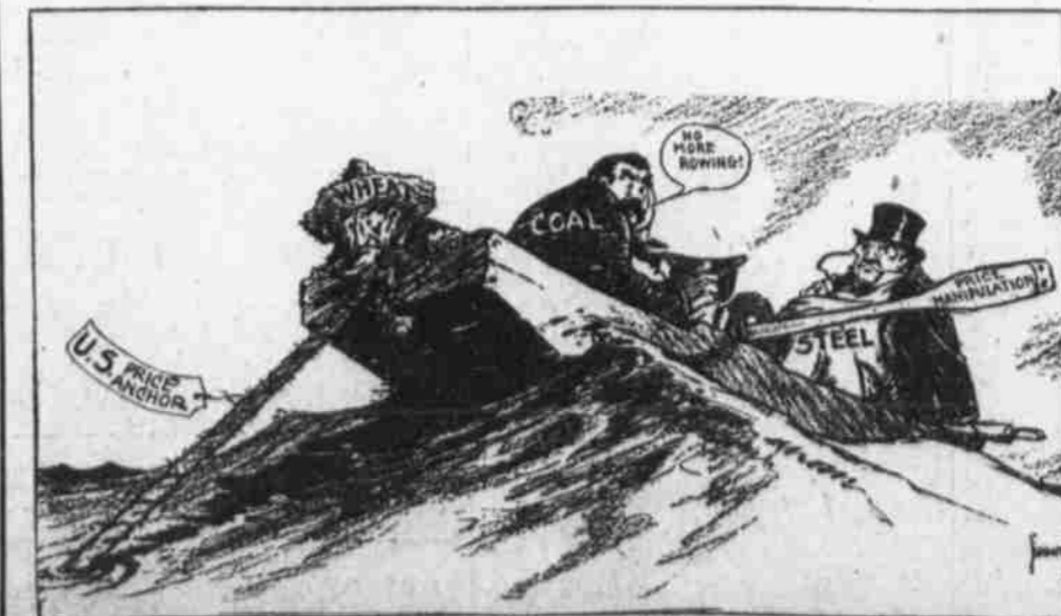
ALL IN THE SAME BOAT