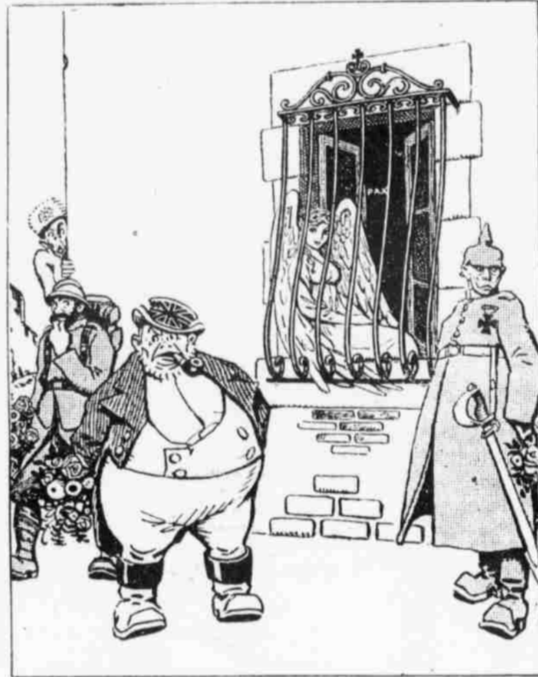
BARRING THE WAY Great Britain and Germany guarding Miss Peace from their Allies, who would fain woo her.