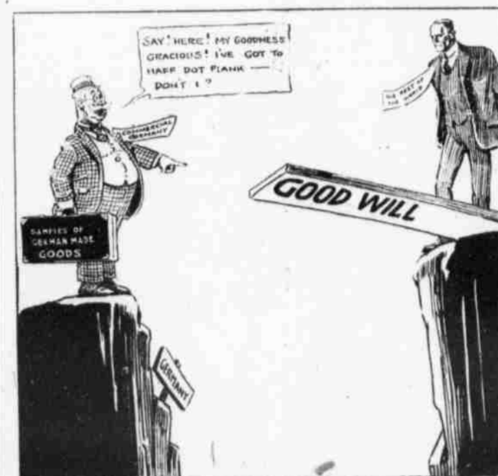
HIS REAL TROUBLE STARTS AFTER THE WAR