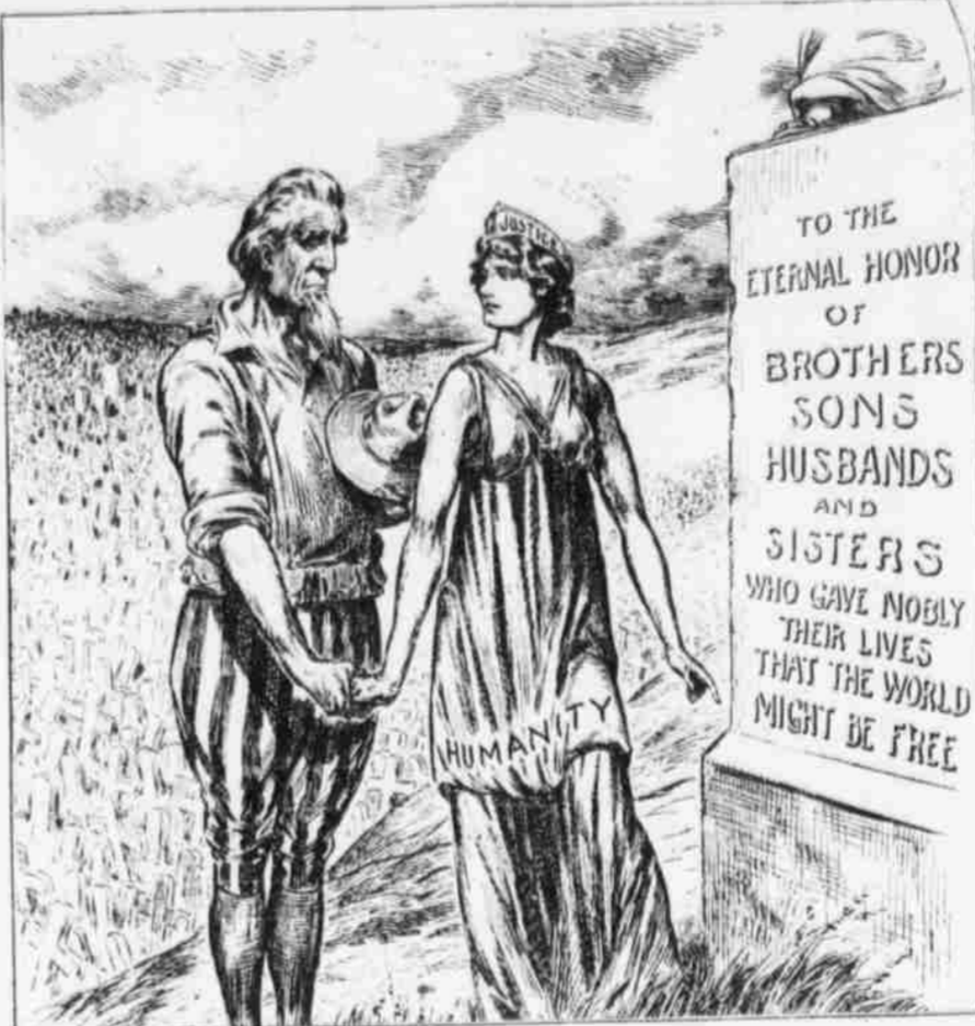
WE'LL KEEP THE FAITH WITH THE DEAD