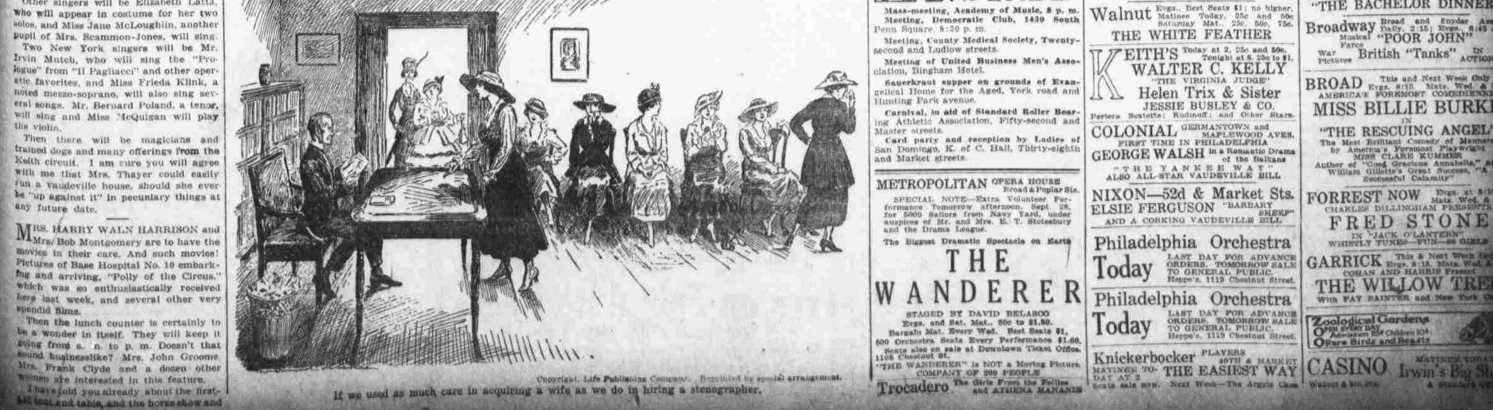
If we used as much care in acquiring a wife as we do in hiring a stenographer.