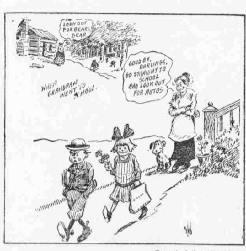
THEN AND NOW