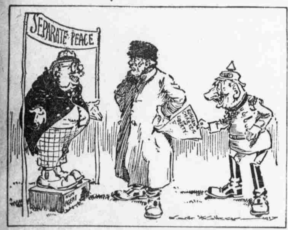
From the Daily Graphic (English). BEWARE OF PICKPOCKETS