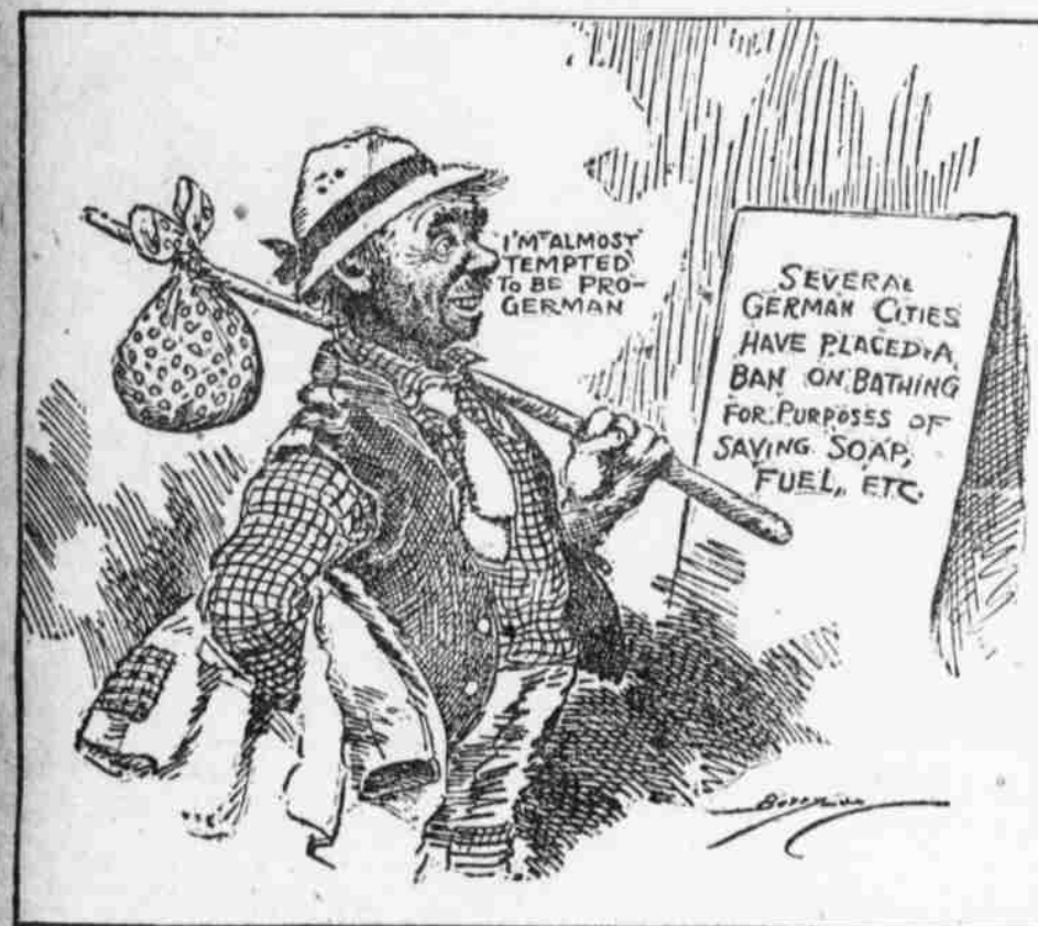
SOMETHING TO BE AVOIDED