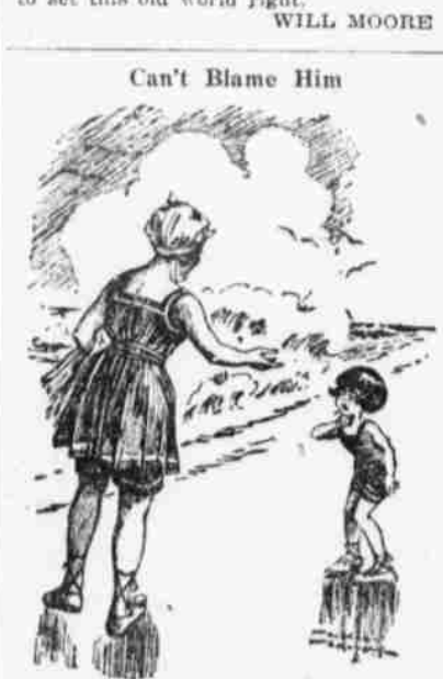
"Come, Cecil, a little English boy should love the sea." "But I don't want to bathe in the German Ocean!"

I like to see the picture play where everything comes out O. K., where villains always meet their fate and true love always wins a mase. They part the miser from his host d and Cinderella weds a lord. A bridge is blown up into bits; the pie that's thrown always hits; the fireman always saves the child; the sheriff's posse, swift and wild, arrives and saves the hero's life just as the savage draws his knife; the injured man regains his health; the business venture leads to wealth; the angire always catches fish; the angry housewife throws a dish and lands it on the mark she chose, instead of some one clae's nose. They find the uncle's long-lost will; some angel pays the poor folks' bill. O. when I'm tired, sick and sore I like to look the movies o'er, for ten cents worth of film at night just seems to set this old world right. WILL MOORE