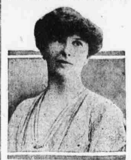
ALICE DUER MILLER