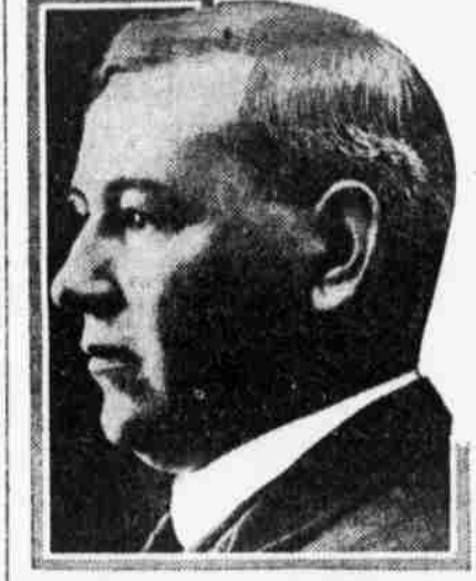
HERBERT ADAMS GIBBONS