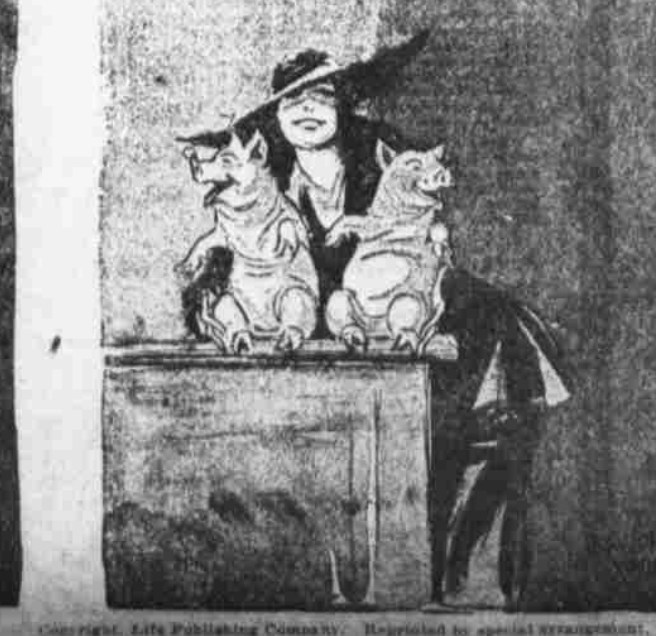
Repristed by appendix NYP WHAT WE MAY EXPECT NOW