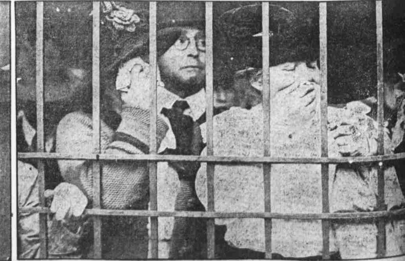
TWENTY-FOURTH AND CHESTNUT STREETS, AS RELATIVES OF DRAFTED MEN BID ADIEU TO INITIAL CONTINGENT BOUND FOR TRAINING QUARTERS. TEARFUL SCENES ATTEND LEAVE-TAKING IN TRAINSHED OF BALTIMOR E AND OHIO STATION.