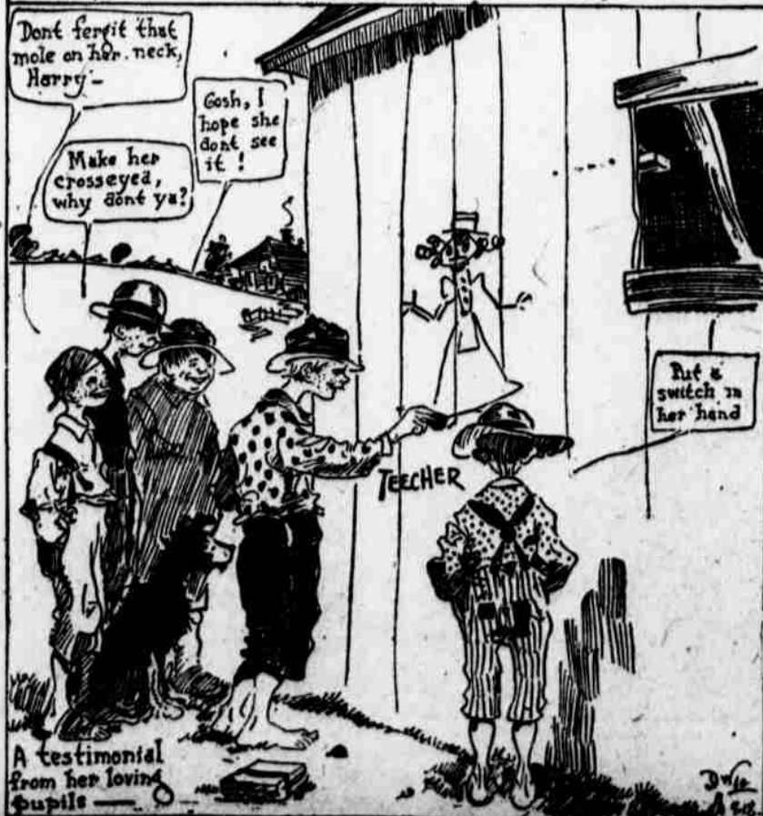
A testimonial from her loving pupils

Not a Doubt Assistant (to old lady who has handed in a badly spelled telegram)—What's this word, please? Old Lady—Never mind that, miss. It's none of your business. They'll know it at the other end.