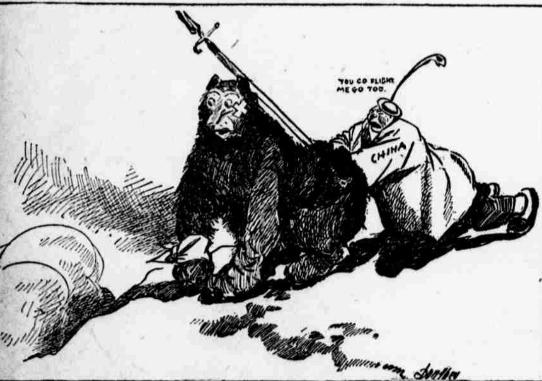
Donahy, in the Cleveland Plain Dealer. BACKING UP THE BEAR