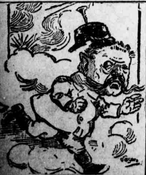
THE HINDENBURG LINE RUNS TO GERMANY