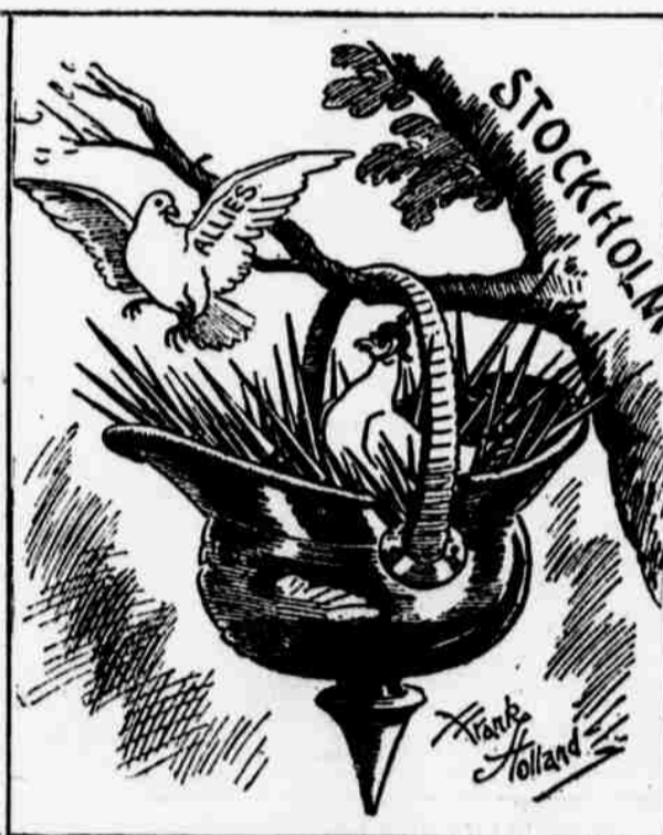
From Reynolds's Newspaper (English). THE DOVE DECIDES The Allies' Dove: "Coo, Coo!" The German Dove: "I don't like your nest, but I'll drop in and hear what you have to say."