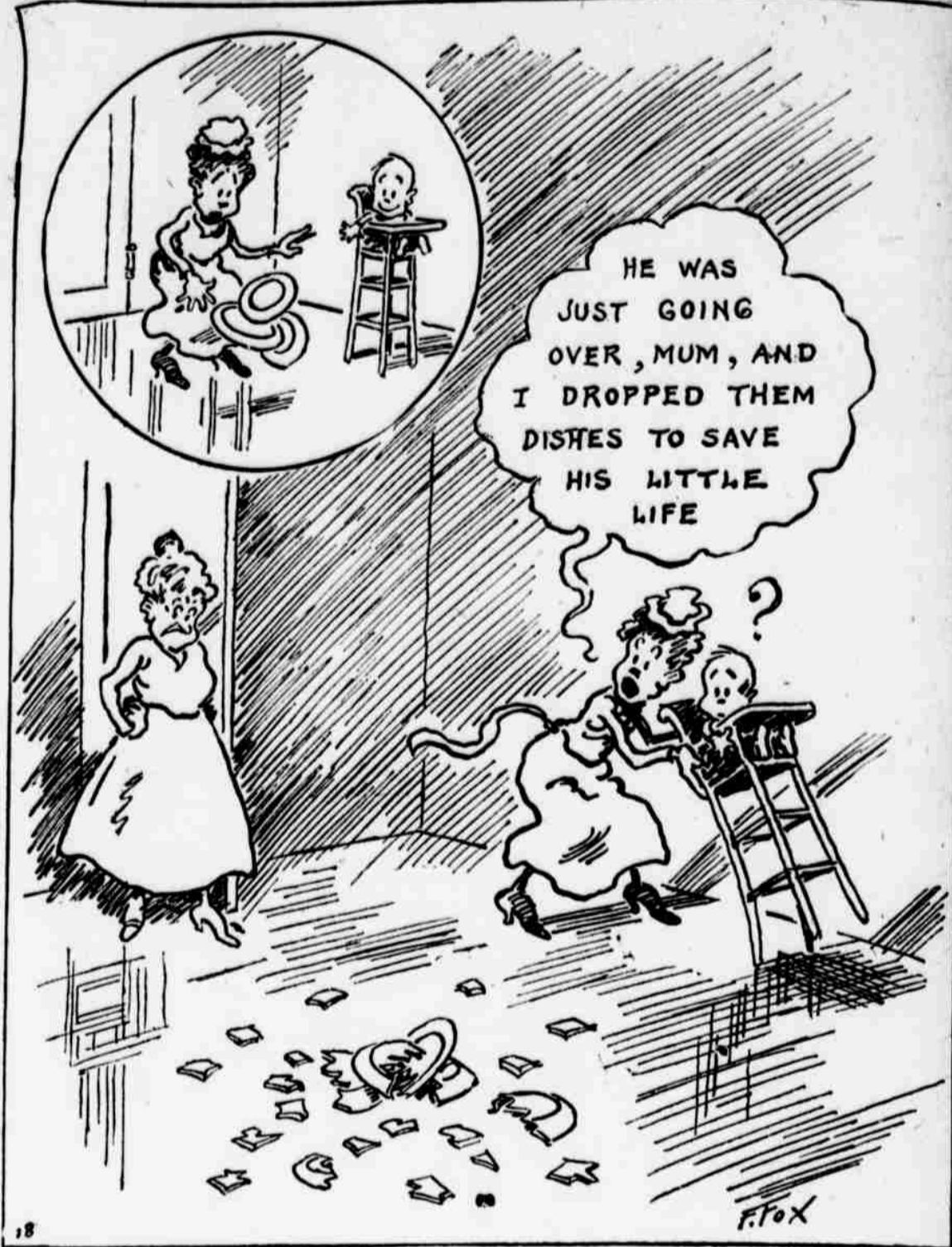
By PONTAINE FOX.