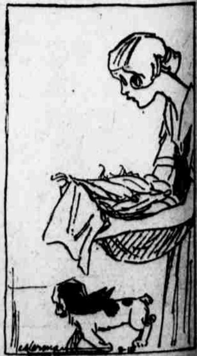
The young lady across the way says her garden overalls are severely padded without a particle of embroidery or padding on them.