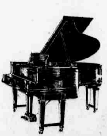
WEBER DUO-ART GRAND PIANO, $2150