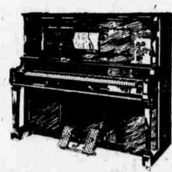
WEBER PIANOLA $1050