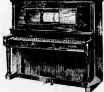
WEBER DUO-ART PIANO,