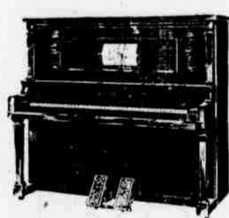
STROUD DUO-ART PIANO

Purchasable in Philadelphia Only at Heppe's-Sole Agents for the Famed Aeolian Products