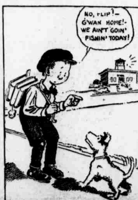
Thiele, in the Sioux City Tribune. SOMETHING A DOG CANNOT UNDERSTAND