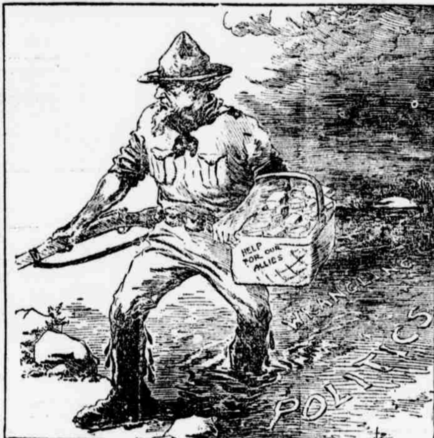
Coffman, in the New Orleans Item. COMING OUT OF THE SWAMP