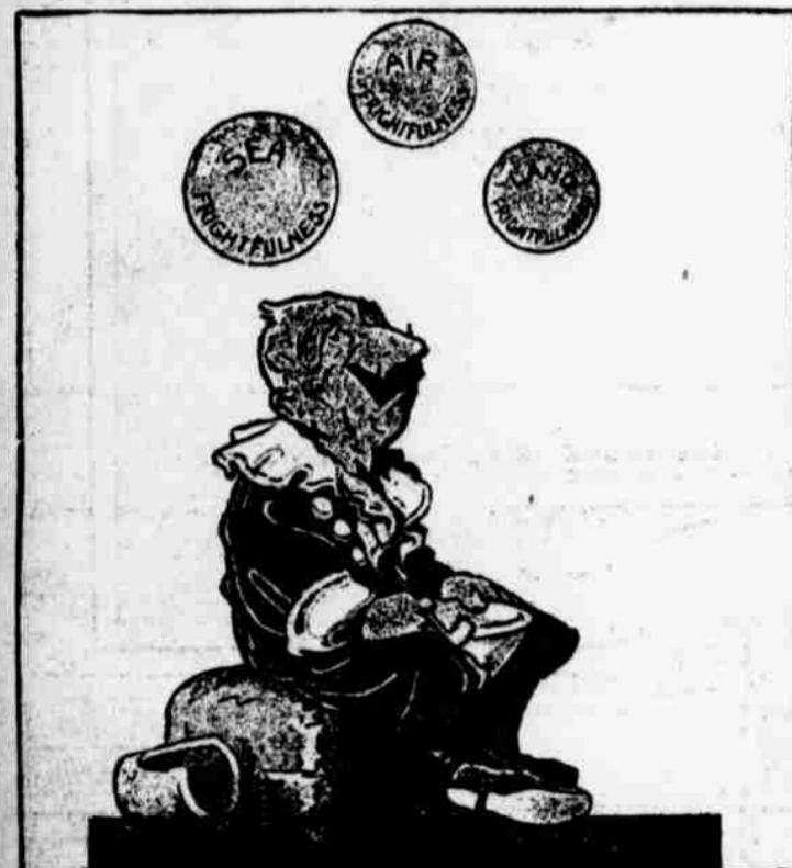
From London Opinion. MORE BUBBLES