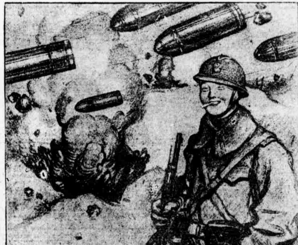
Official French war cartoon. THE BAPTISM OF FIRE