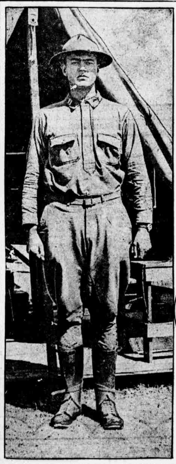
CAPTAIN HAMILTON FISH, JR., FIFTEENTH NEW YORK INFANTRY