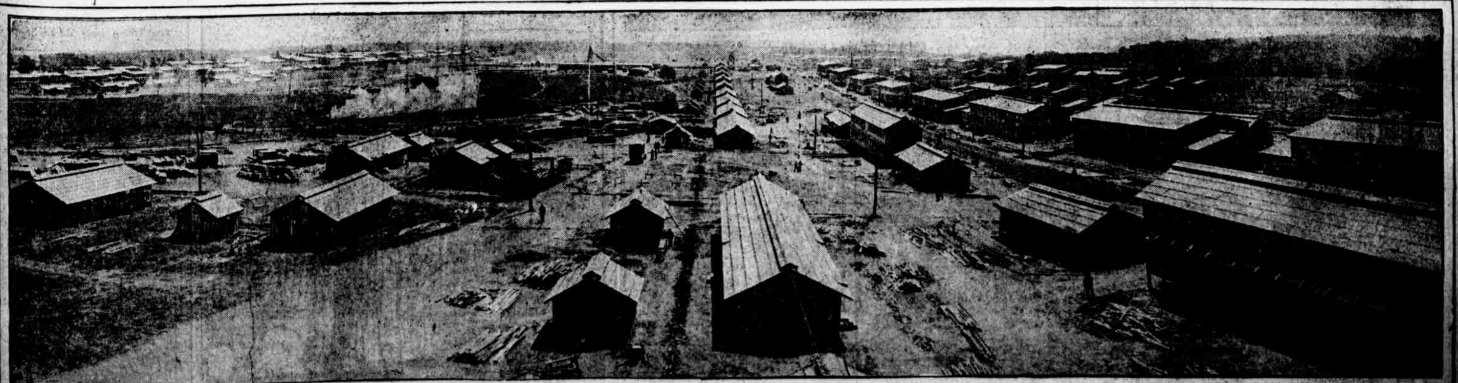
A FEW WEEKS HAVE SUFFICED TO TRANSFORM THE WASTE LAND ABOUT WRIGHTSTOWN INTO HABITATIONS AND DRILL GROUNDS FOR AN ENTIRE DIVISION OF UNCLE SAM'S DEFENDERS, WHO ARE INCREASING WITH AN EQUAL RAPIDITY