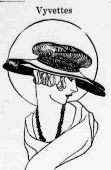
A big double-brimmed hat—brims of white felt, faced with crimson silk, top of crimson and white striped silk.

WOMAN correspondent has delved under the skin of the "job map" editor that appeared in these columns September 7 and asked a very basic question: "What benefit," she writes, "will the woman derive from taking the positions vacated by men who have gone away to war if employers use her sex as an excuse for paying her only a part of what the man was paid for the same work?"