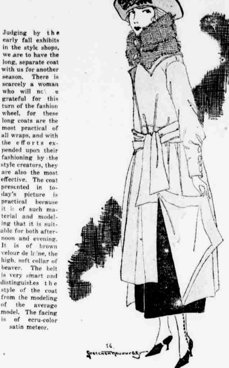
Judging by the early fall exhibits in the style shops, we are to have the long, separate coat with us for another season. There is scarcely a woman who will not be grateful for this turn of the fashion wheel, for these long coats are the most practical of all wraps, and with the efforts expended upon their fashioning by the style creators, they are also the most effective. The coat presented in today's picture is practical because it is of such material and modeling that it is suitable for both afternoon and evening. It is of brown velour de laine, the high, soft collar of beaver. The belt is very smart and distinguishes the style of the coat from the modeling of the average model. The facing is of ecru-color satin metero.