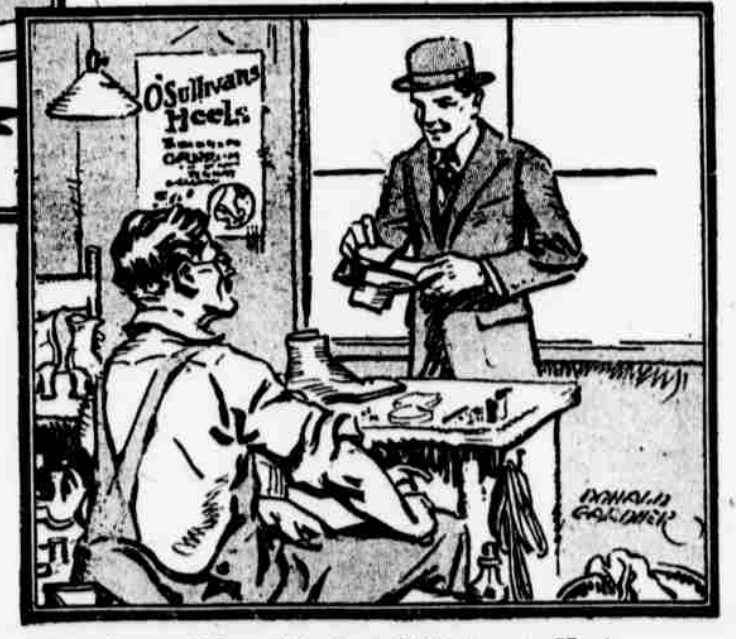
Any cobbler will attach O'Sullivan's Heels to your shoes. Have a pair put on today. Notice your increased energy.

One way you waste energy is in walking. You wear leather heels. They are not suited for modern conditions. You bring them down with a bang on the hard city streets and floors. You do this 8,000 times a day at least-for the average