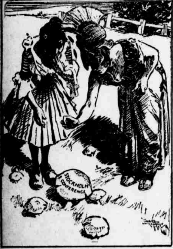
From London Opinion. BRITANNIA AND FRANCE: "IS IT A MUSHROOM OR A TOADSTOOL?"