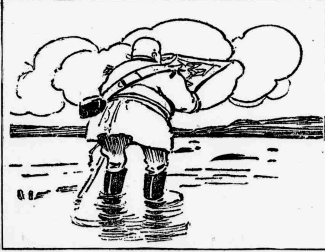
ON THE AISNE Hindenburg: "Frankly, I could find my way better in the Russian marshes."