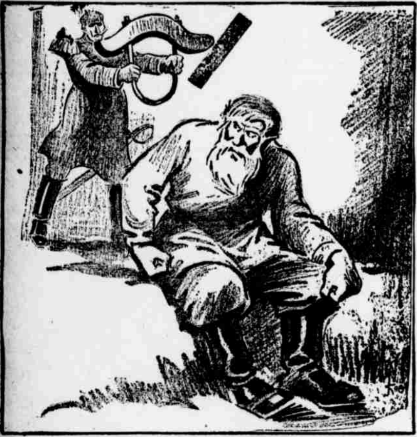
"IS IT FOR THIS I THREW OFF THE ROMANOFF YOKE?"