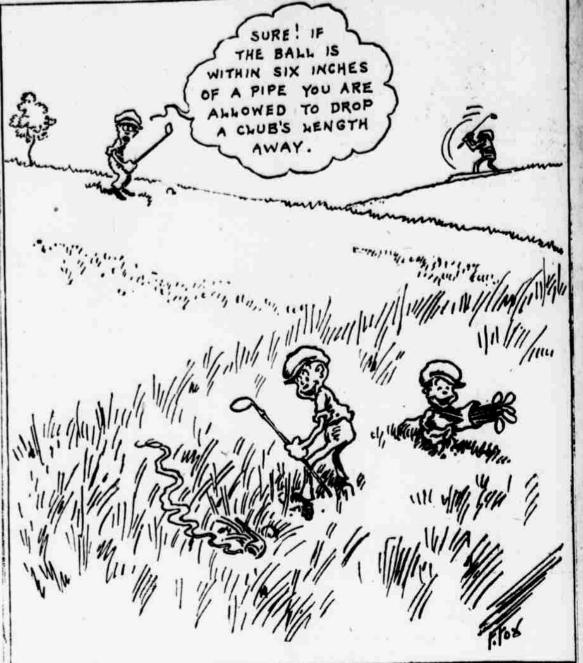
By FONTAINE FOX (Copyright)