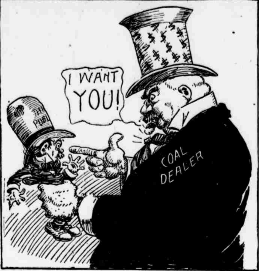
From Indianapolis News. CONSCRIPTED (This also applies to Philadelphians)