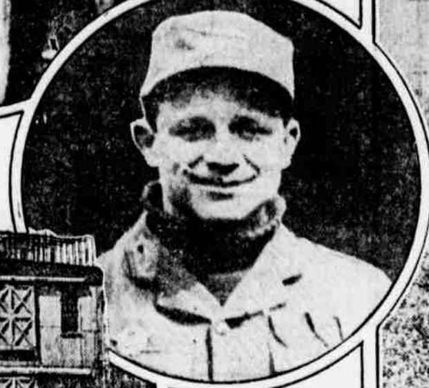
This latest photograph of Lieutenant Raoul Lufberry, of the Lafayette Escadrille, reaches America coincident with news of his having "winged" his twelfth German airplane.