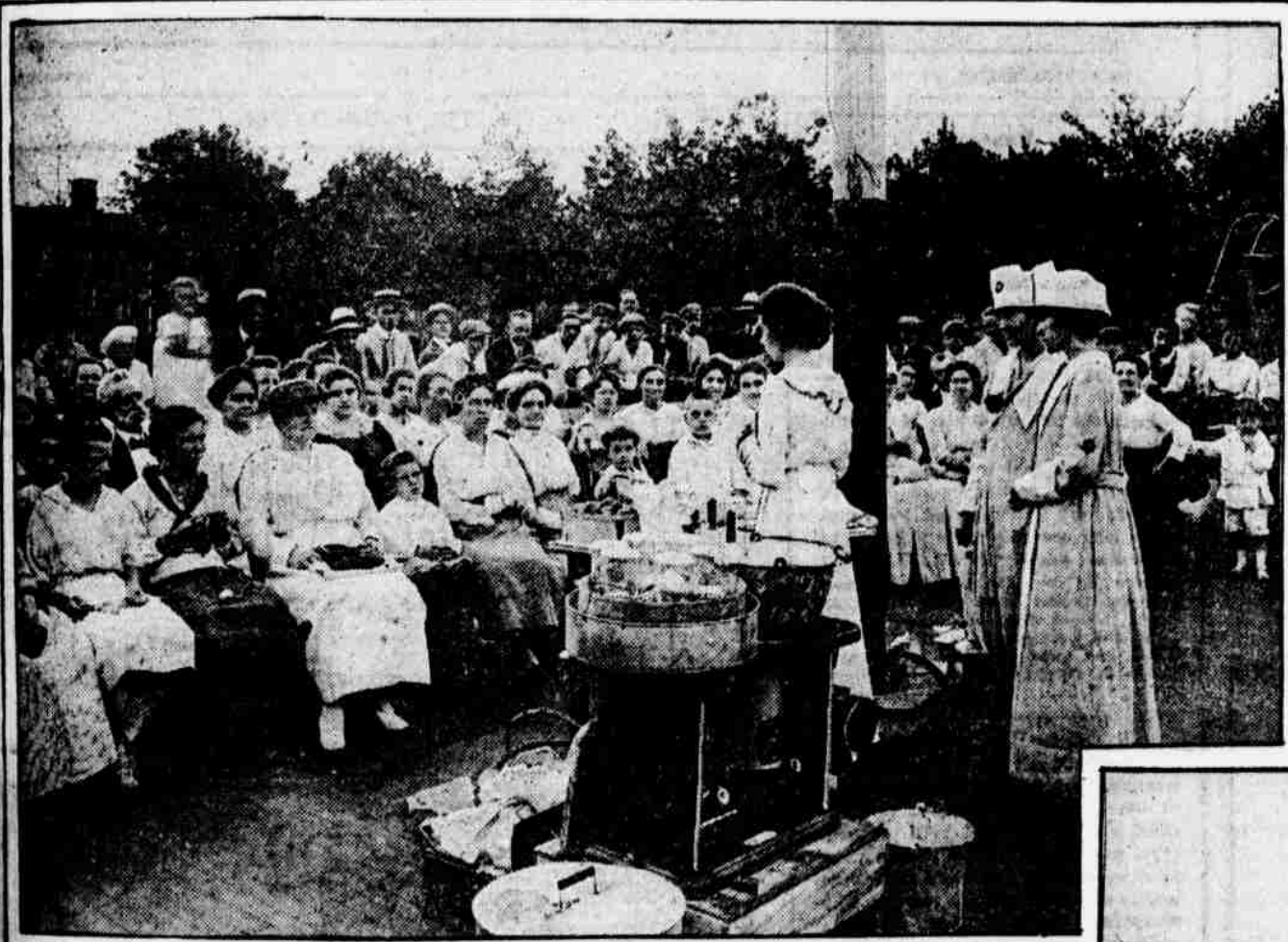
OPEN-AIR KITCHEN AIDS FOOD CONSERVATION CAMPAIGN

The plant of the Franklin Sugar Refining Company below South street is an up-to-date successor to the Harrison & Havemeyer establishment, at what once was Almond street wharf.