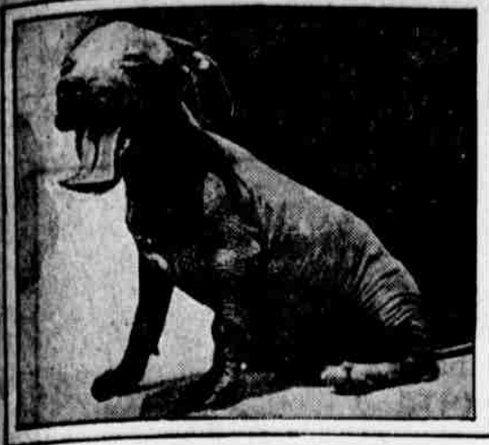
"SPICK," MASCOT AT CAMP DIX. This Mexican hairless dog is the pet of every member of the Sixty-sixth Truck Company, stationed at Wrightstown.