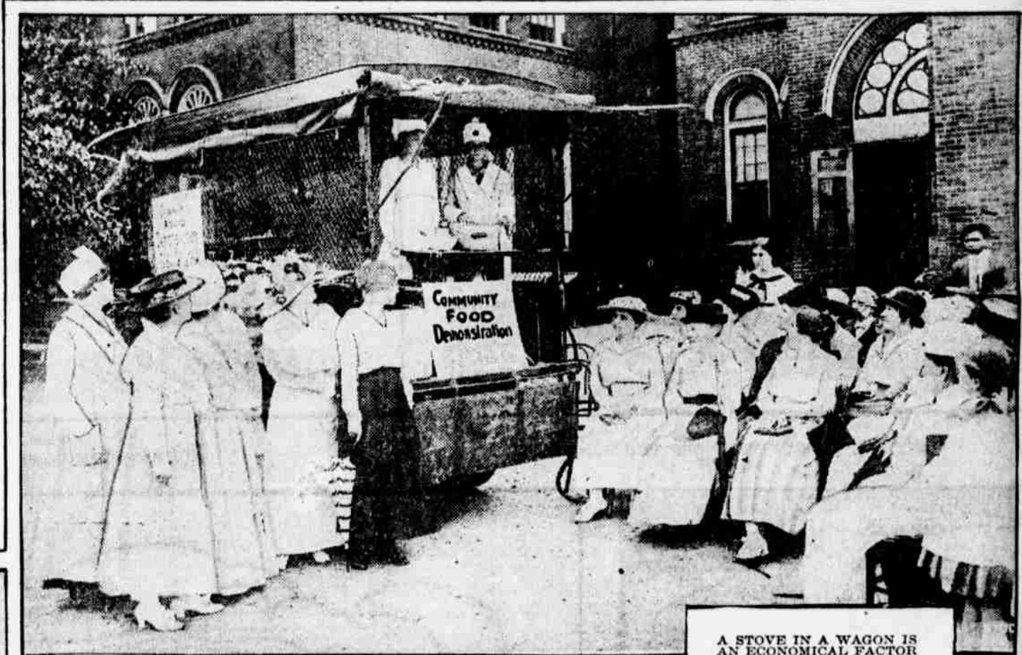
A STOVE IN A WAGON IS AN ECONOMICAL FACTOR THAT IS UTILIZED WITH GOOD RESULTS BY UNCLE SAM IN HIS FOOD CONSERVATION CAMPAIGN

From this practical culinary rostrum assistants in uniform are giving a demonstration in community work to an interested audience of city housekeepers.