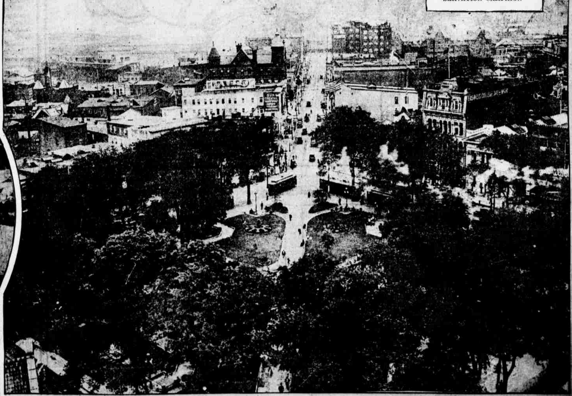
THE THROBBING CENTER OF A WIDE-AWAKE PENNSYLVANIA MUNICIPALITY

LEAGUE ISLAND IS BEING FORTIFIED AGAINST "ENEMY" INVASION. Marines surveying for trenches that are being dug outside the Navy Yard as part of the training for future duty "somewhere in France" or elsewhere.