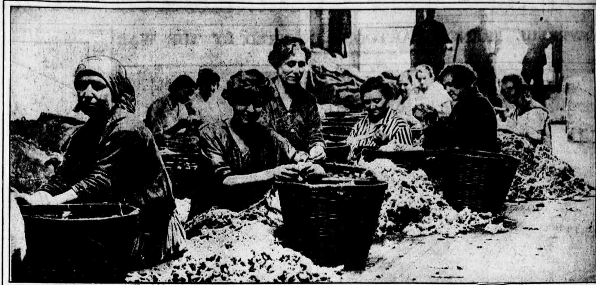
CONSERVATION IS NOW PRACTICED EVEN IN THE RAG SHOPS Women are employed to sort the wool from the cotton in the waste establishments of the city, the scene here pictured being one of the larger plants near Front and Arch streets.