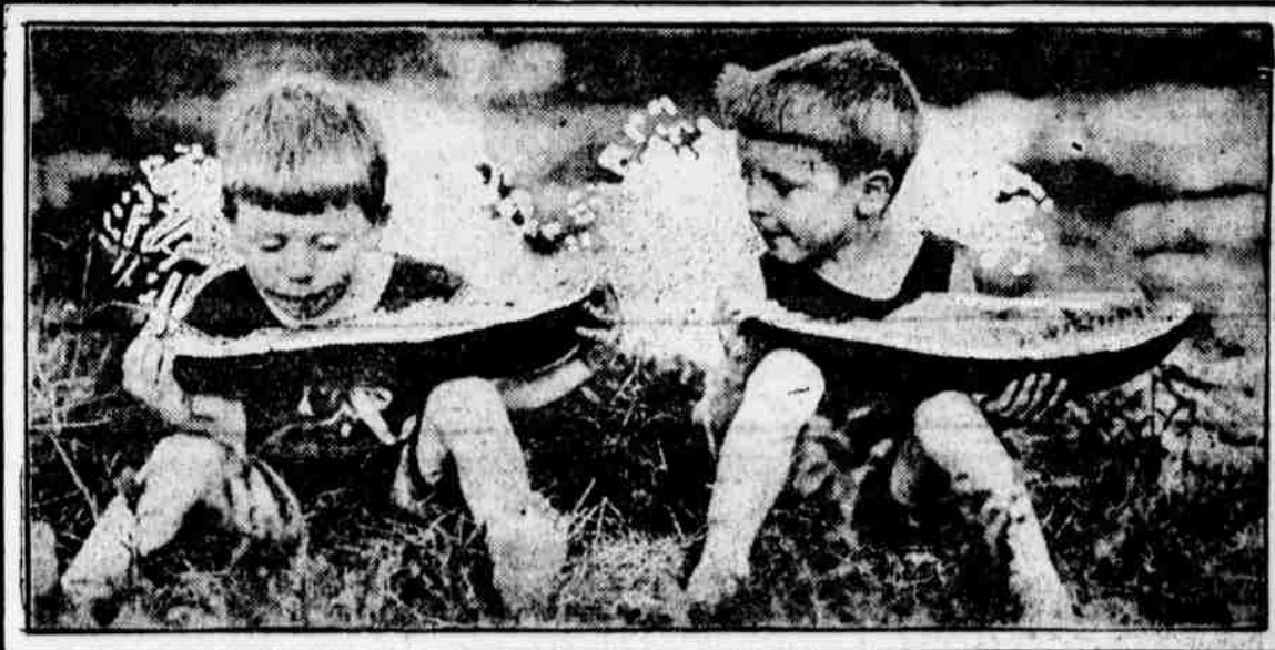
WHERE EVEN THE LOSER WINS A watermelon race carries compensation for all participants, whether prize-winners or not.