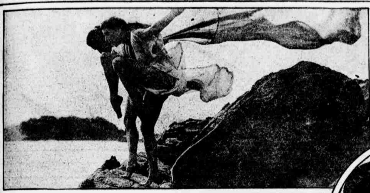
TWO OF MORGAN'S ART DANCERS IN A PICTURESQUE OUTDOOR PORTRAYAL, A FEATURE OF THE KEITH BILL