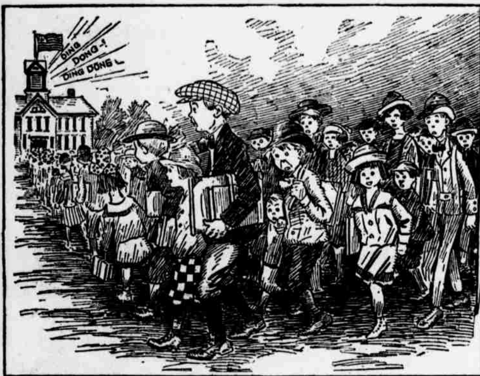
DRAFTED Brand in the Milwaukee Sentinel