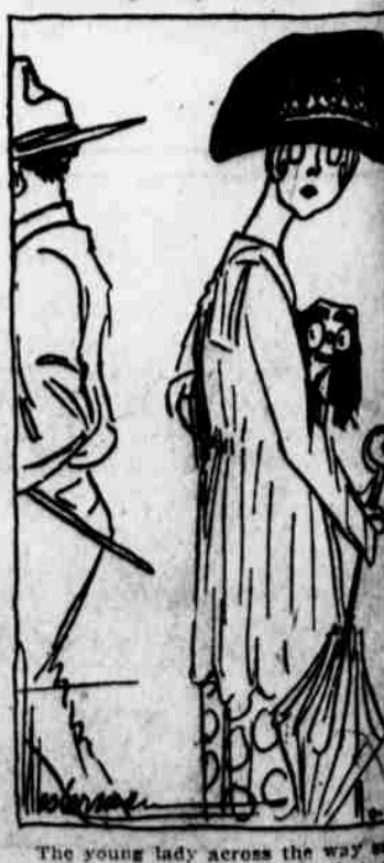
The young lady across the way The young lady across the way says some people seem to think that as long as prohibition would be unenforced, but her father's health would be ruined, but she's not drinking.