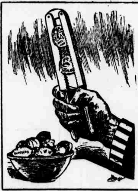
From the Liverpool Courier CRACK THESE NUTS!