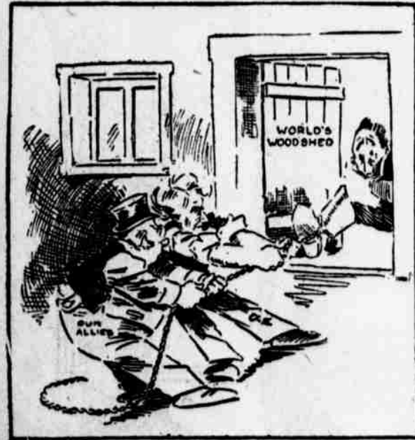
MERRY IN THE St. Joseph News-Press MORE UNION LABOR