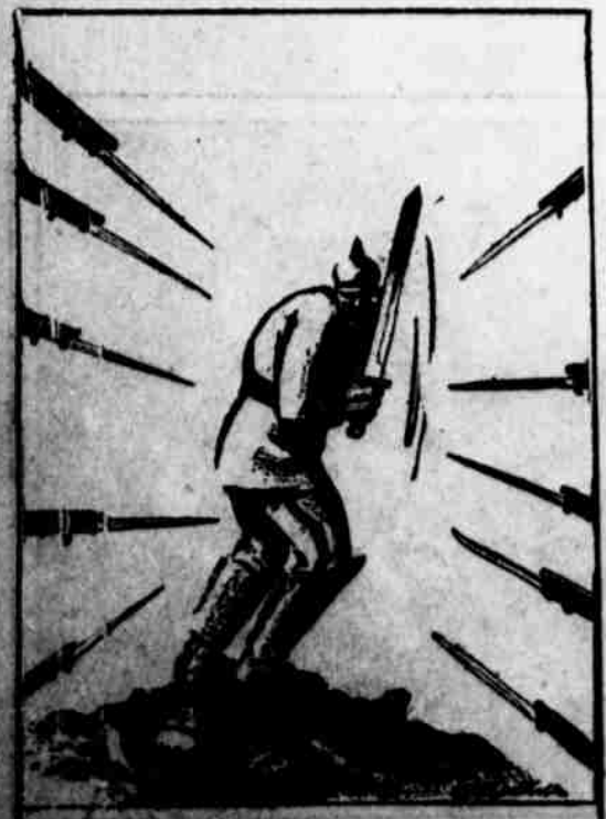
Planchard in the St. Louis Post-Dispatch THE WORLD ENEMY