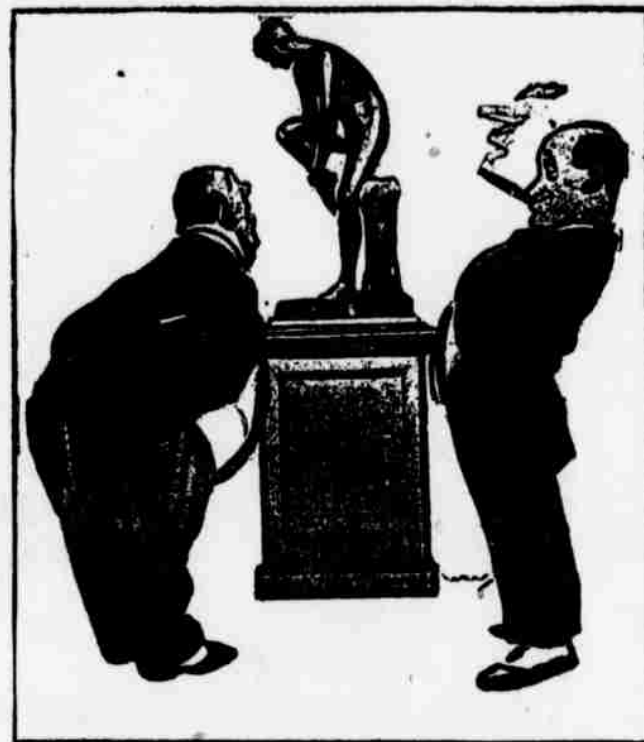
VISITOR: "THAT A NICE THING. WOT'S IT MADE OF?" PROFITEER: "OH! I MADE THAT OUT OF POTATOES." From London Opinion