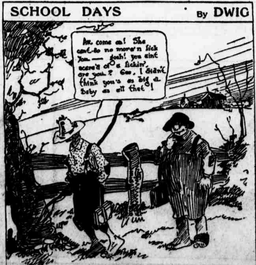
SCHOOL DAYS By DWIG