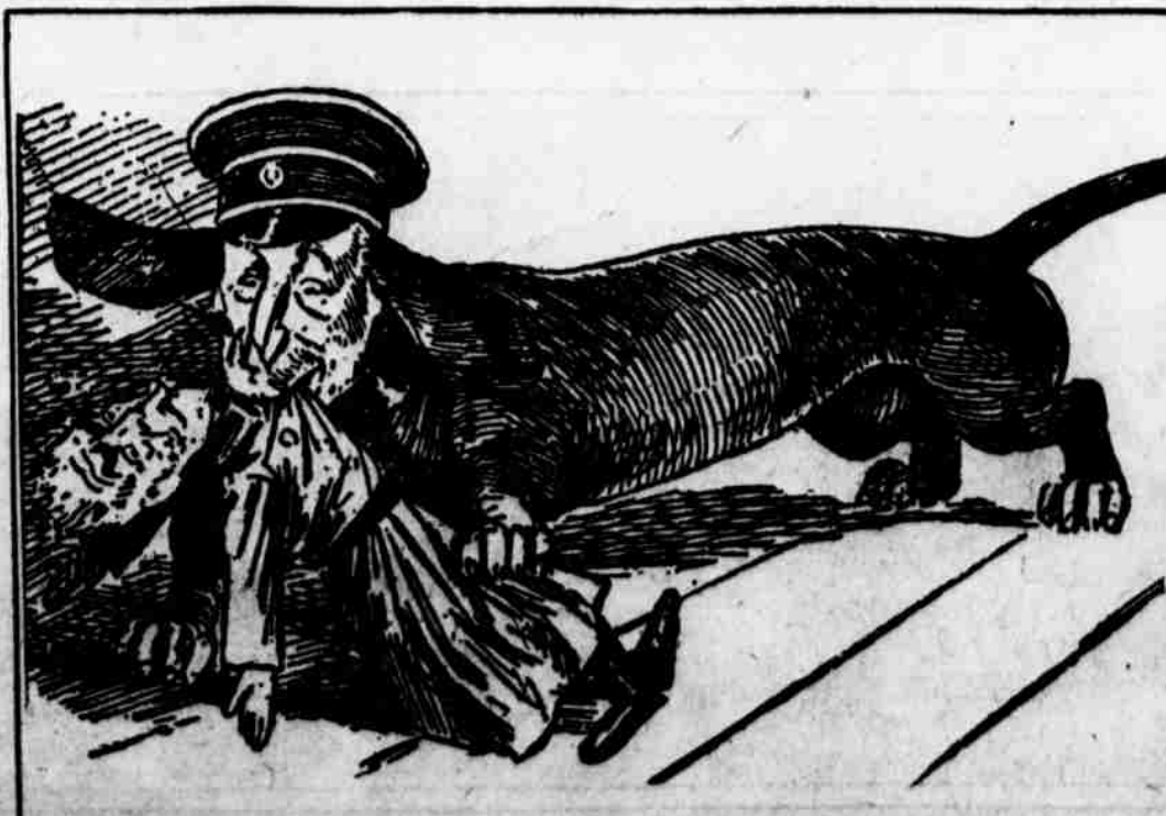
From the Westminster Gazette BETHMANN-HOLLWEG THROWN TO THE PUP