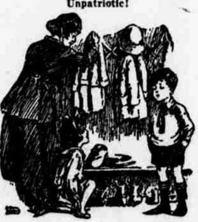
Unpatriotic! London Opinion. She (with pride)—I've had my tonsils out. I had two doctors come to do it. He—You ought to have out them yourself, silly, 'cos they want all the doctors to go to France now.