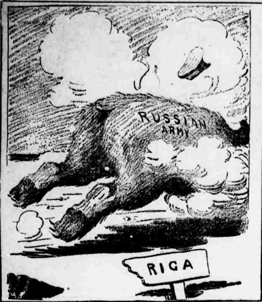
STILL IN THE RUNNING Harding in the Brooklyn Eagle

INSTEAD OF BENDING OVER THE TIRE PUMP THE POWERFUL KATRINKA FOUND IT EASIER TO WORK IT LIKE AN ACCORDION