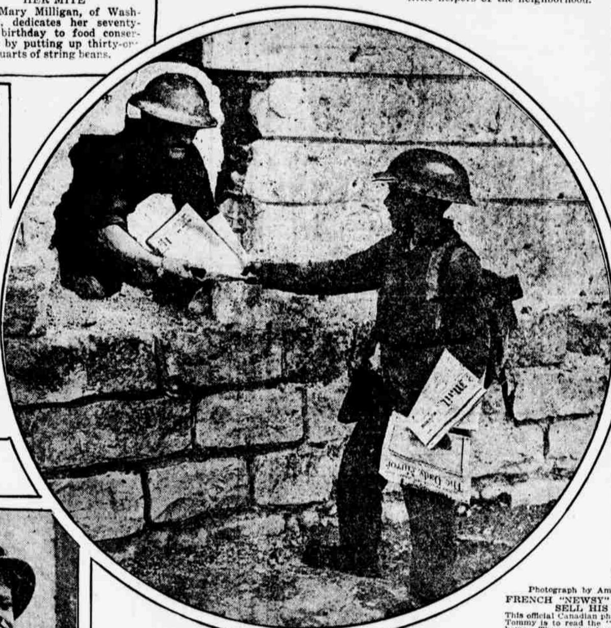
FRENCH "NEWSY" BRAVES BOMBS TO SELL HIS "EXTRAS" This official Canadian photograph shows how eager Tommy is to read the "latest" from England and home. The newsboy is equipped with steel helmet, which he dons when he enters the trenches.