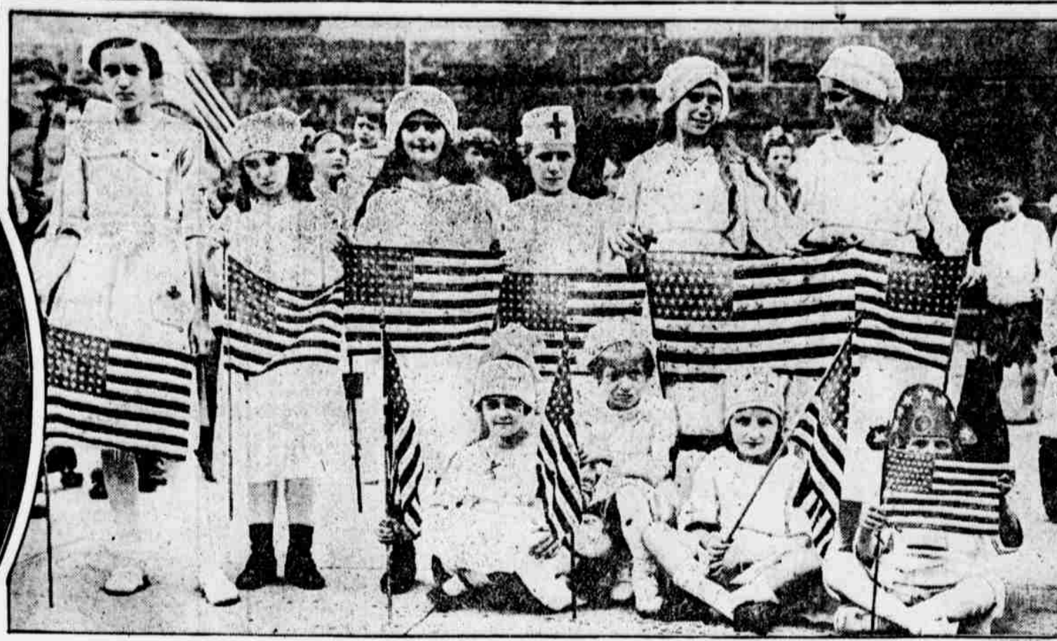
DEVOTE THEIR HOLIDAY TO HELPFUL WORK A feature of the closing exercises at the Sheridan Playground. The corps of Red Cross nurses, made up of the little helpers of the neighborhood.