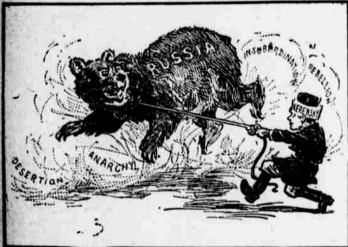
From Life (copyright). RUNNING WILD