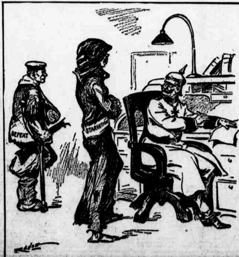
TWO WHO WON'T RESIGN