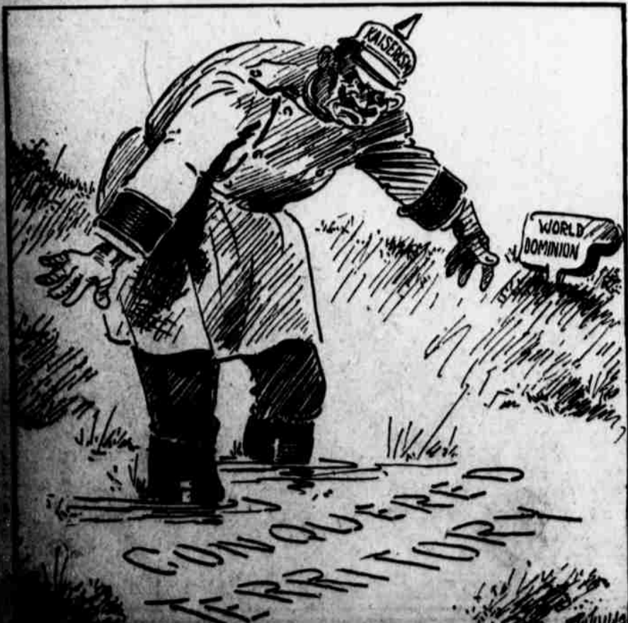
QUIGGAND Tutill, in the St. Louis Star.