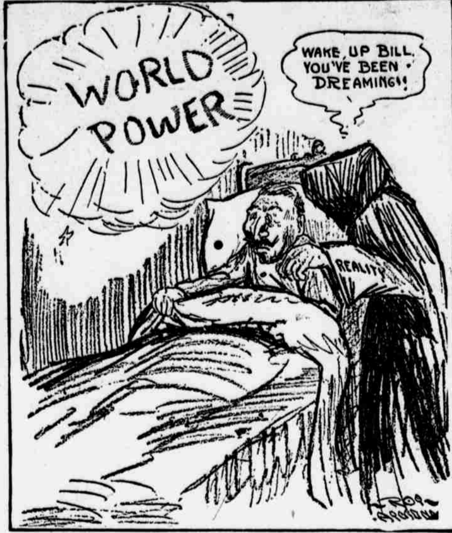
Aymond, in the New Orleans Daily States. THE AWAKENING