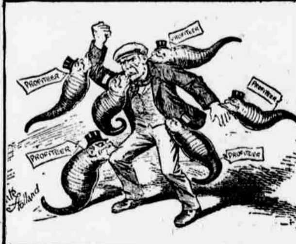
From John Bull. THE LEECHES AND THEIR VICTIM