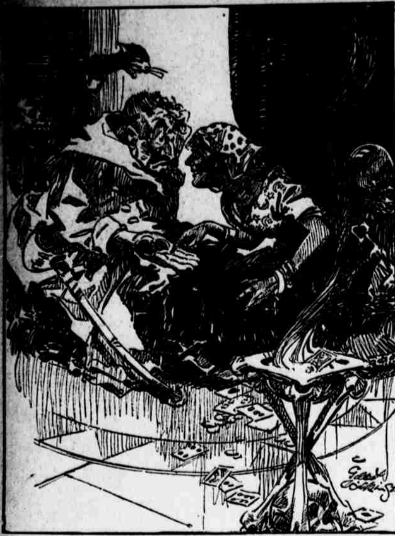
From the Passing Show (London). THE PALMIST: "YOUR HINDENBURG LINE IS BADLY BROKEN!"