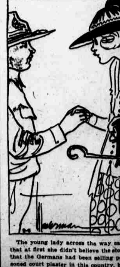
The young lady across the way says that at first she didn't believe the story that the Germans had been selling poisoned court plaster in this country, but she guesses it must be true, after all, as she overheard the doctor say that there are many active germ agents...