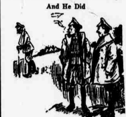
—Cassell's Saturday Journal. "Hello! What's happened to George?" "Oh, some idiot persuaded him to get under a mule to see why it didn't go."