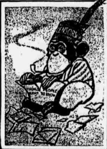
From London Opinion. THE MISCHIEVOUS MONKEY