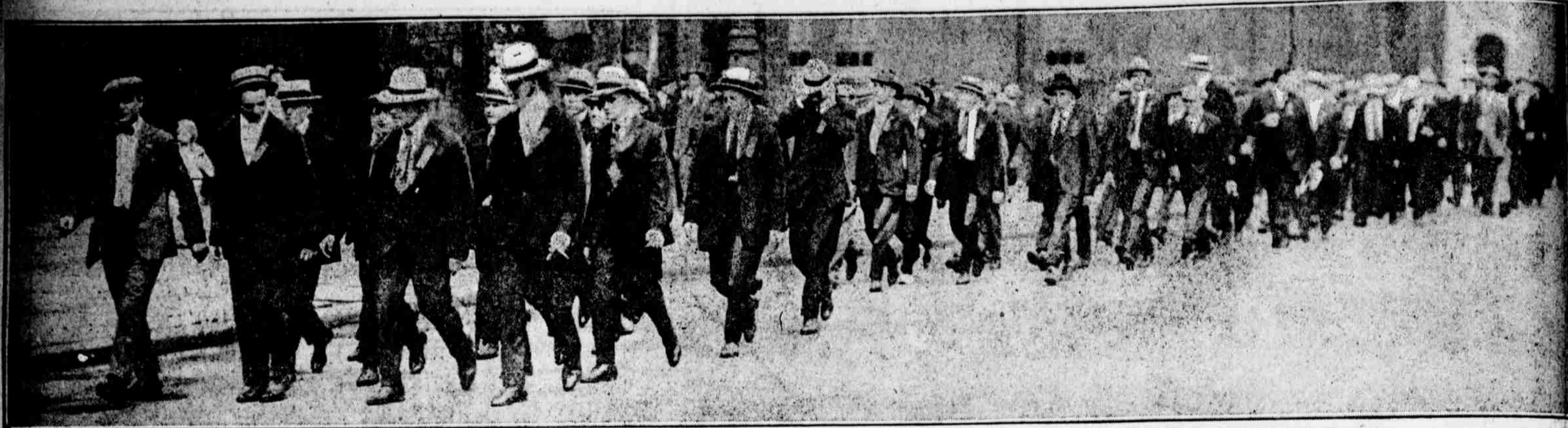
AMONG THE FIRST CONTINGENTS TO REPORT AT THE PLACE OF FORMATION IN THE LONG LINE WERE THE DRAFTED MEN FROM THE HISTORIC NORTHERN LIBERTIES DISTRICT

MARCHING FROM LIBERTY'S SHRINE, THEIR PATRIOTIC STEP PROCLAIMS AUTOCRACY'S DEATH KNEEL