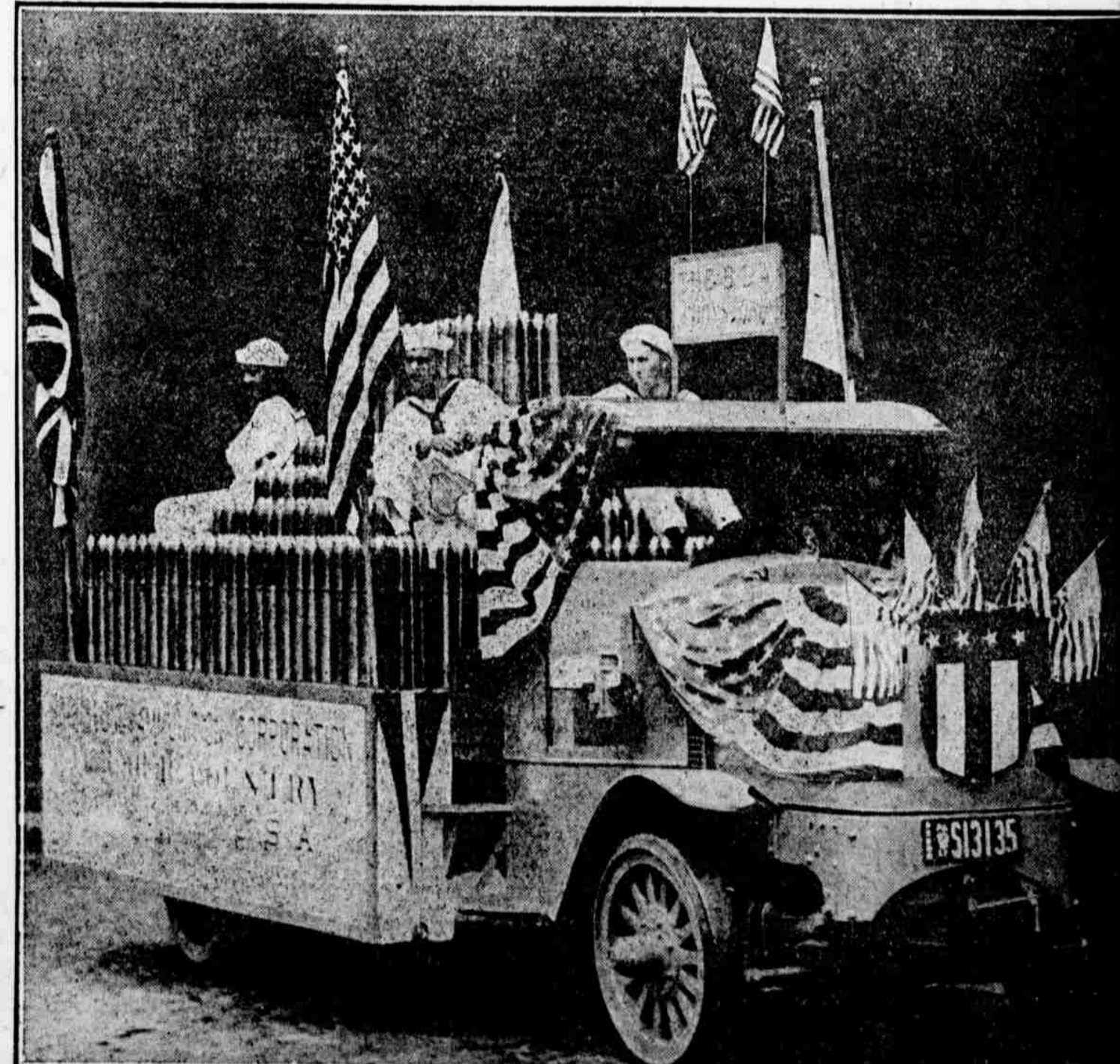
TO HELP THE BOYS WHEN THEY GO OVER THE TOP, EDDYSTONE CORPORATION FLOAT