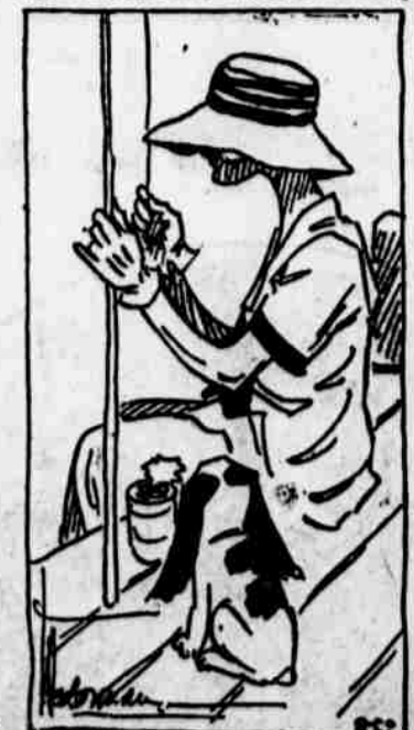
The young lady across the way says she imagines the airplane isn't so very dangerous if you have good, powerful brakes.