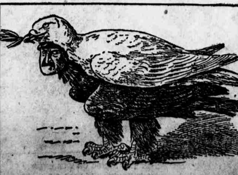
From the Westminster Gazette (English) CAMOUFLAGE

IT SEEMED AS IF THE BABY HAD GOT TIRED OF HIS PLAYHOUSE UNTIL HE AND THE POWERFUL KATRINKA INVENTED A GAME CALLED "CYCLONE"