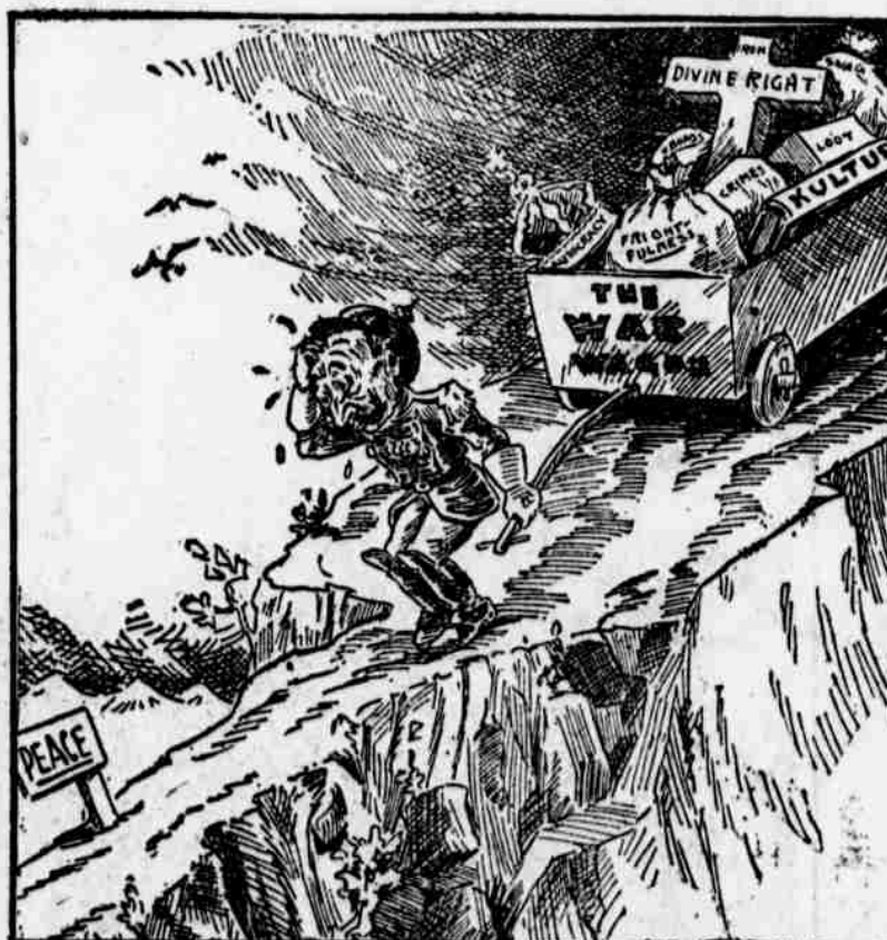
Page in the Nashville Tennessean SO FAR AND NO FARTHER