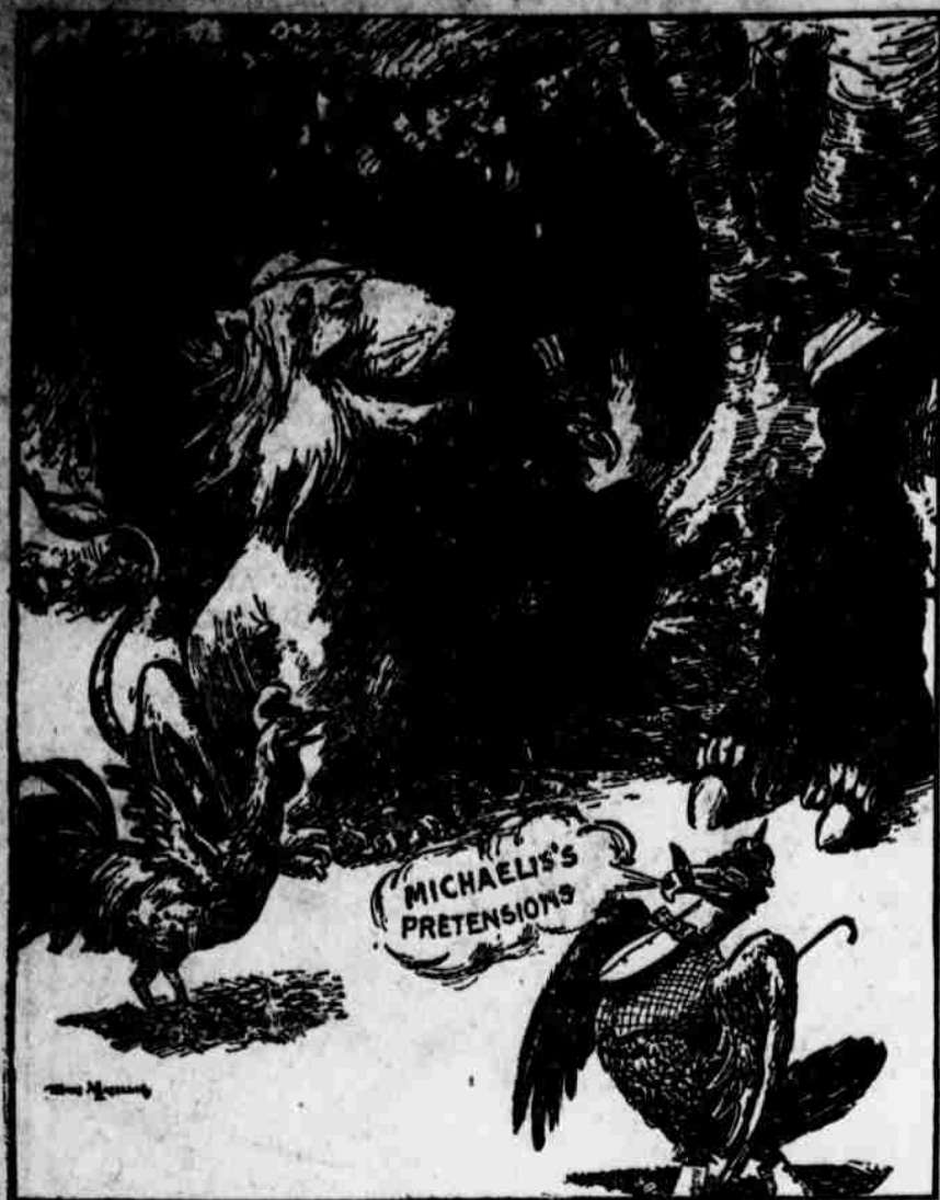
From the Passing Show (English) COMIC RELIEF