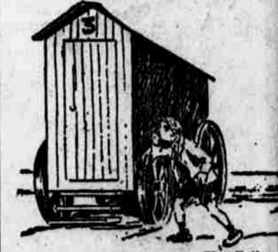
Very Rude Boy (bawling through crack in bathing machine)—Why aren't you in khaki?