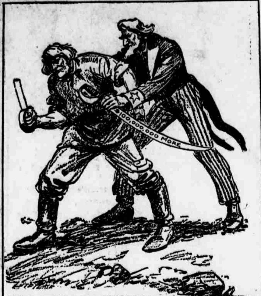
Lutepase in the Newark News "STAY WITH IT, PARD"