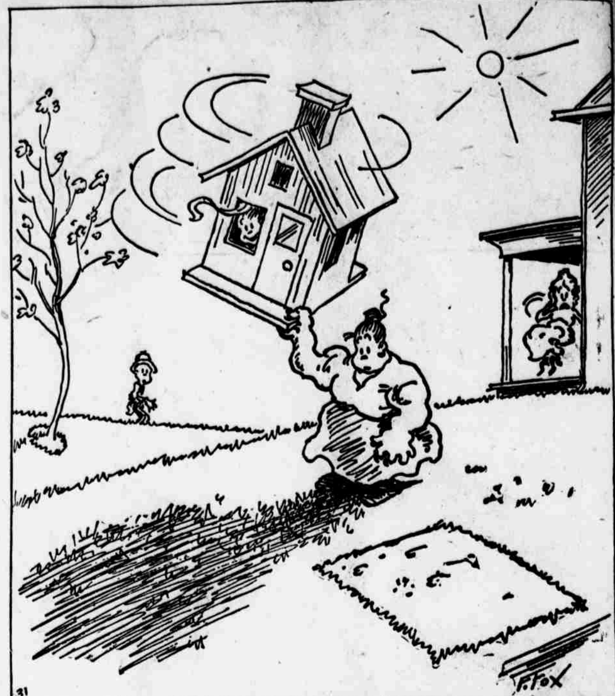
By FONTAINE FOX

IT SEEMED AS IF THE BABY HAD GOT TIRED OF HIS PLAYHOUSE UNTIL HE AND THE POWERFUL KATRINKA INVENTED A GAME CALLED "CYCLONE"