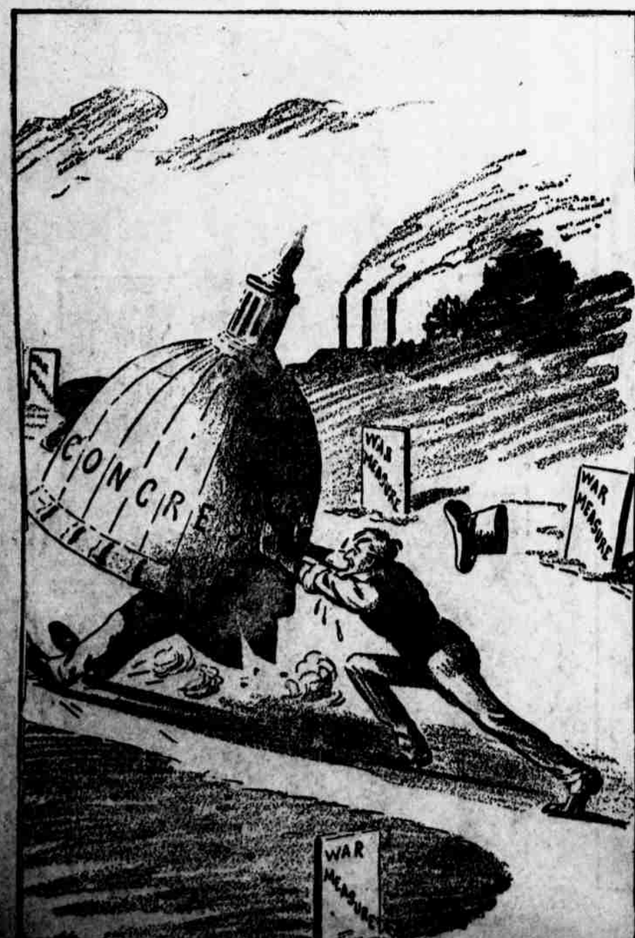
Harding in the Brooklyn Eagle THE BIG PUSH