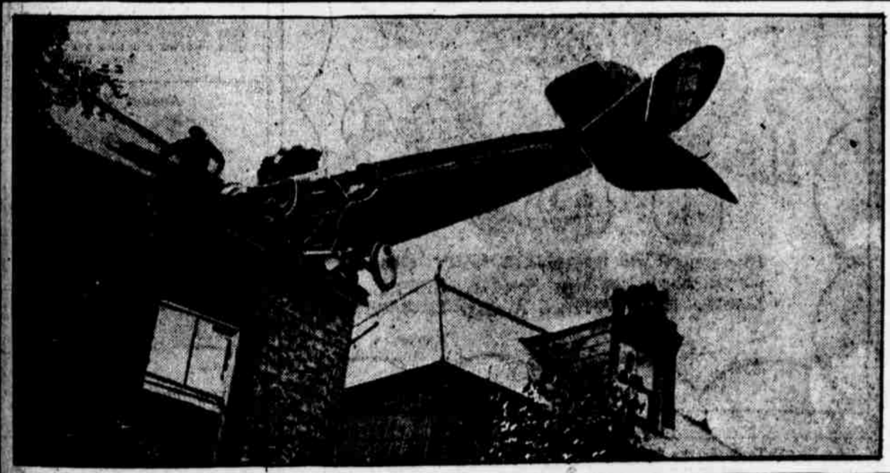
AN UNEXPECTED VISITOR MAKES A CALL. This airwasp enters a bedroom in a house on Lebanon road, Twickenham, England, without the formality of knocking. The pilot escaped with slight injuries.