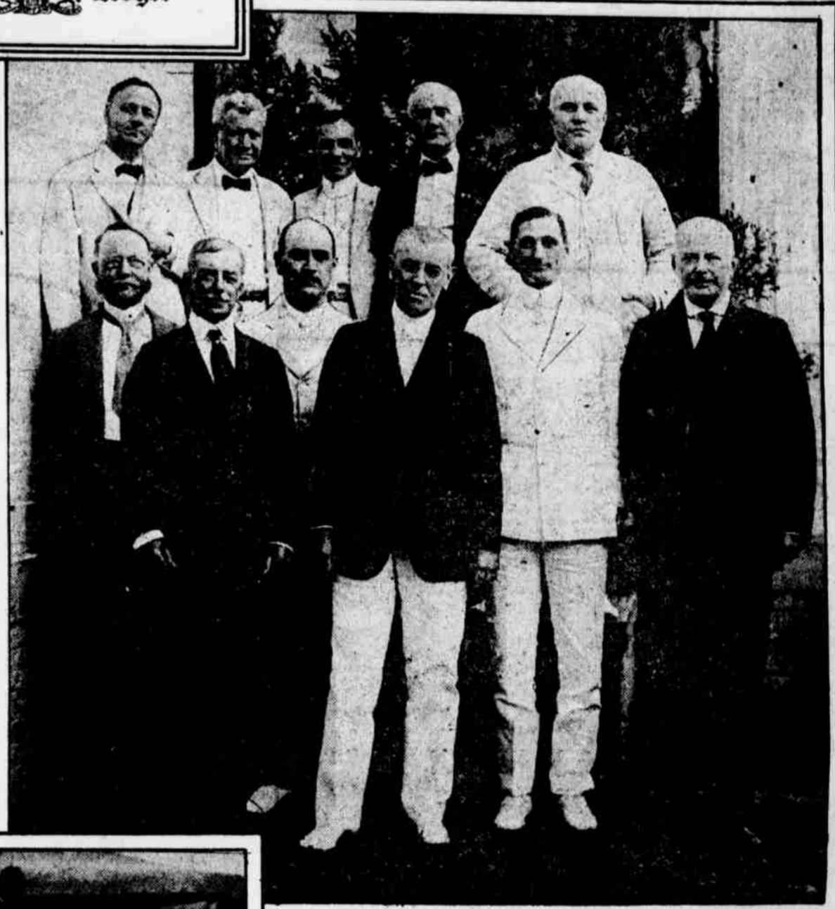
CABINET'S FIRST OUTDOOR PHOTOGRAPH President Wilson and his official family grouped in the rear of the White House executive offices. Left to right, front row: W. C. Redfield, Secretary of Commerce; Robert Lansing, Secretary of State; D. F. Houston, Secretary of Agriculture; President Wilson; W. G. McAdoo, Secretary of the Treasury; Albert S. Burleson, Postmaster General. Top row: Josephus Daniels, Secretary of the Navy; W. B. Wilson, Secretary of Labor; Newton D. Baker, Secretary of War; T. W. Gregory, Attorney General, and Franklin K. Lane, Secretary of the Interior.