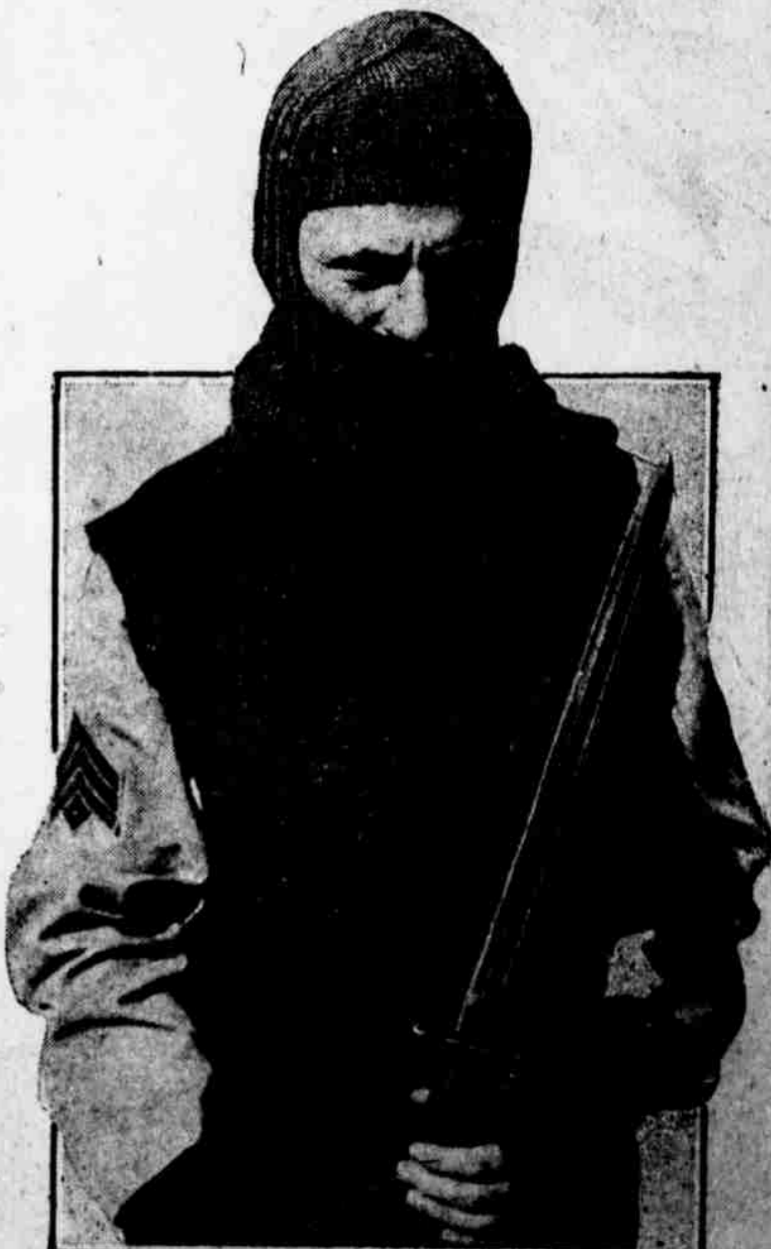
AN ADVANCE SHOWING OF TRENCH STYLES Made in Philadelphia by patriotic women knitters, these woolen scarfs, head coverings and sleeveless sweaters are already in favor with Sammees on the French front.