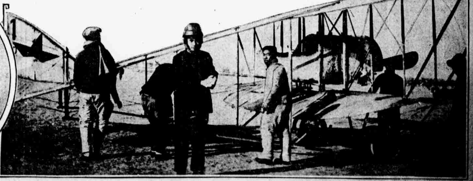
FROM KITE FLYING TO AVIATION AT A BOUND China's rapid strides in military development are exemplified in a striking manner by her aviation schools, having introduced this most modern innovation in warfare with considerable success. Her student flyers and schools are demonstrating their efficiency and have added to the efficiency of the Celestial army.