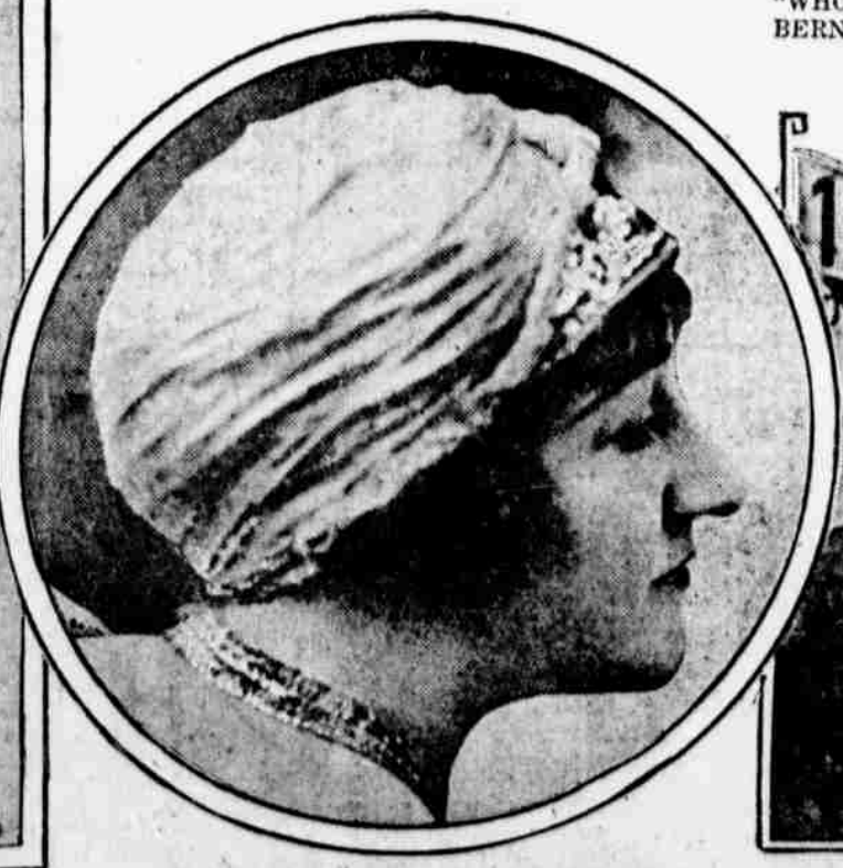
A GLIMPSE OF GERTRUDE VALERIE, A HEADLINER ON THE BILL AT THE WILLIAM PENN