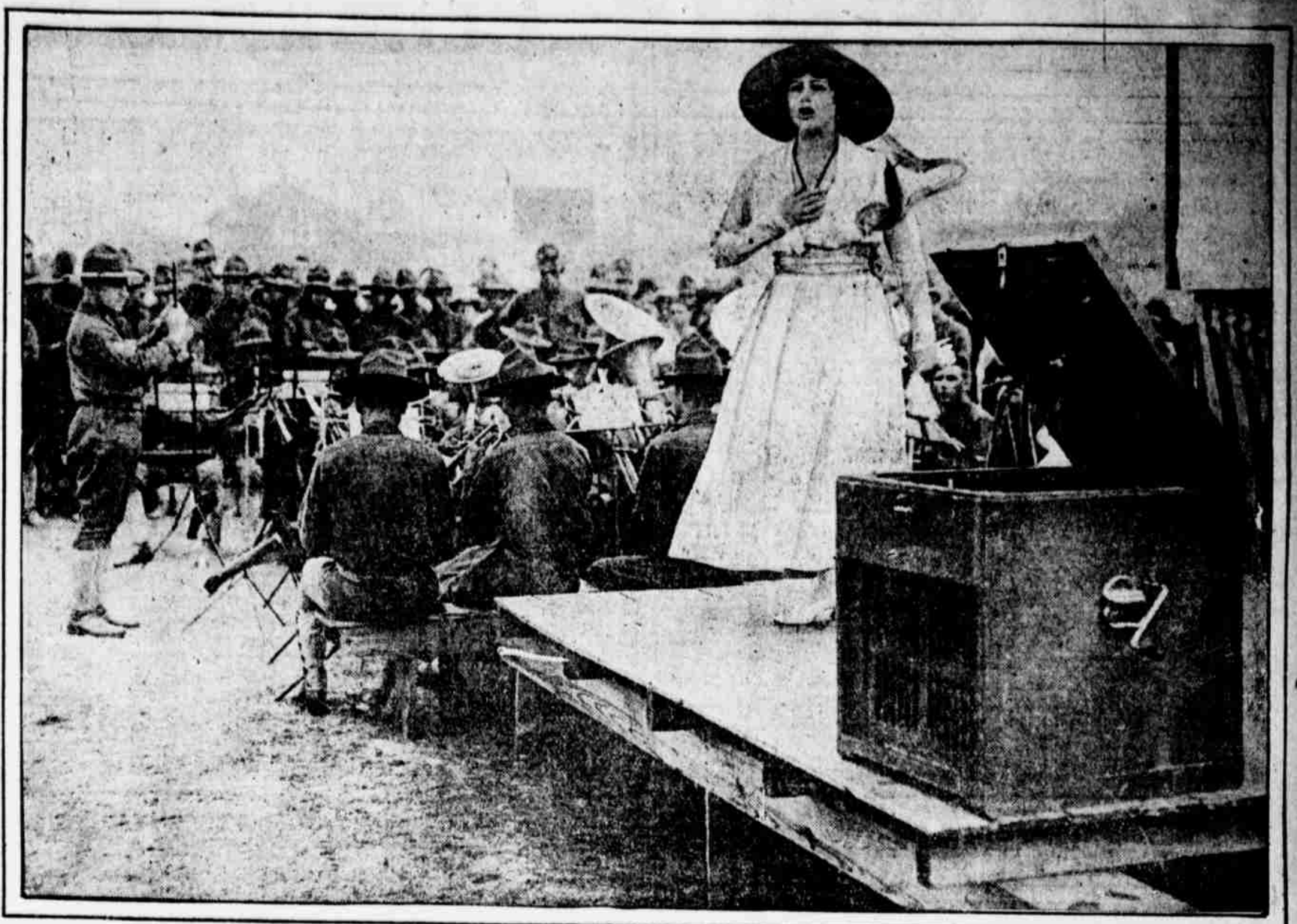
SOLDIER BOYS ENJOY OPERATIC CONCERT IN THEIR CAMP Miss Anna Case, famous American soprano, presents the national guardsmen encamped "somewhere in New Jersey" with a war phonograph, which plays her record of the "Star Spangled Banner" while she sings the words of the national anthem.