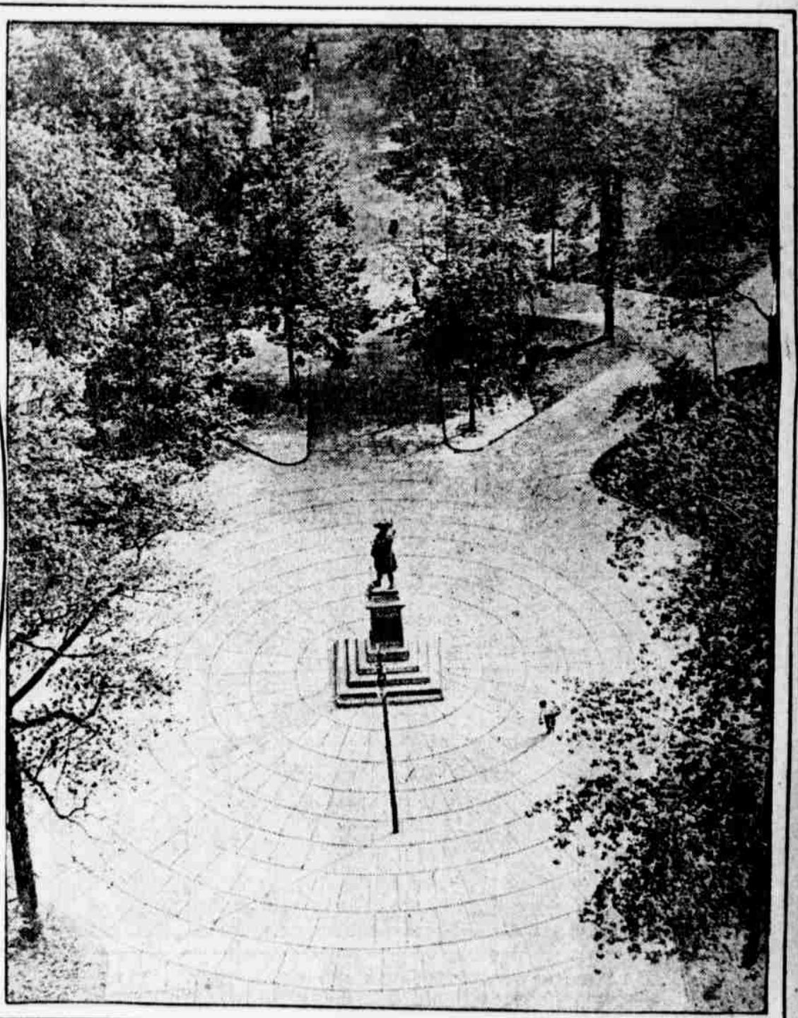
LOOKING DOWN FROM THE BELFRY OF INDEPENDENCE HALL Remarkable photograph obtained by an EVENING LEDGER staff photographer showing how the Barry statue and Independence Square appear from an observation point in the historic bell tower.