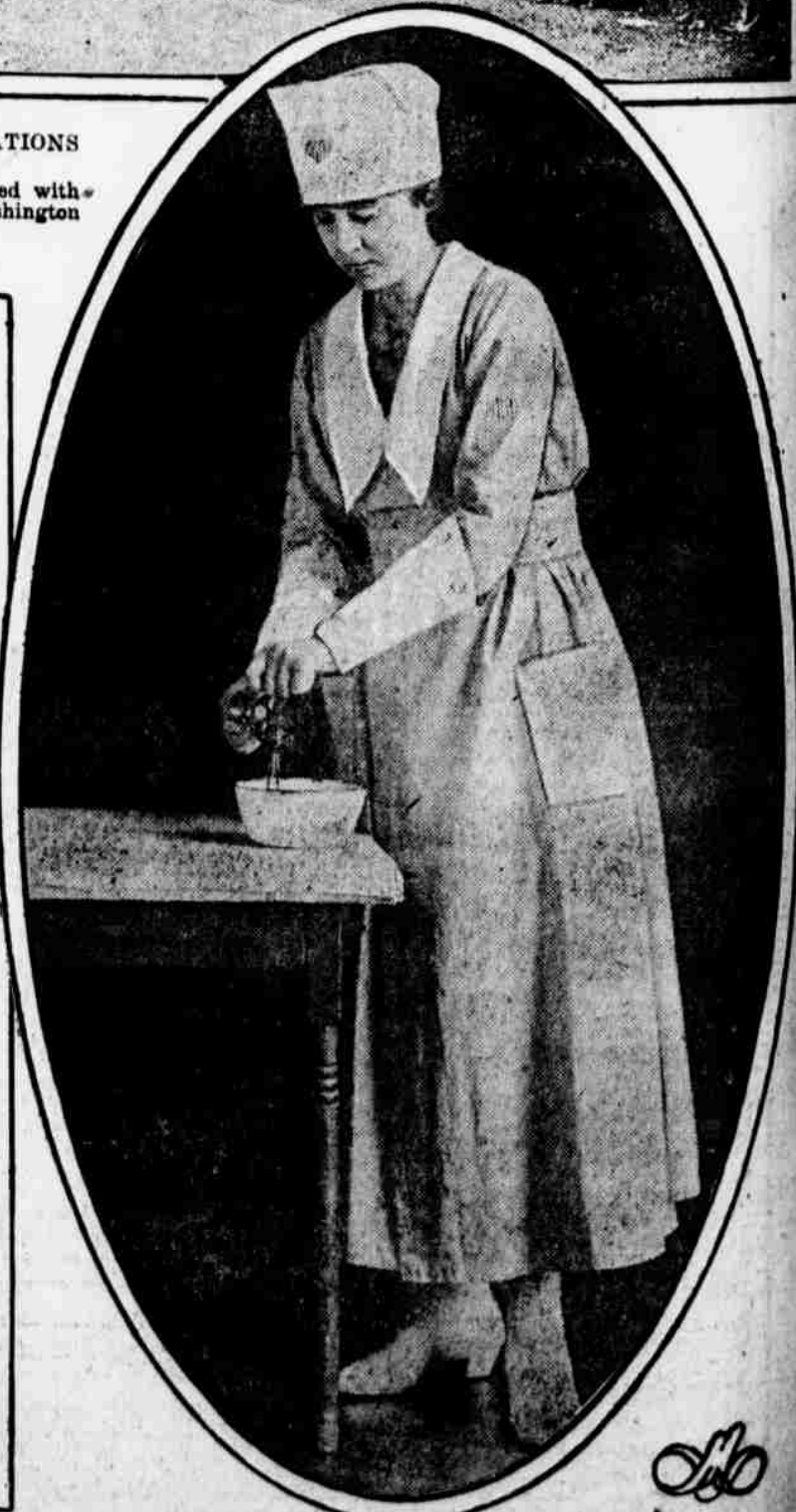
GARB OF THE FOOD CONSERVATION FORCES Official uniform of the conservation section of the food administration, which is rapidly being adopted by women in all parts of the country as serviceable and economical.