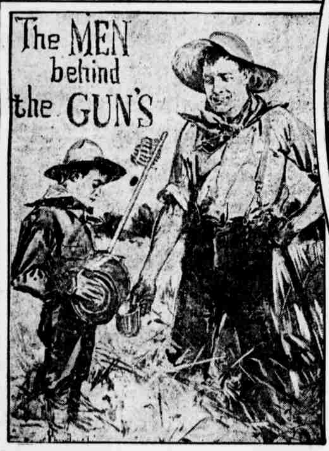
"THE MEN BEHIND THE GUNS" Howard Chandler Christy's contribution to the food conservation cause is inspiring recruits through its pertinence and humor.