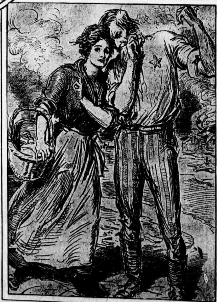
"A WORD TO THE WISE" Charles Dana Gibson portrays, through Uncle Sam's whispered caution to the American housewife, a hint of the nation's loss through waste.