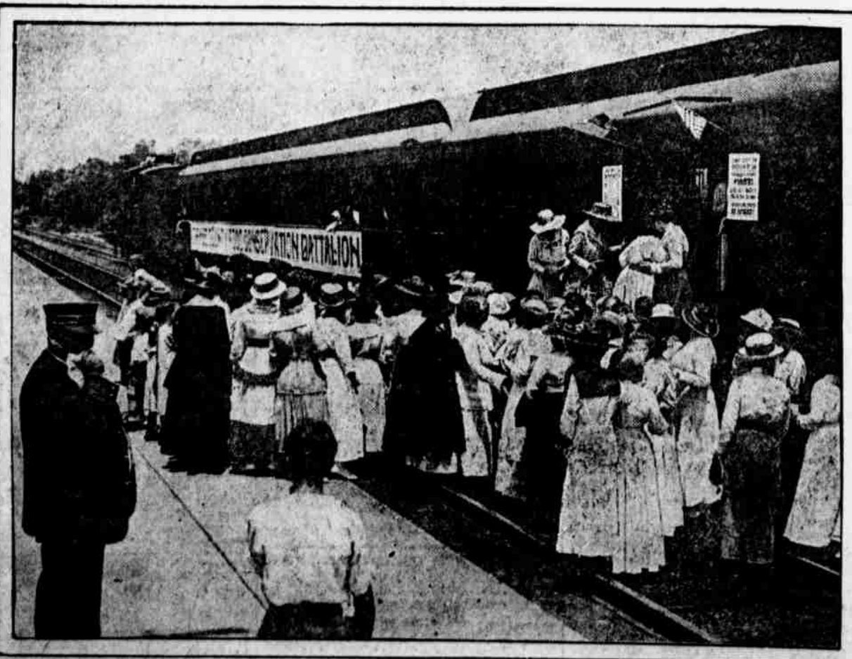
SOCIETY WOMEN ARE TOURING THE COUNTRY IN ITS BEHALF In their food conservation and preparation campaign prominent women are touring interior New York. They travel in the "Orange County Canning Special," using the train platforms as rostrums for brief talks on canning and preserving of food.