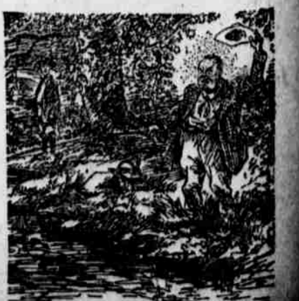
There Are Bites—and Bites

—Cassell's Saturday Journal. "Had a bite yet, Bill?" "Millions."