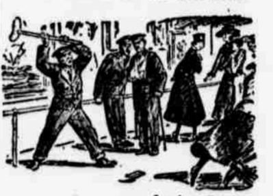
The Power of the Beautiful

—London Opinion. No—this is not a fight, but Private Smith criticizing a popular war painting in this year's academy.