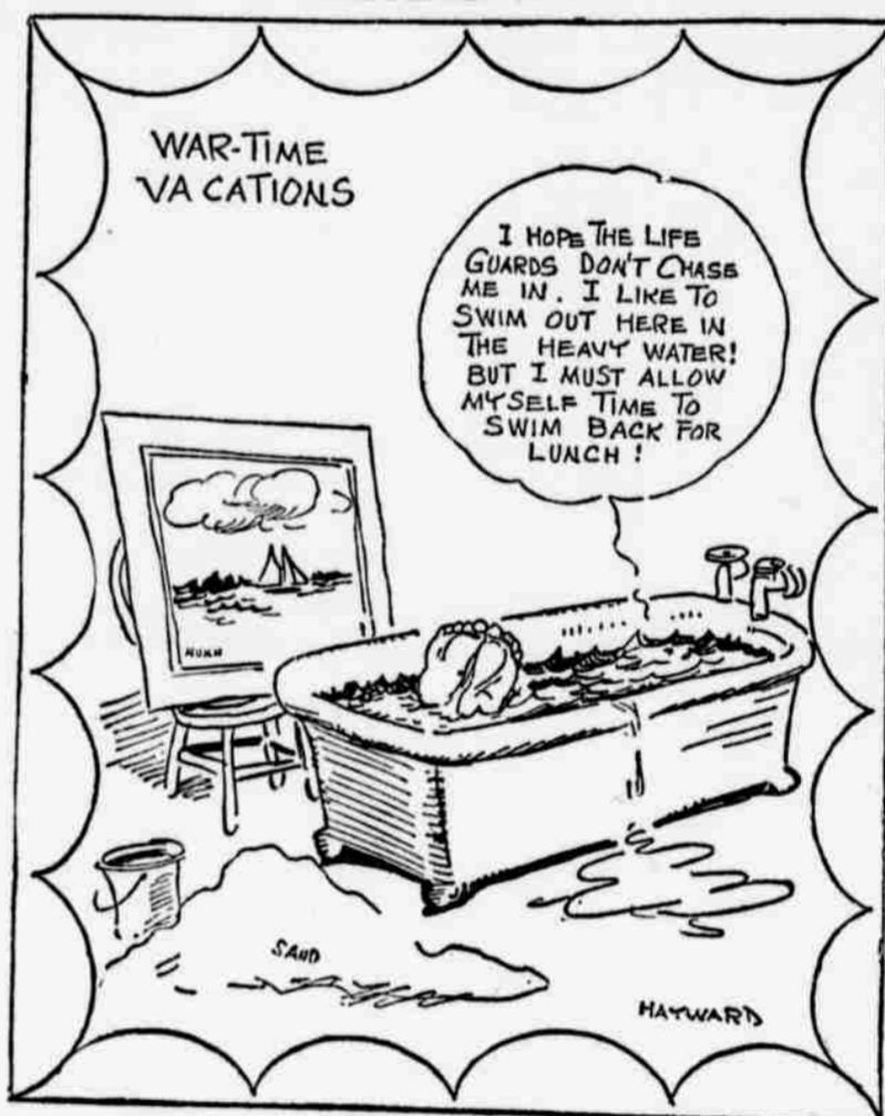
WAR-TIME VA CATIONS

I HOPE THE LIFE GUARDS DON'T CHASE ME IN. I LIKE TO SWIM OUT HERE IN THE HEAVY WATER! BUT I MUST ALLOW MYSELF TIME TO SWIM BACK FOR LUNCH!