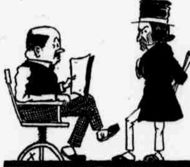
And "Death" the Third

Ham Actor —I had a great reception after my recital last night. The audience shouted "Fine! Fine!" Manager —Good thing you didn't recite again. Ham Actor —Why, what do you mean? Manager —They would have shouted "imprisonment!" the second time.