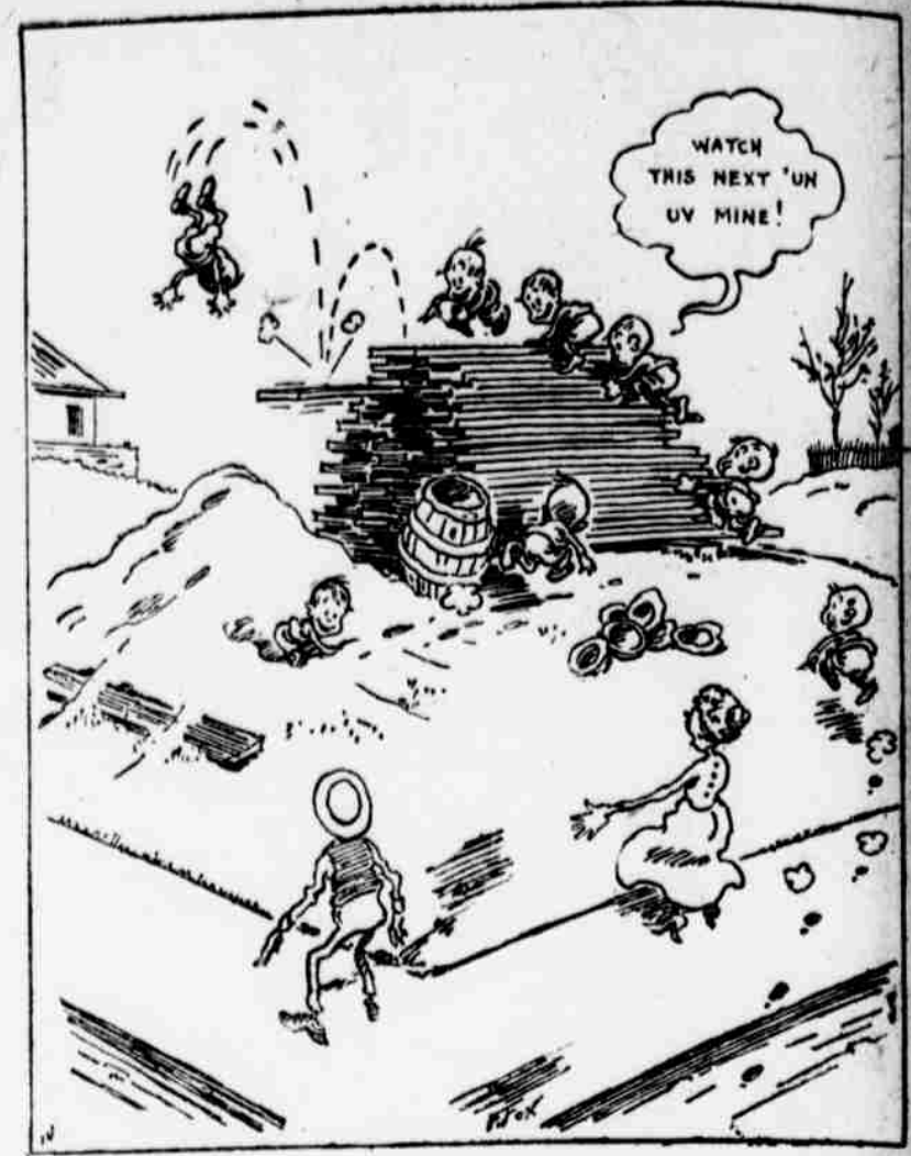
BY FONTAINE FOX (Copyright)