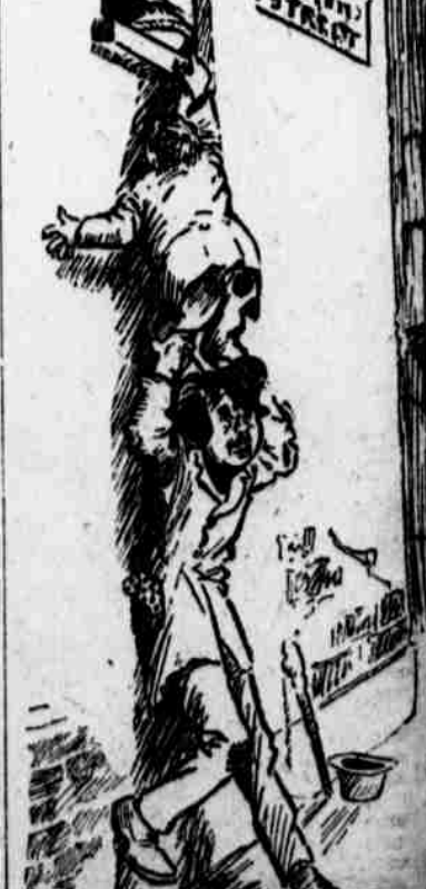
—The Postman. Lanky Patrick (to his friend)—I don't see no sense in...