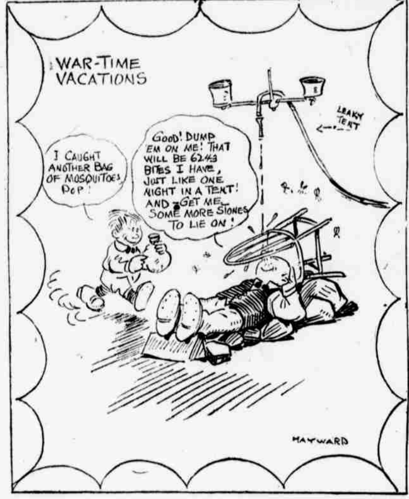
THE PADDED CELL

Two Wives "My wife is like George Washington; I don't believe she could tell a lie to save her soul." "You're lucky! Mine can tell a lie the minute I get it out of my mouth." —Columbus Citizen.