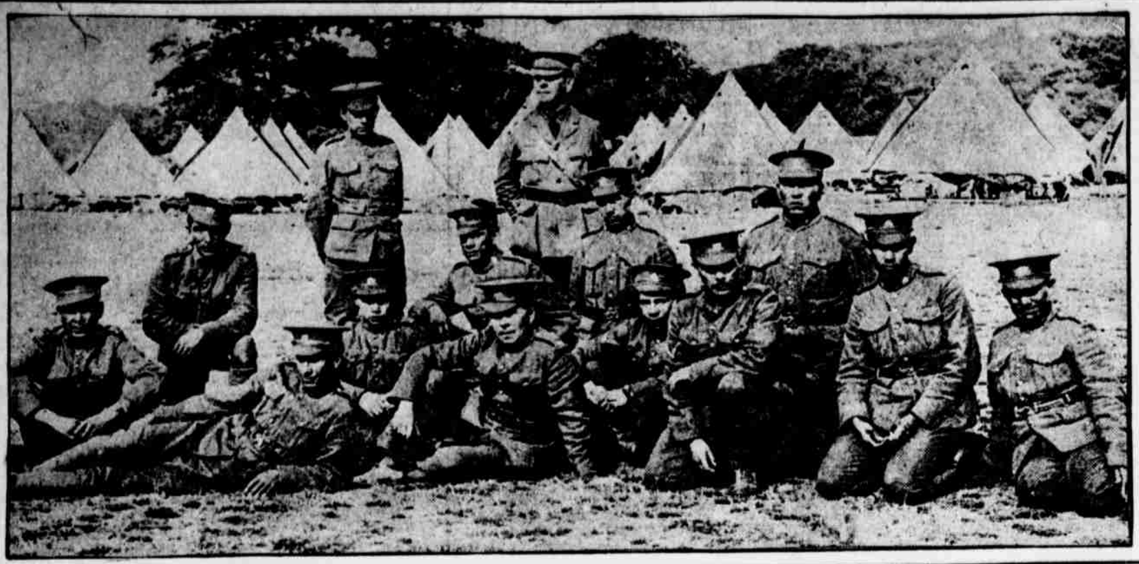
AMERICAN INDIANS WEAR KHAKI NOW IN PLACE OF THE OBSOLETE WAR PAINT Lieutenant F. Onondayon, an Indian chief of the Mohawks, whose name means "Beautiful Mountain," and a group of fellow Indians at their camp in England.