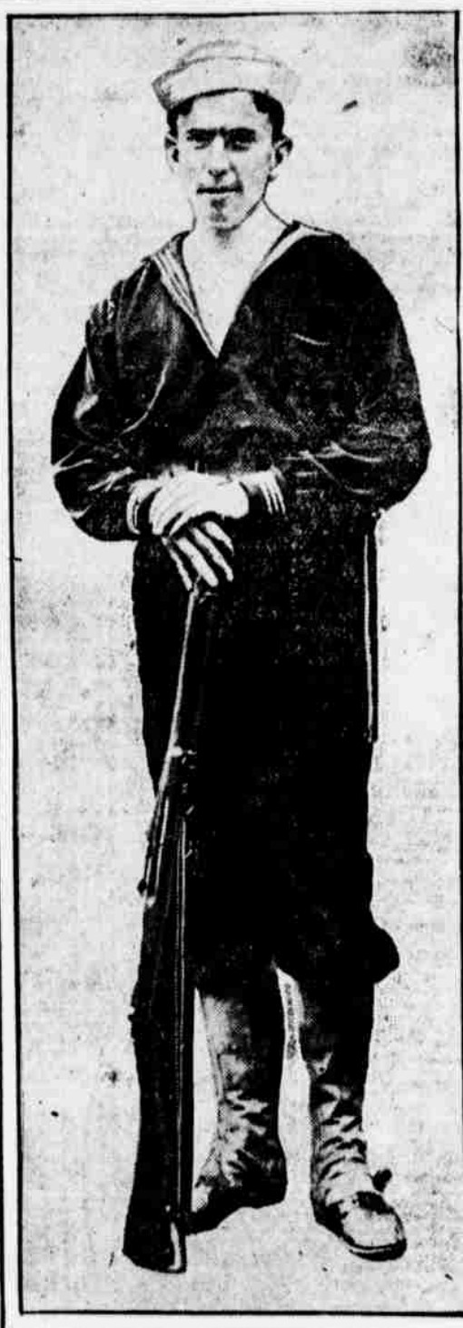
FROM COURT TO THE SEAS Maurice McLoughlin, champion tennis player, has joined the Naval Reserves on the Pacific coast.