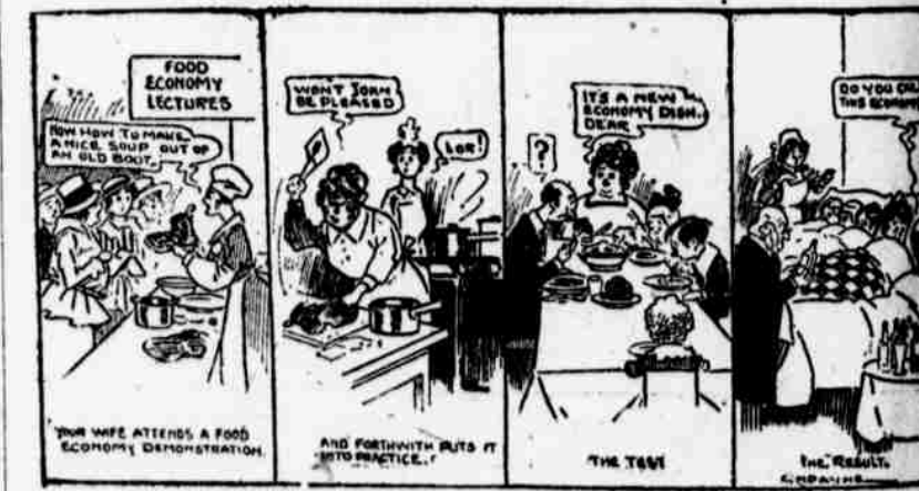
—Cassell's Saturday Journal.