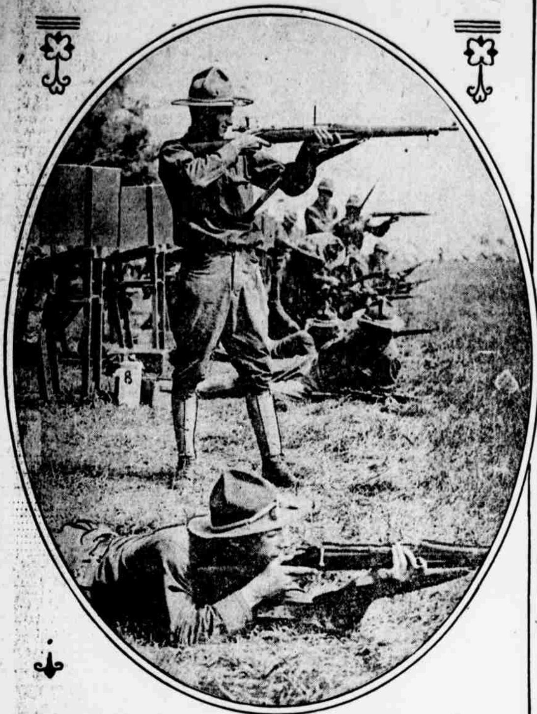
COMPANIES C AND B, THIRD REGIMENT, OF CAMDEN, DISPLAY THEIR MARKSMANSHIP ON THE RIFLE RANGE