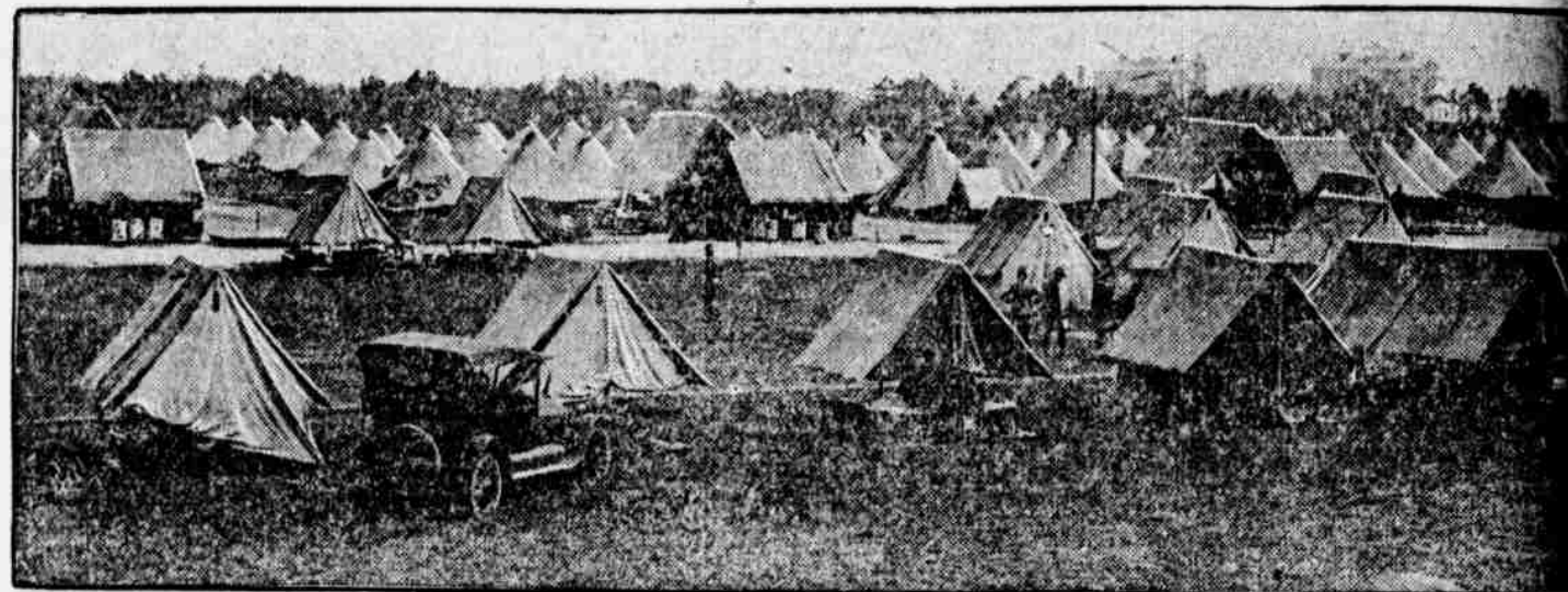
A SECTIONAL VIEW OF THE CAMP, WITH THE QUARTERS OF THE MEN AND OF THEIR EQUIPMENT OCCUPYING A CENTRAL POSITION