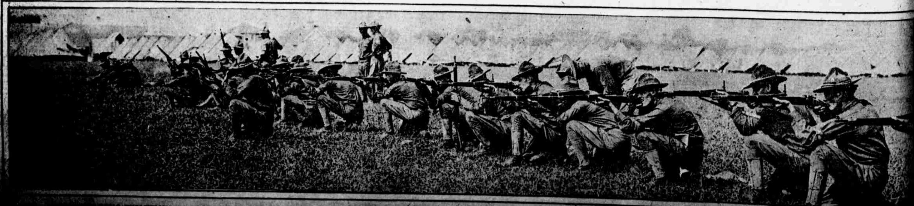
EVOLUTIONS, AS EXHIBITED BY COMPANIES A AND B OF THE THIRD REGIMENT, OF CAMDEN, EVOKED HIGH PRAISE FROM THE GOVERNOR AND THE MEMBERS OF THE REVIEWING PARTY