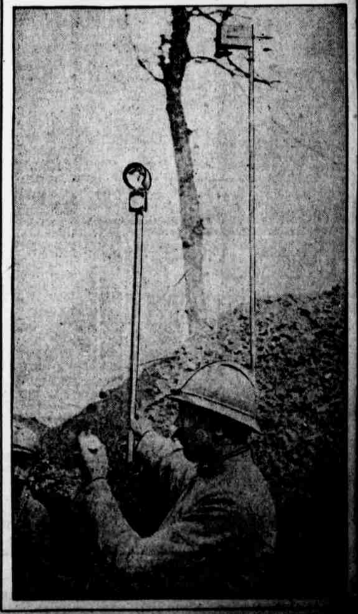
A FEW UNCONVENTIONAL SNAPSHOTS TAKEN BY AN AMERICAN WHO SERVED WITH THE POILUS UNDER JOFFRE AND PETAIN